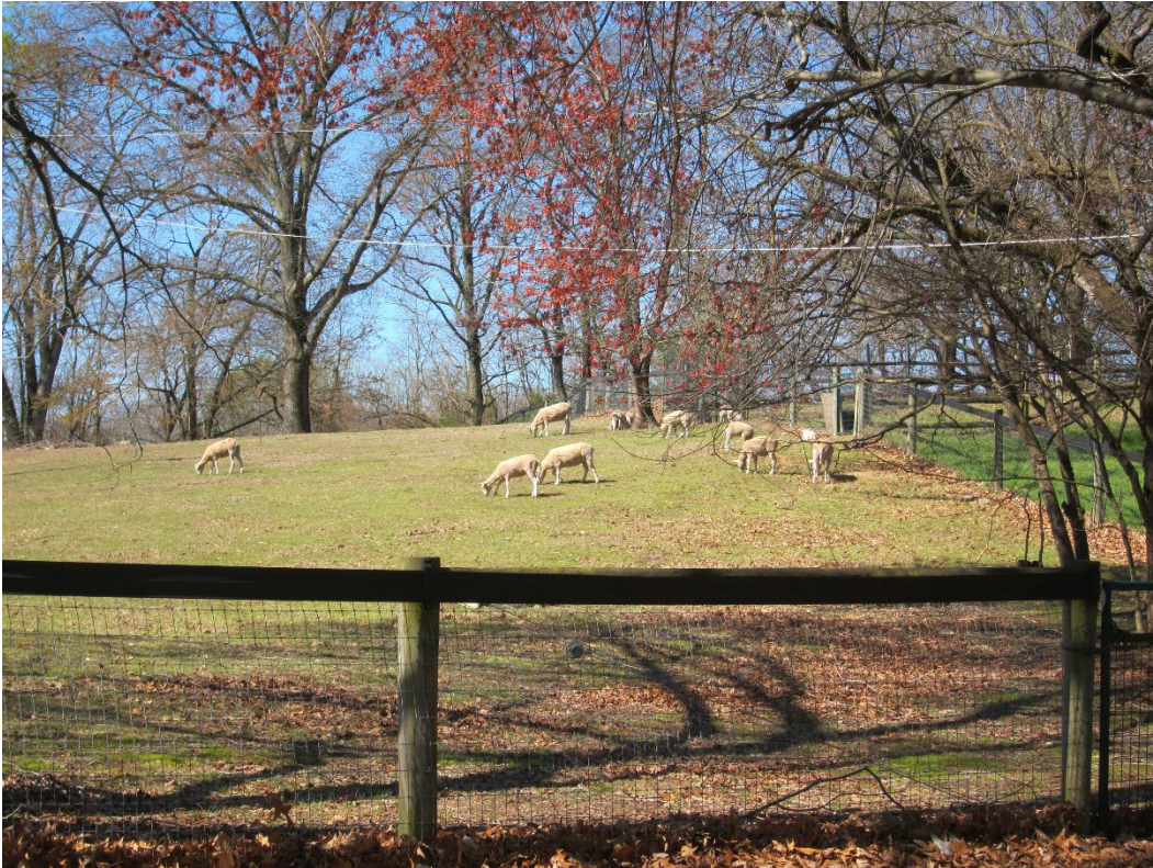
Scenic view of pasture near the intersection with Riding Stable Road