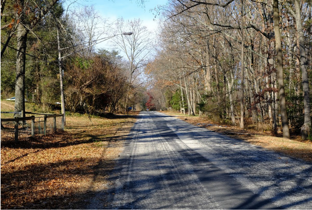
View looking northwest on Aitchenson Road