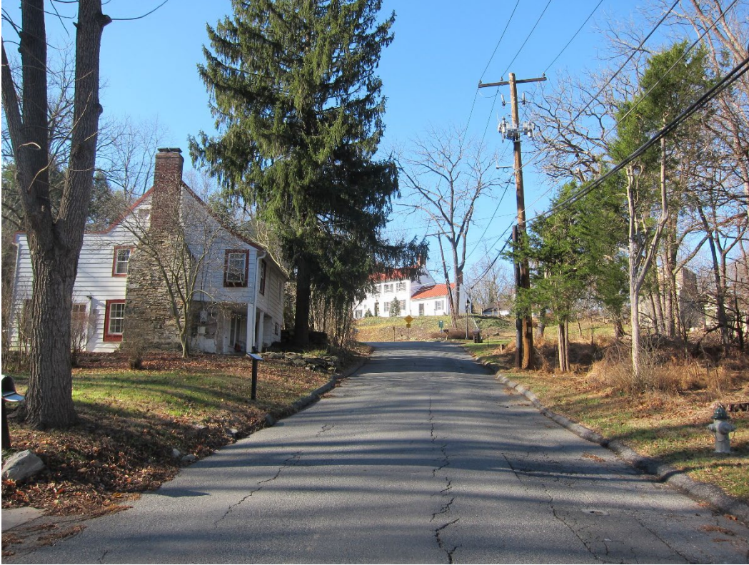
View of Brighton Dam Road looking west toward the Town of Brookeville