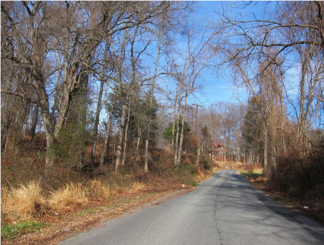
Exceptional rustic portion of Brighton Dam Road heading east