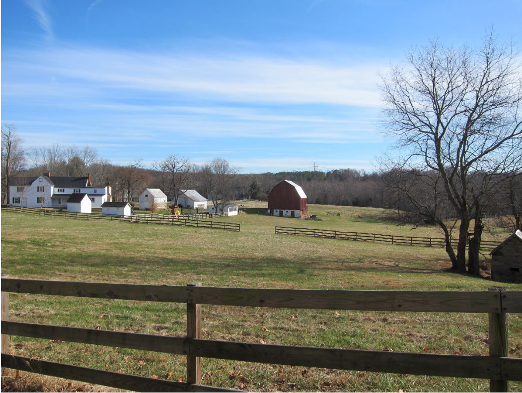
View across field to historic Holland Farm