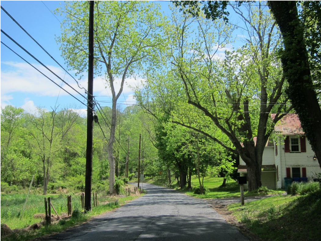
View looking east of house close to the road