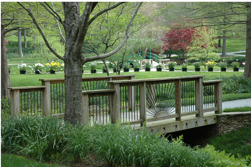
Gibbs sunburst wooden bridge, Atlanta, GA Atlanta Decking Company