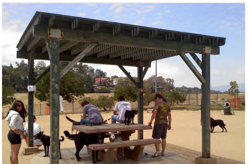
Clockwise from top left: Double-gated dog run entrance; shade sail installation; dog play equipment; gazebo with picnic table and benches; water play area.