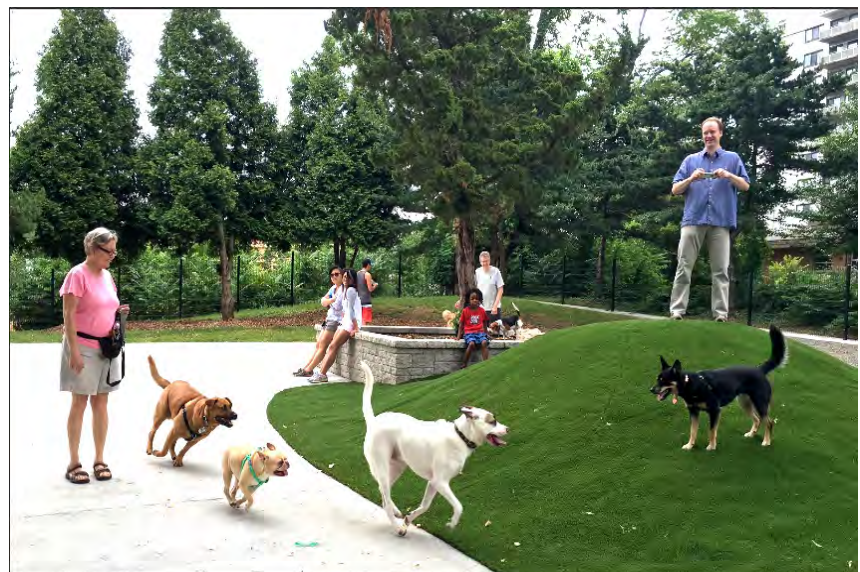
Elsworth Urban Dog Park, M-NCPPC, Silver Spring, MD