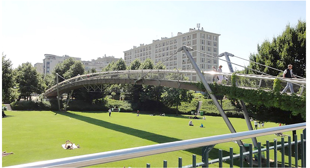
Le Jardinde Reuilly, La Coulee Verte Paris, France