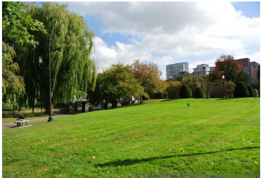
Large open grass area, Boston Public Garden, Boston, MA