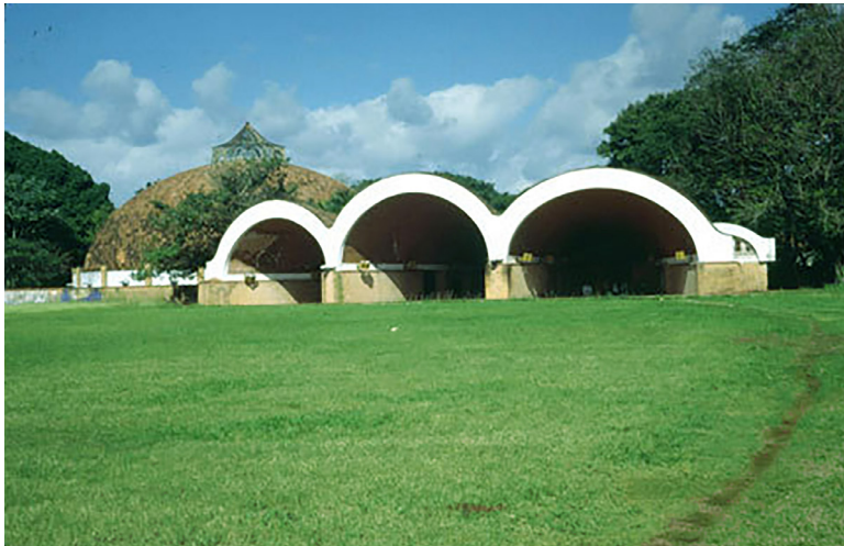
Left: Las Escuelas Nacionales de Arte, Havana, Cuba