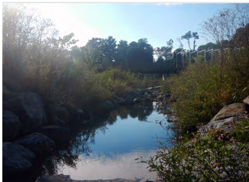
Restored stream, Evans Parkway Park Silver Spring, MD