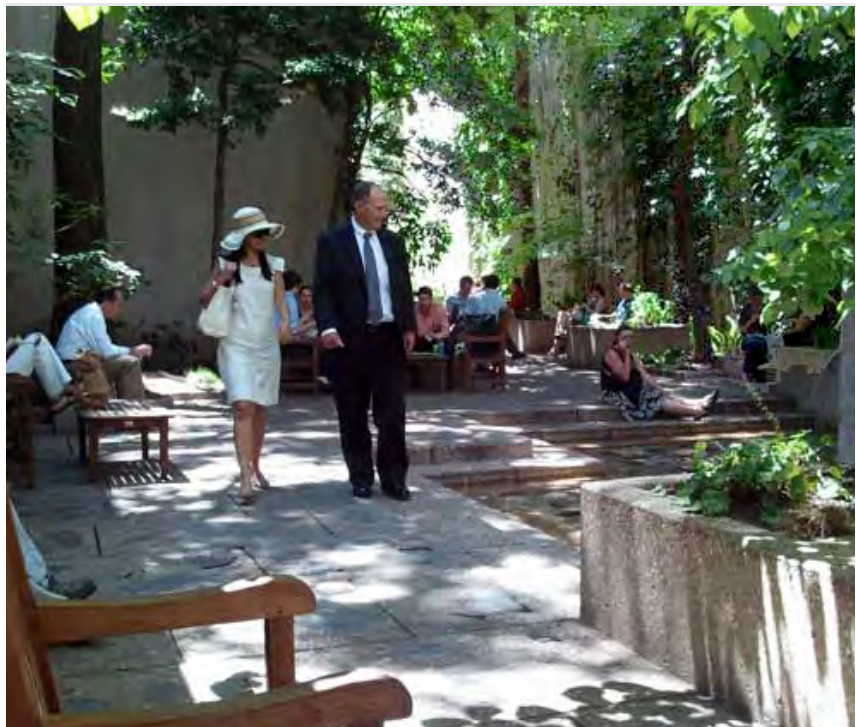
John F. Collins (formerly Chestnut) Park, Philadelphia, PA