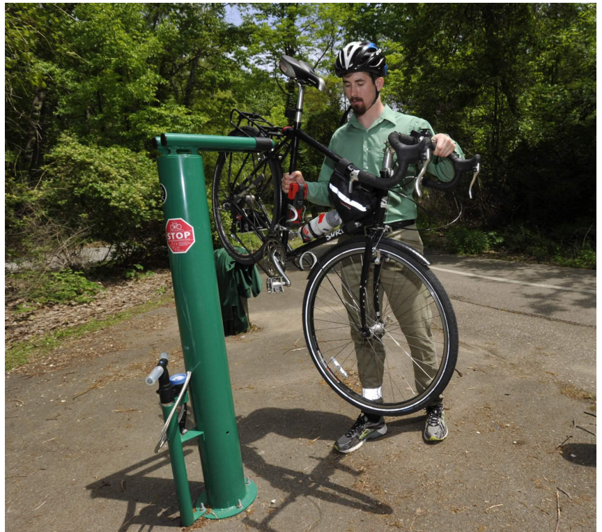
Examples of bicycle repair stations and details