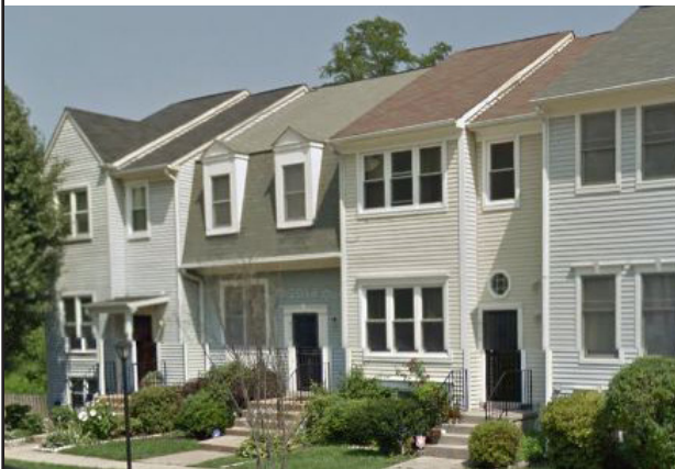
Existing development with a similar density

The intent of the TMD zone is to provide designated areas of the County for residential purposes at slightly higher densities than the R-90, R-60, and R-40 zones. It is also the intent of the TMD zone to provide a buffer or transition between nonresidential or high-density residential uses and the medium- or low-density Residential zones.