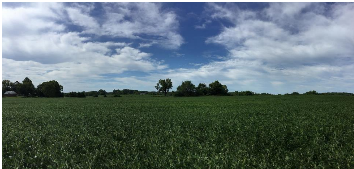
1. Approach to cemetery, facing south