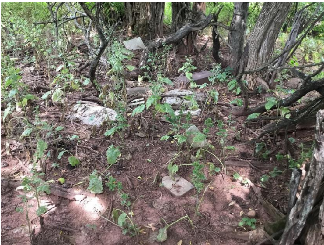
2. Initial view into cemetery, facing west