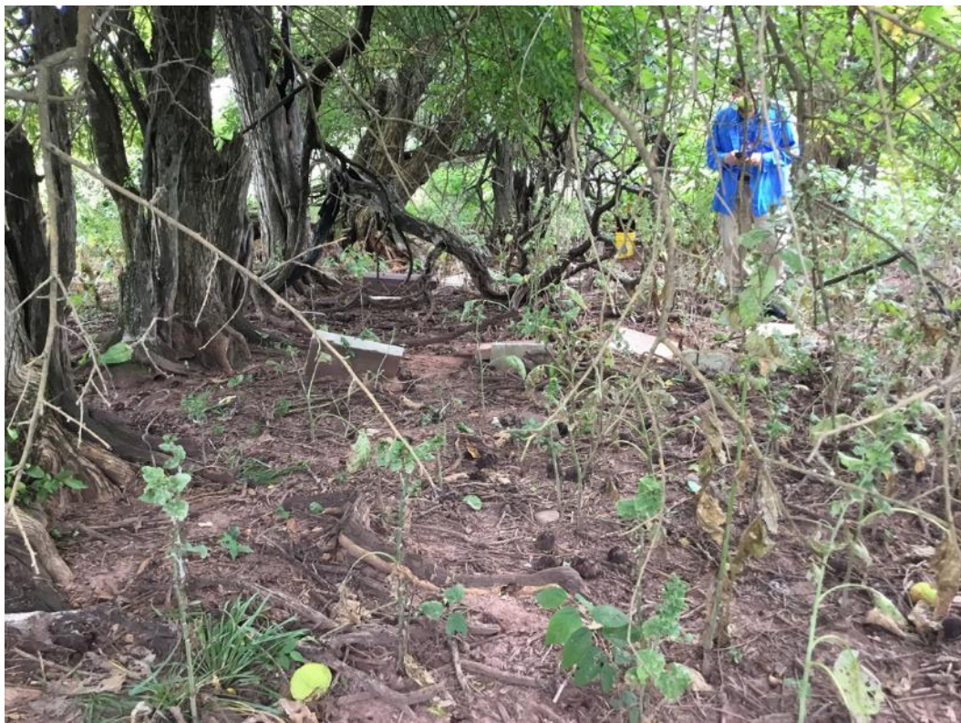
3. View into cemetery, facing east