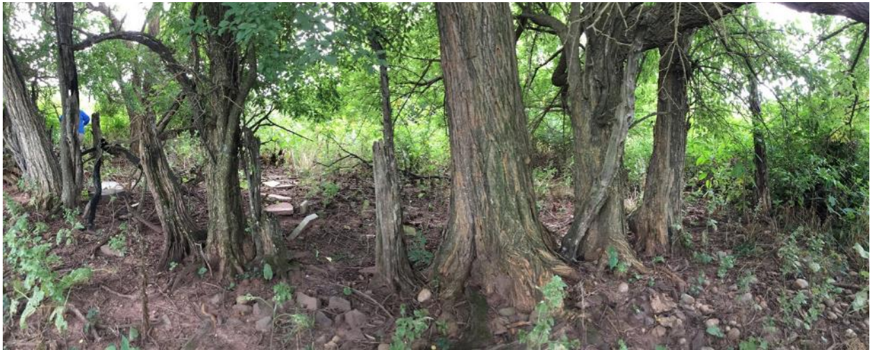
4. Panoramic from east to south to west