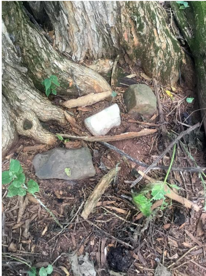
6. Carved field stones in slave cemetery