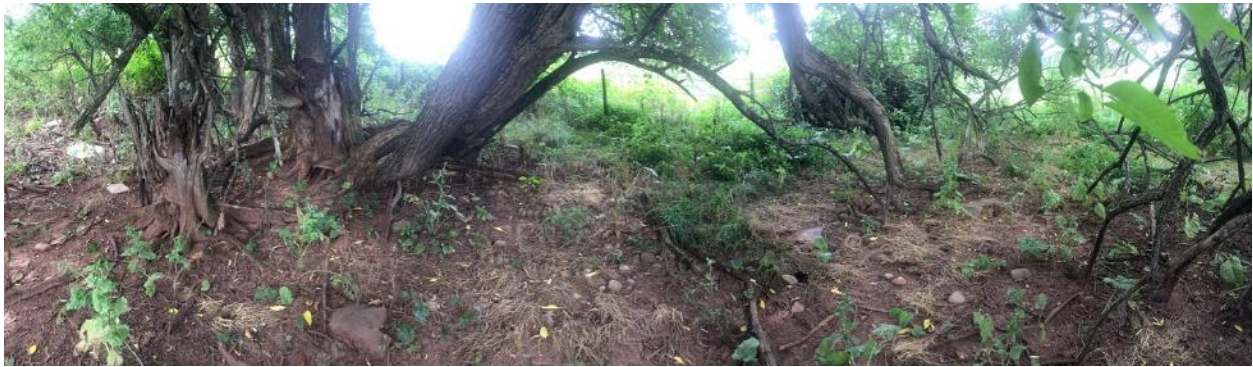
5. Panoramic of presumed slave burial ground, from west to north to east