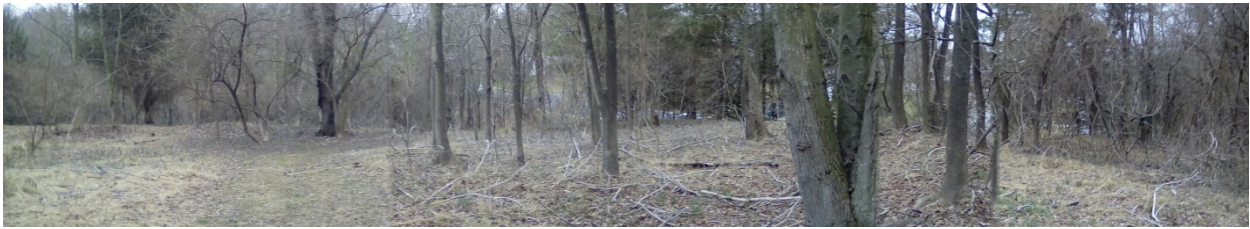
4. Panoramic from west to north to east