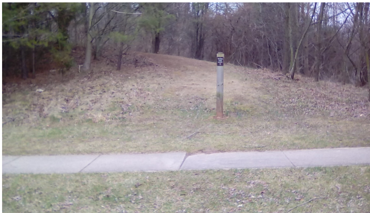
1. Entrance to cemetery along foot path, facing east