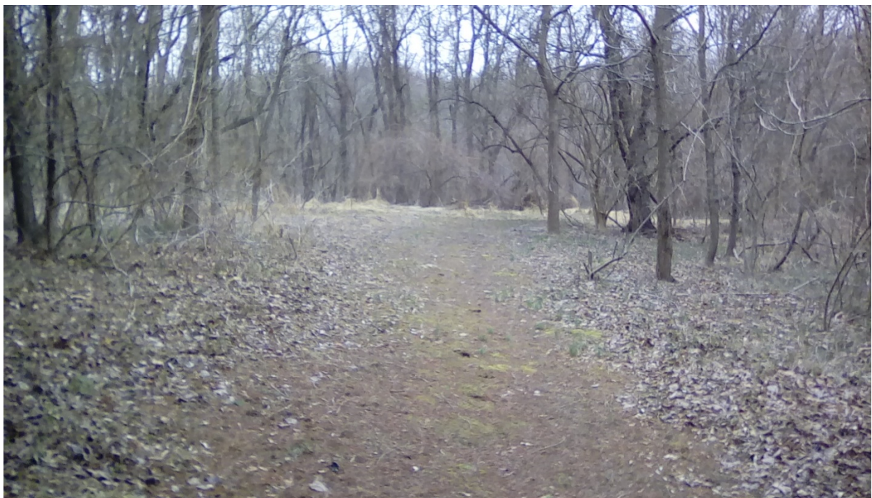
3. Foot path back to Cutsail Dr. from burial area