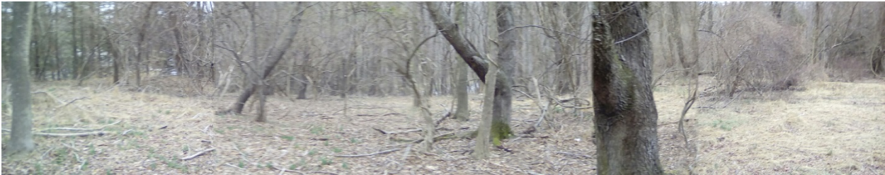
5. Panoramic from east to south to west