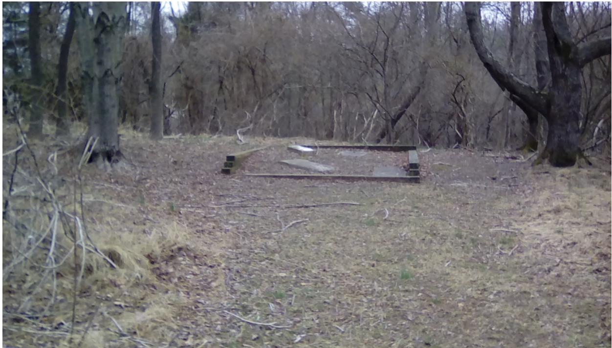
2. View of cemetery from foot path, facing north