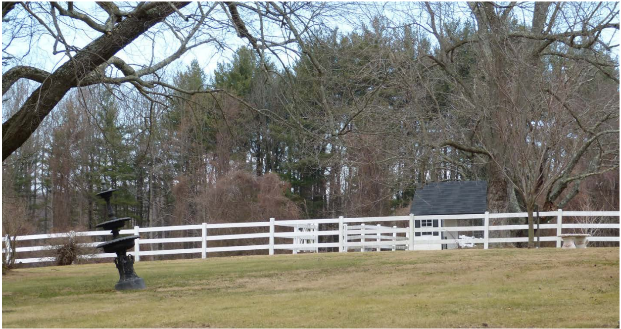
1. Entrance field