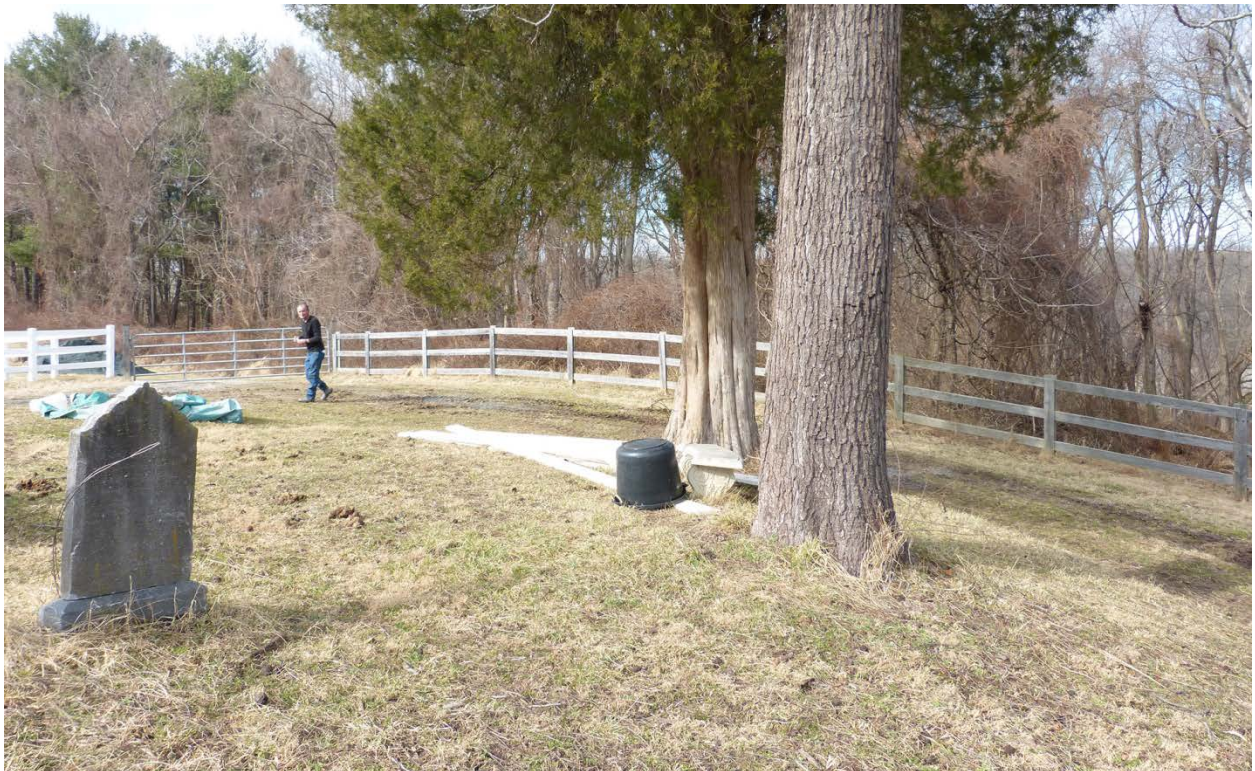
2. Cemetery facing north