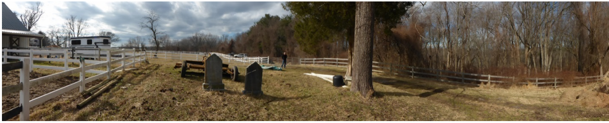
3. Panoramic from west to north to east