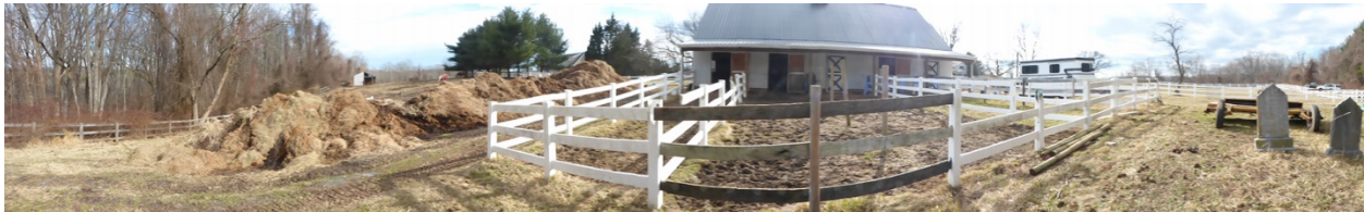
4. Panoramic from east to south to west