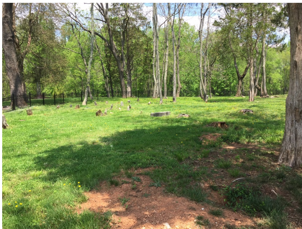
1. Center of cemetery from Sycamore Hollow Ln., facing north-east