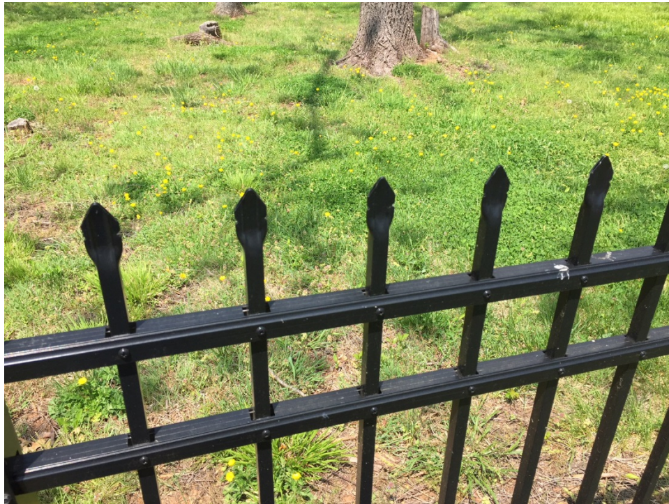
4. Metal fence detail