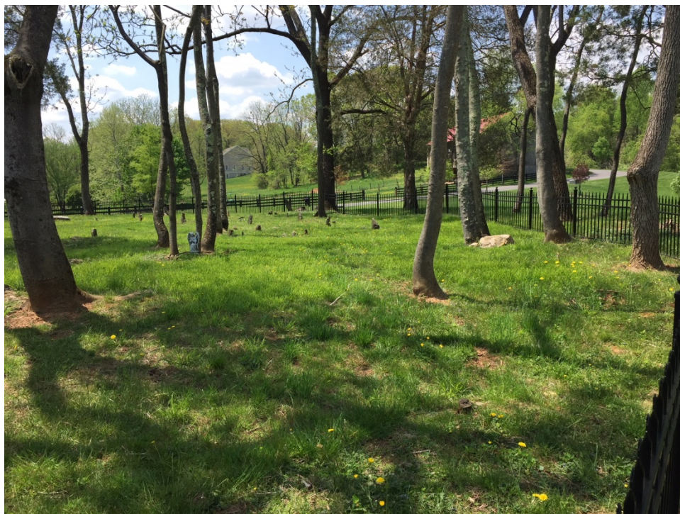
3. Center of cemetery from back fence, facing south