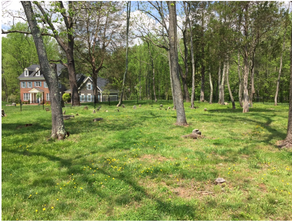
2. Center of cemetery from Sycamore Hollow Ln., facing north-west