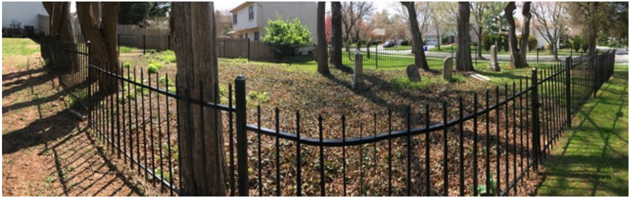
3. Panoramic from east to south to west