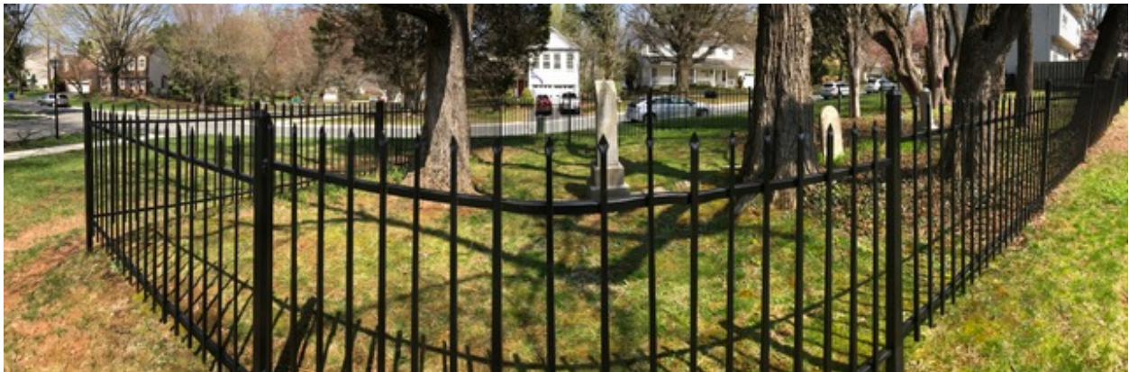
4. Panoramic from west to north to east