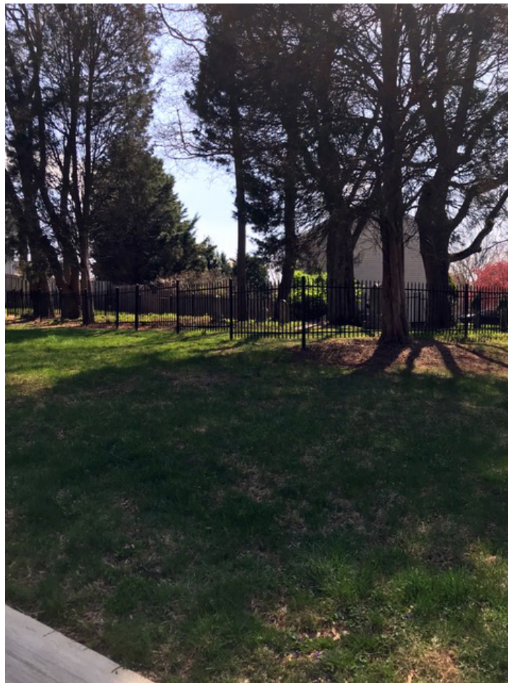
1. View from Botany Way toward cemetery, facing south-west