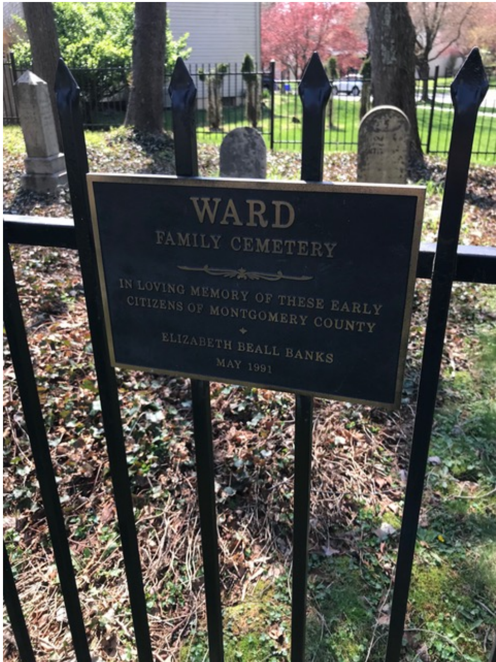
2. Plaque mounted to locked gate