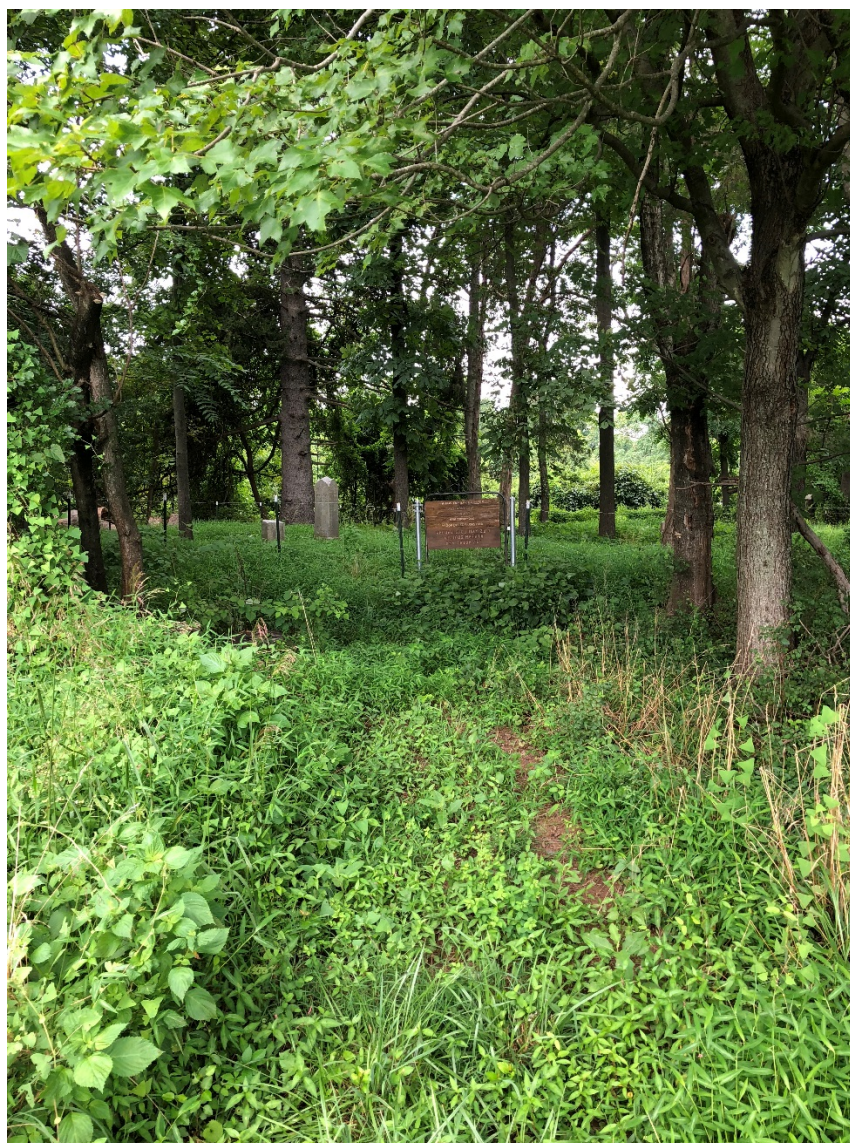
1. Approach to cemetery, facing north