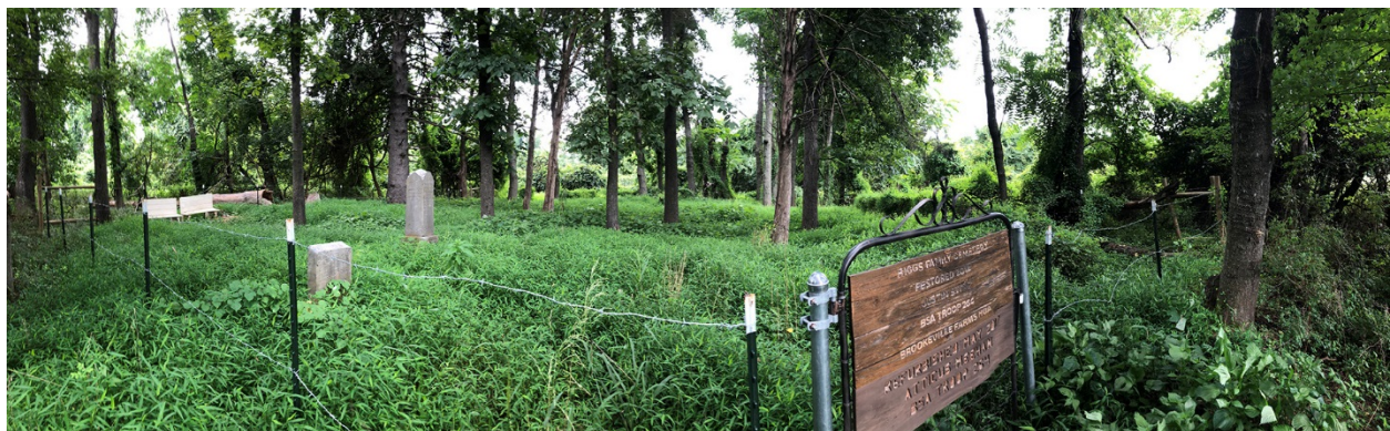
3. Panoramic from west to north to east