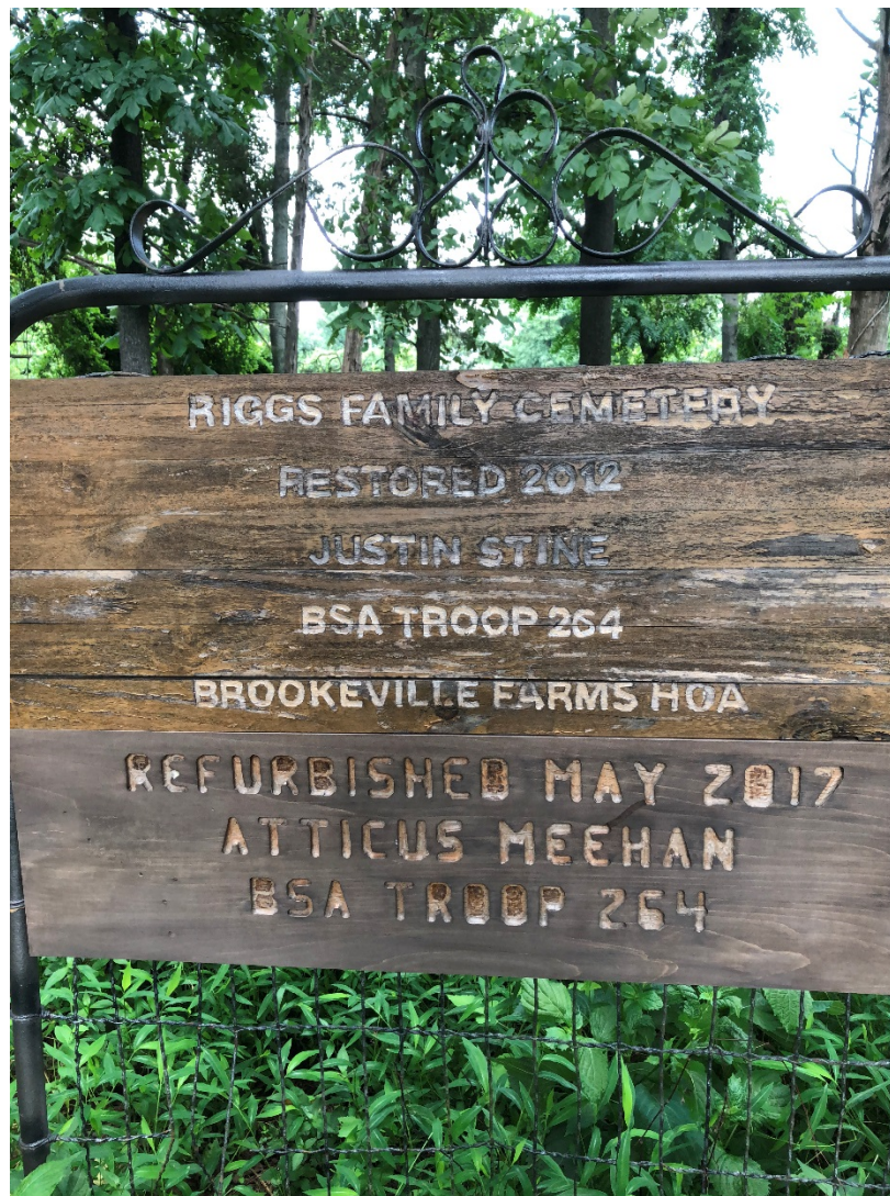
2. Cemetery sign at gate, facing north