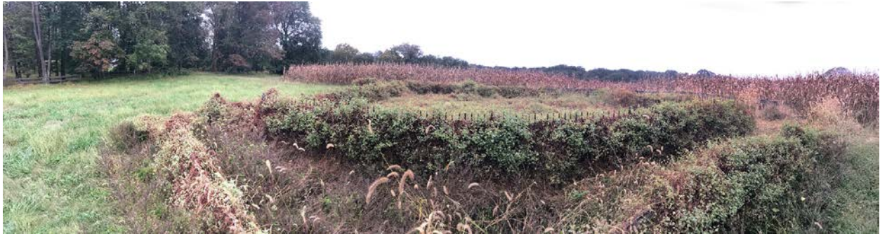
8. Panoramic from south to west to north