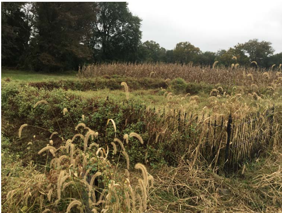
5. Cemetery from northeast corner, facing southwest