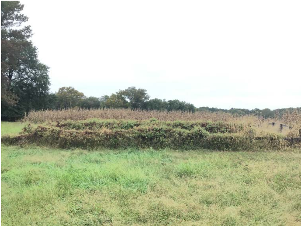
4. Approach to cemetery, facing west