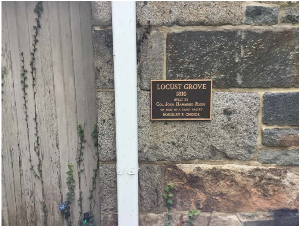
2. Historic bronze plaque on front of house