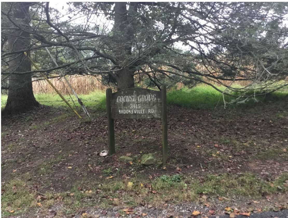
1. Sign at entrance of property