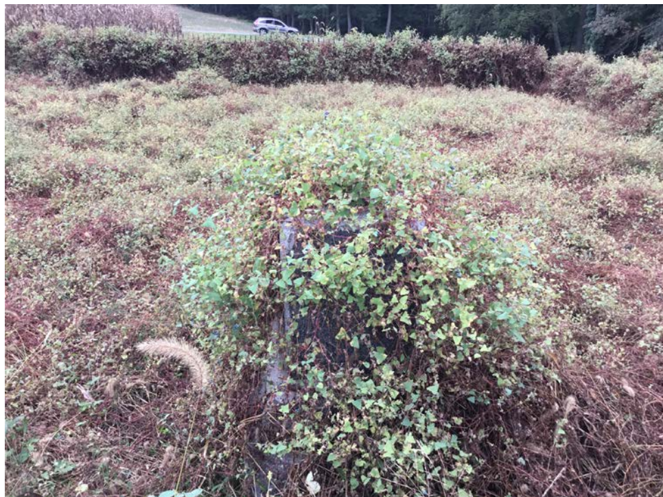
7. Monument, facing east