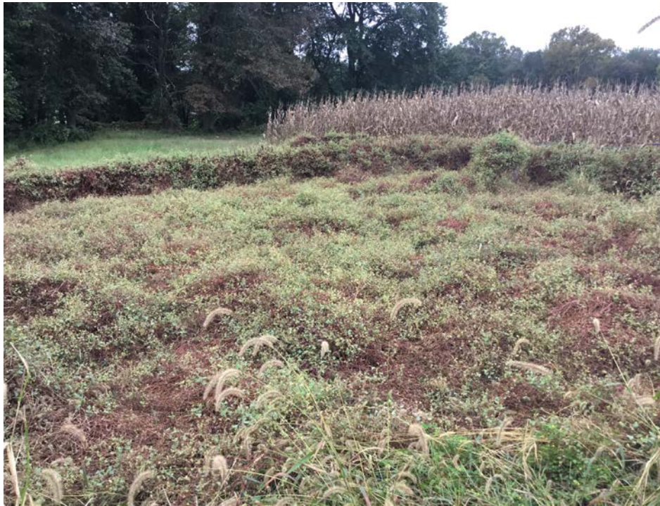
6. Center of cemetery, facing southwest