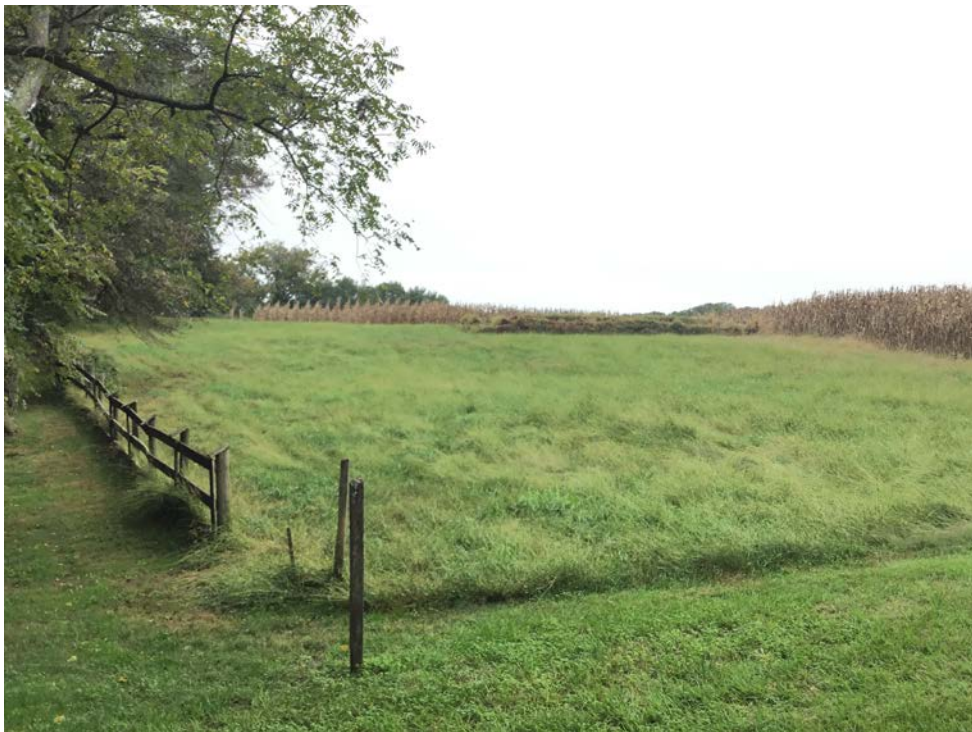
3. Initial view of cemetery behind house, facing west