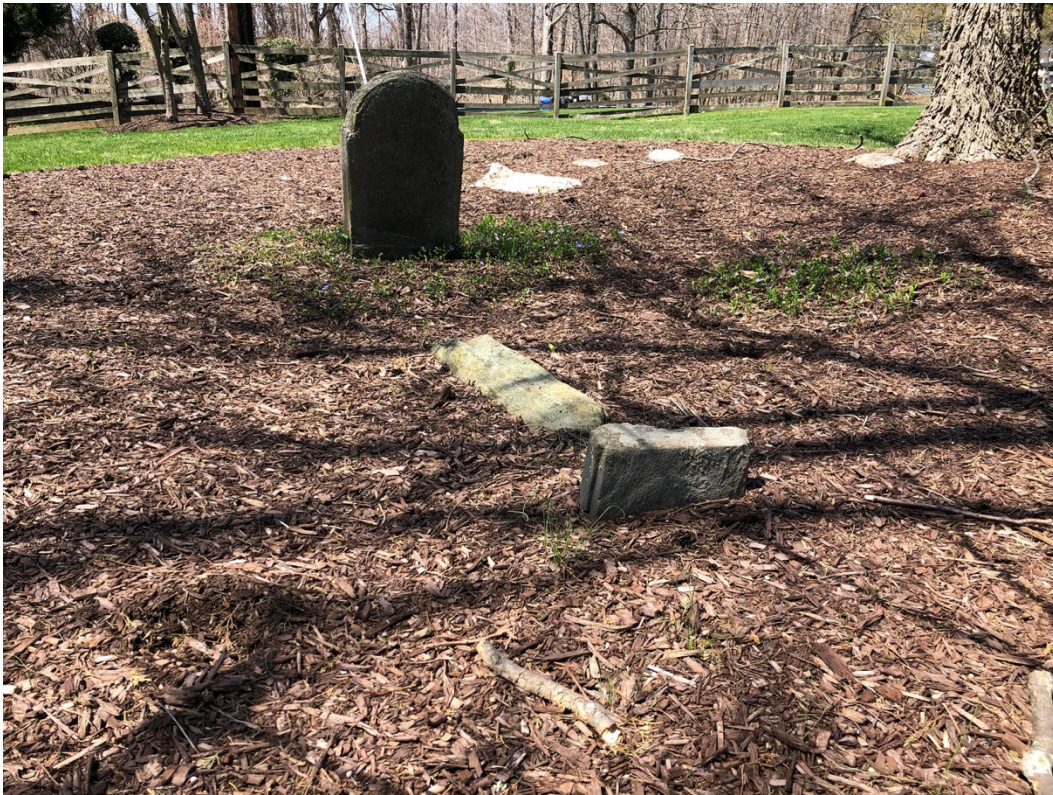
11. J.N.Q. marker, elongated stone, and footstone, facing north