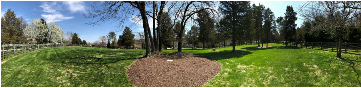
7. Panoramic from north to east to south