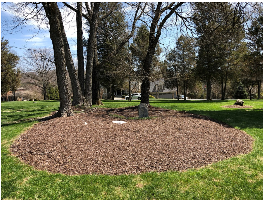
4. View toward burial site, facing east