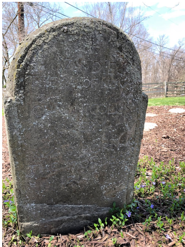
12. J.N.Q. marker