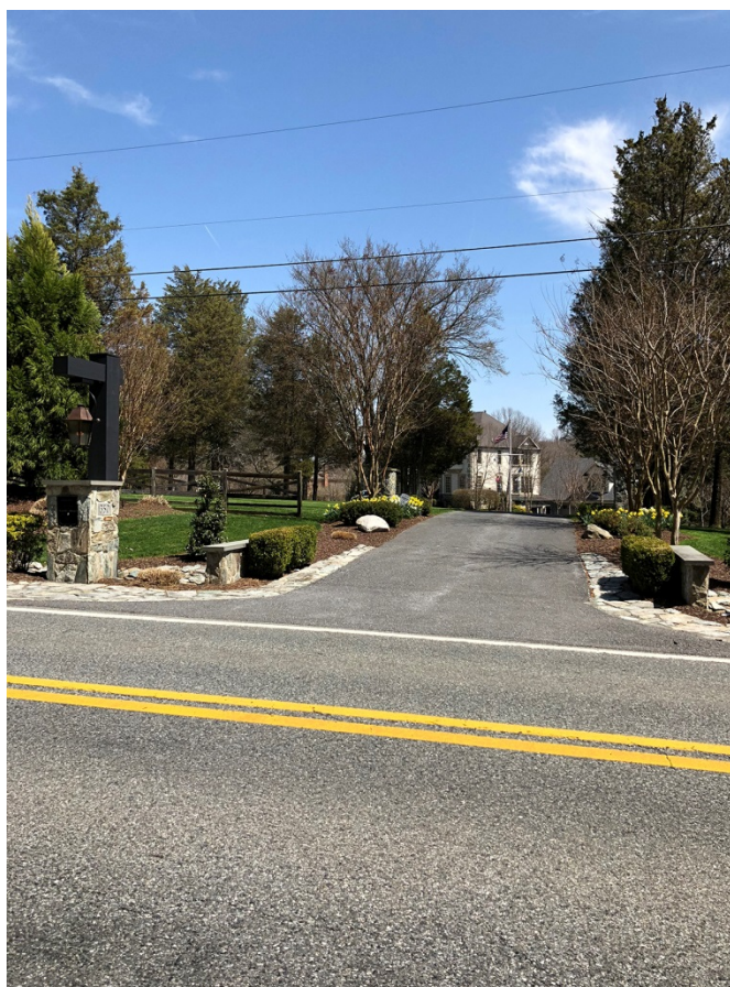
2. Private home's driveway from Esworthy Road