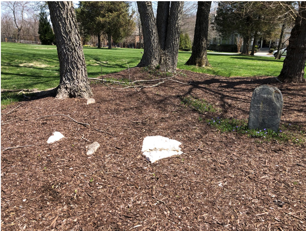
8. Back of J.N.Q marker and unmarked marble stones