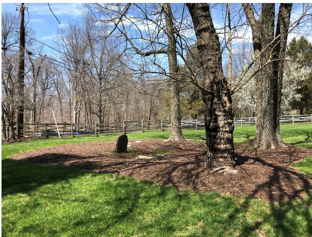
6. View toward burial site, facing north