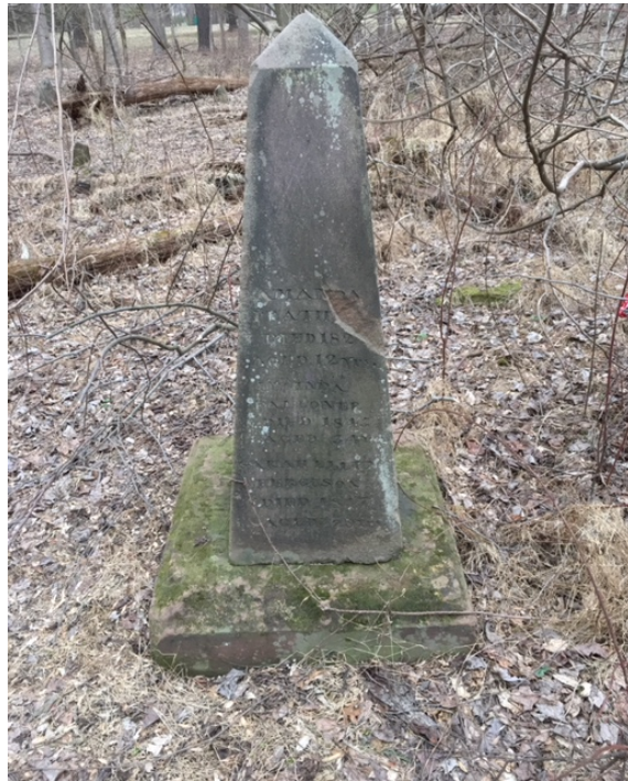
3. Obelisk monument