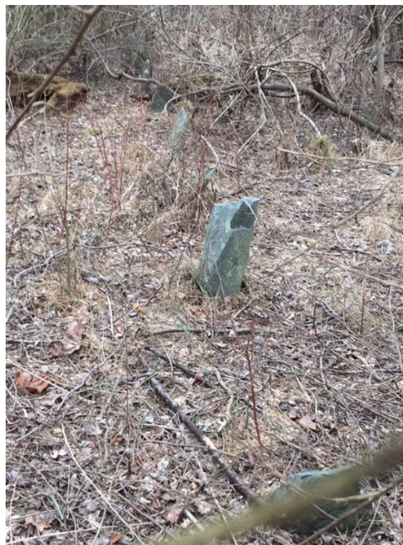
2. Possible stone perimeter fence line