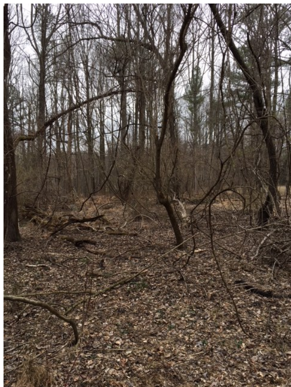
1. Entry from service road used by WSSC