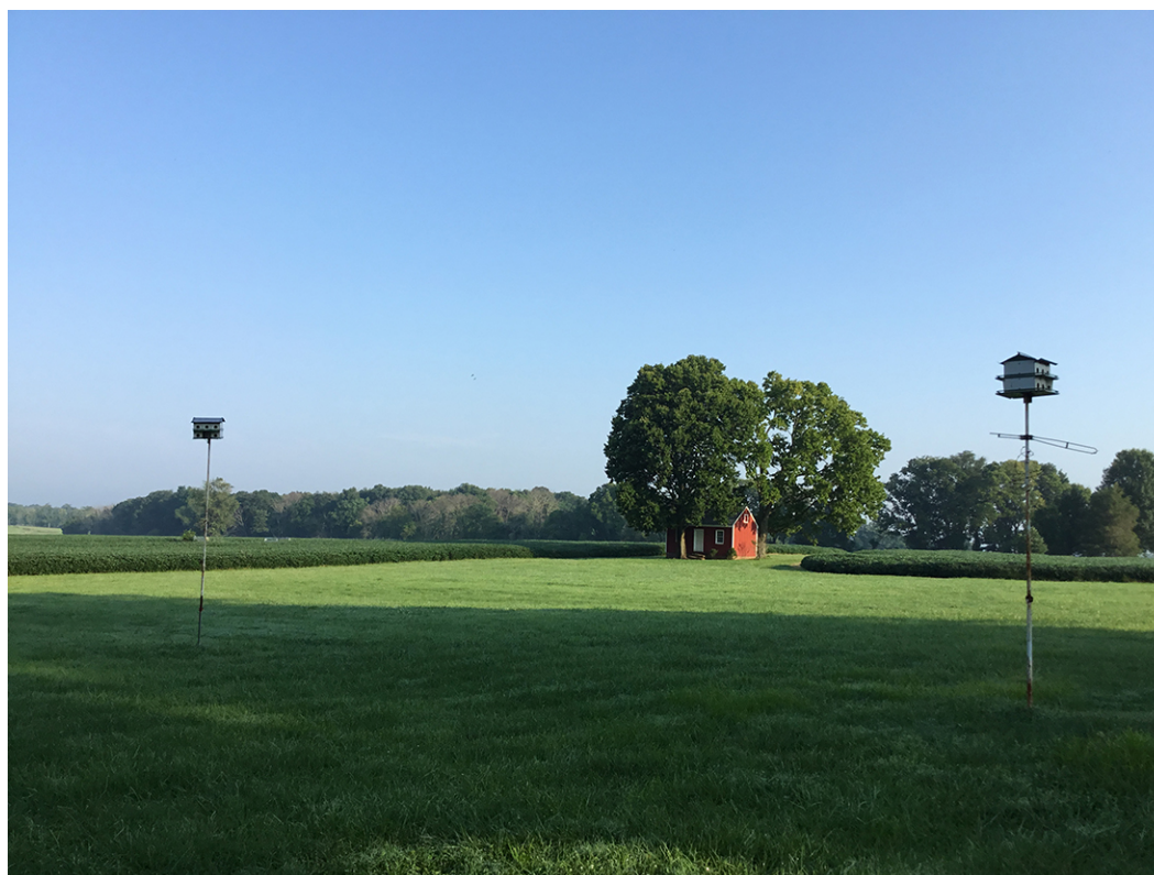
1. Approach to cemetery from residence, facing northwest.