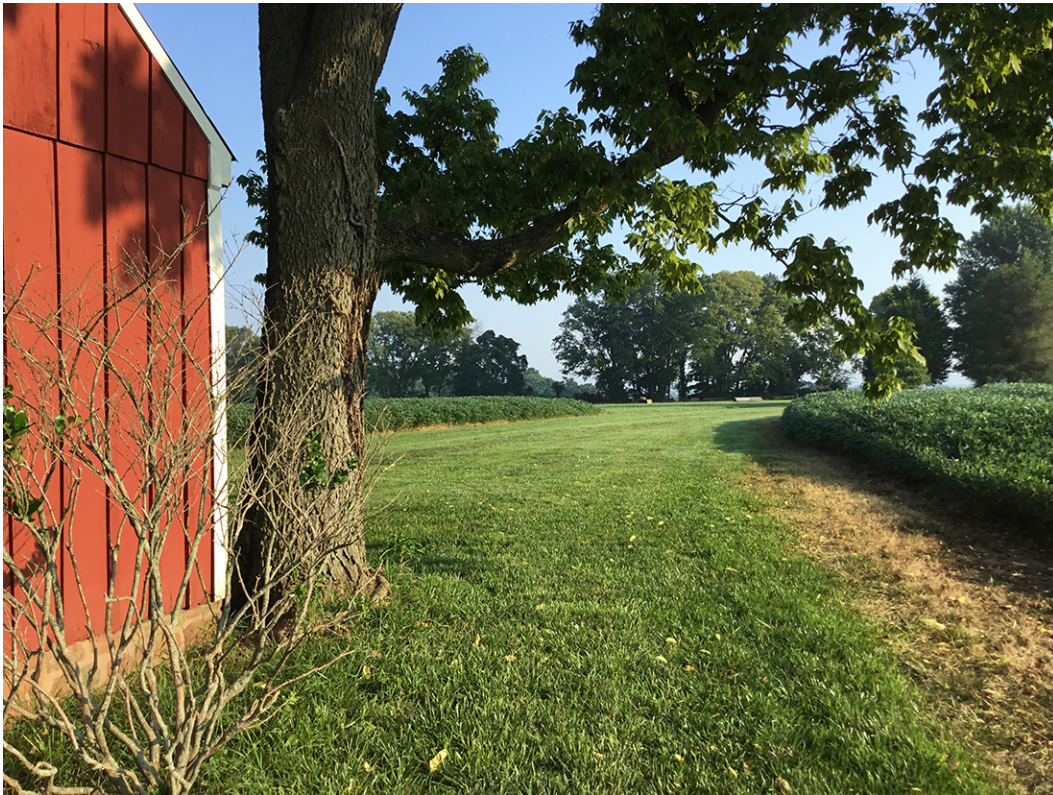
2. Continued approach to cemetery at shed, facing north.