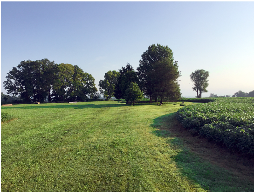
3. Direct approach to cemetery from shed, facing north.