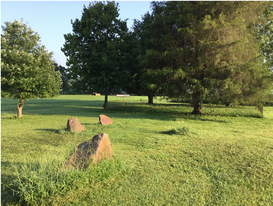
4. Kiplinger family boulders, facing north.