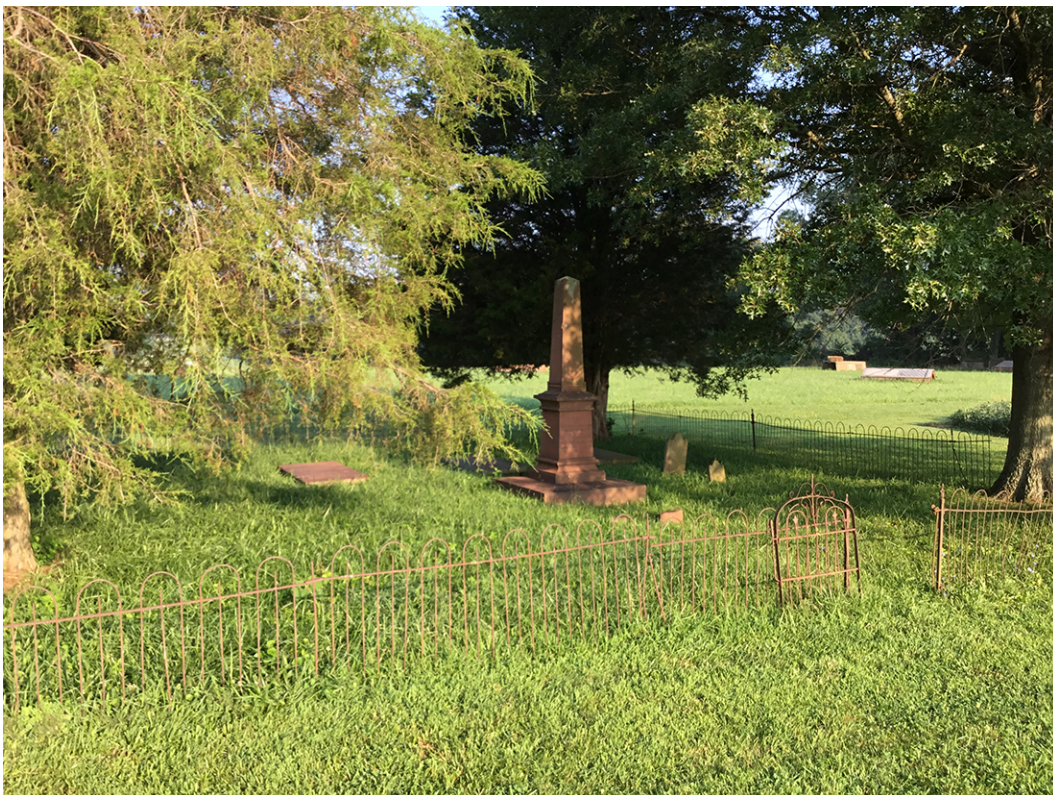
5. Peter family burial enclosure, facing northwest.