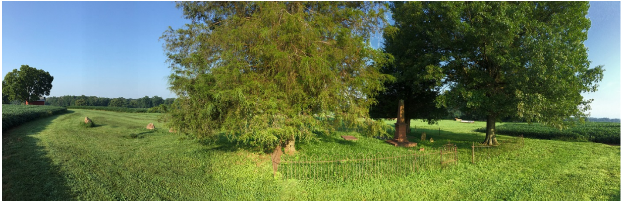
6. Panoramic from south to west to north.