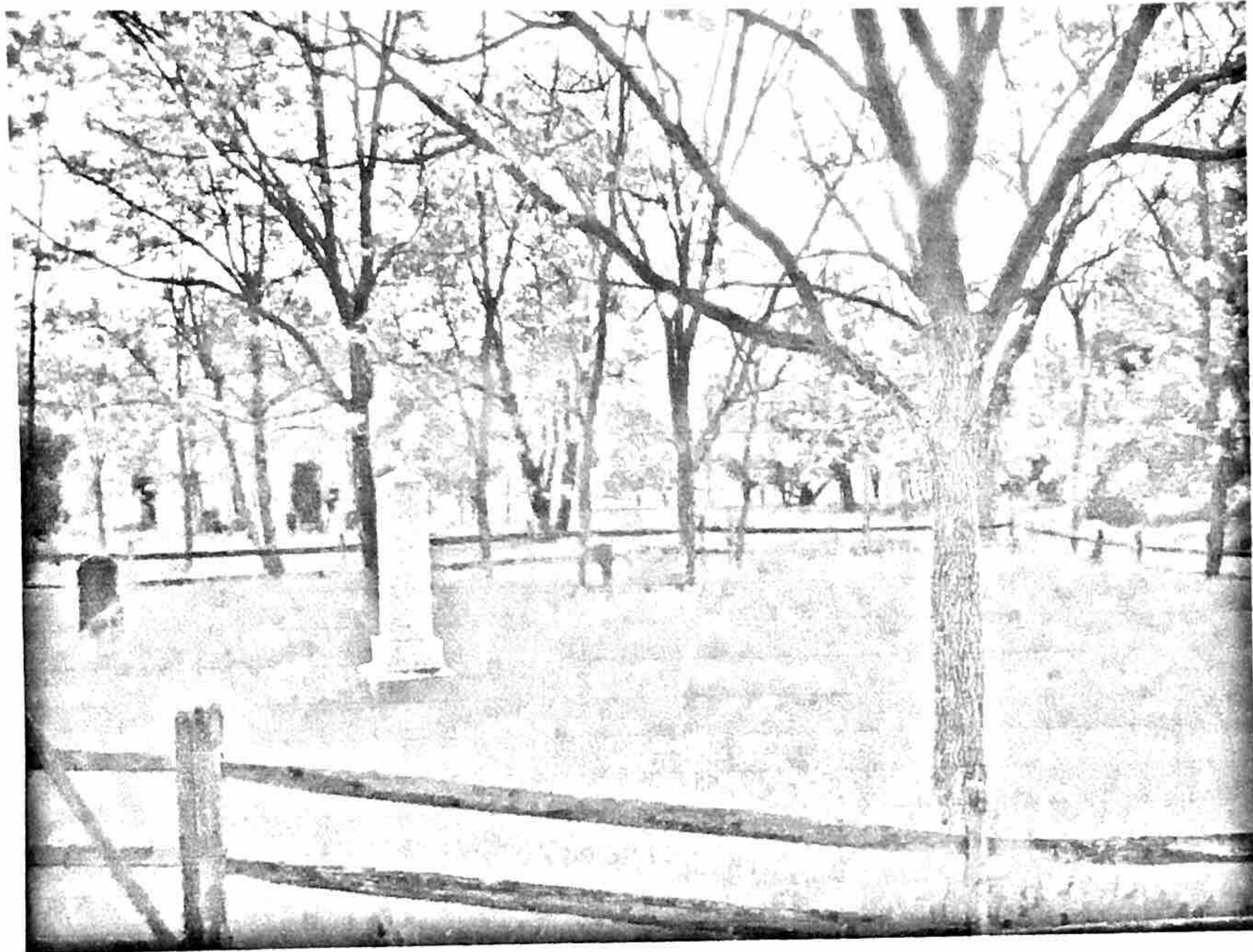
100-20 From front fence off Barley Field Lane looking northwest to west corner in rear of picture.