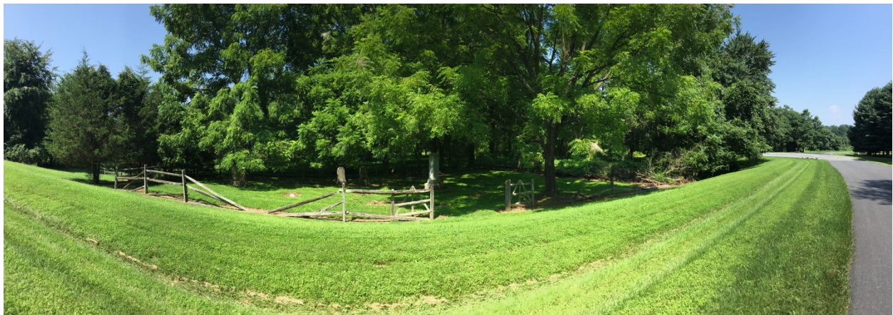
2. Entrance to cemetery across embankment, facing west