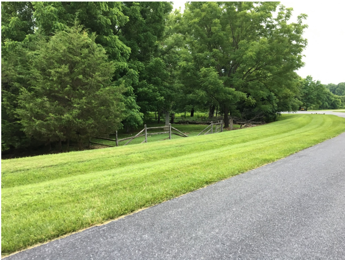
1. Approach to cemetery from Barley Field Lane, facing north