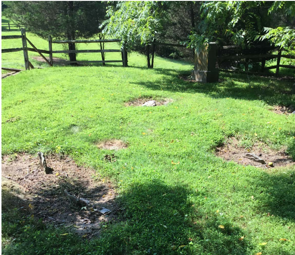
5. Fieldstone grave markers discovered and exposed