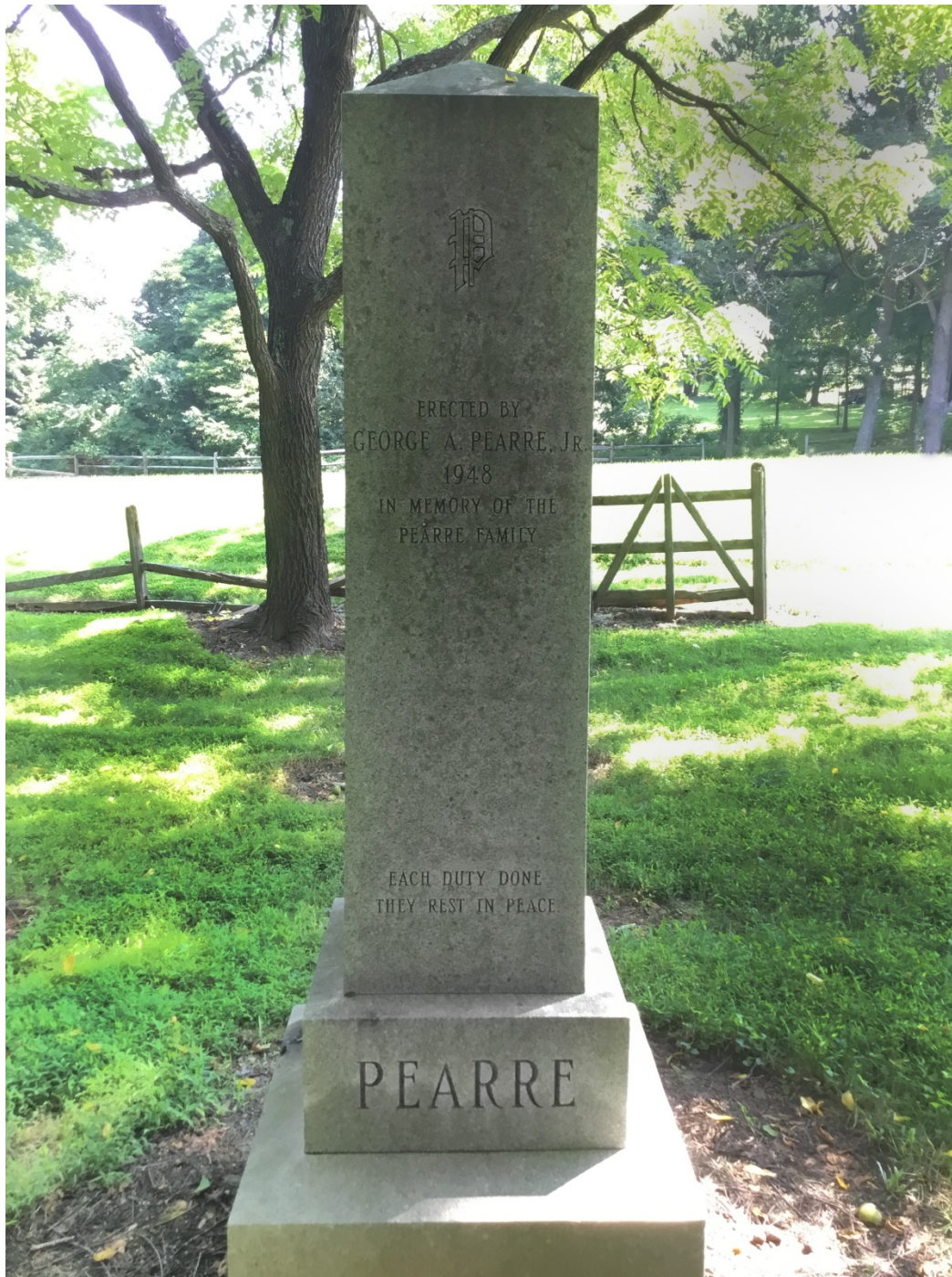
7. Pearre monument in center of cemetery