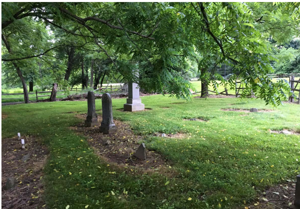
6. Family grave markers and fieldstones