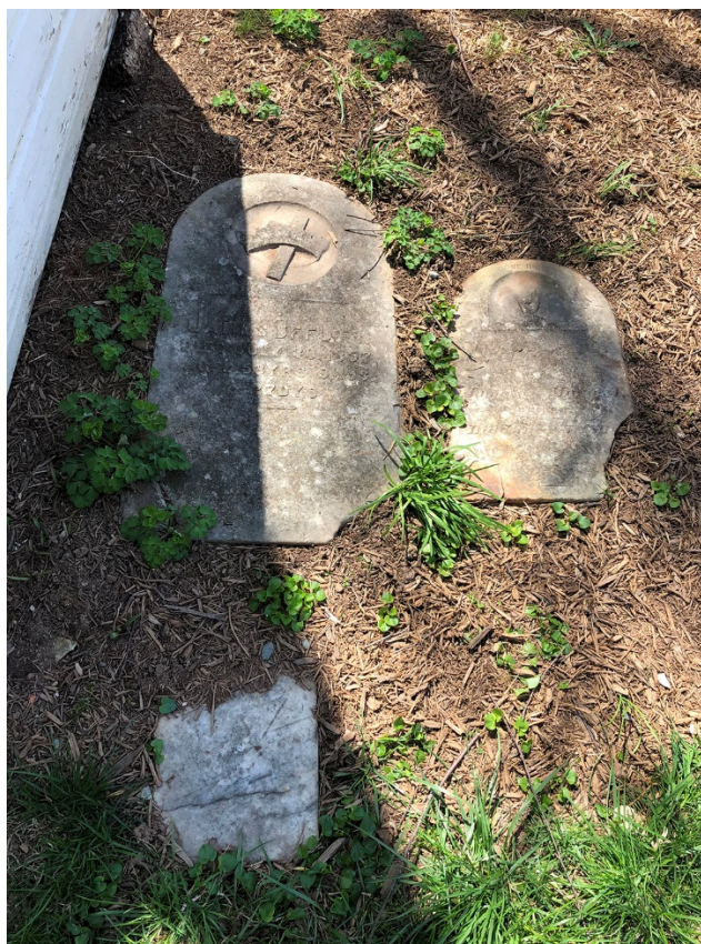
25_10. Detail of gravestones