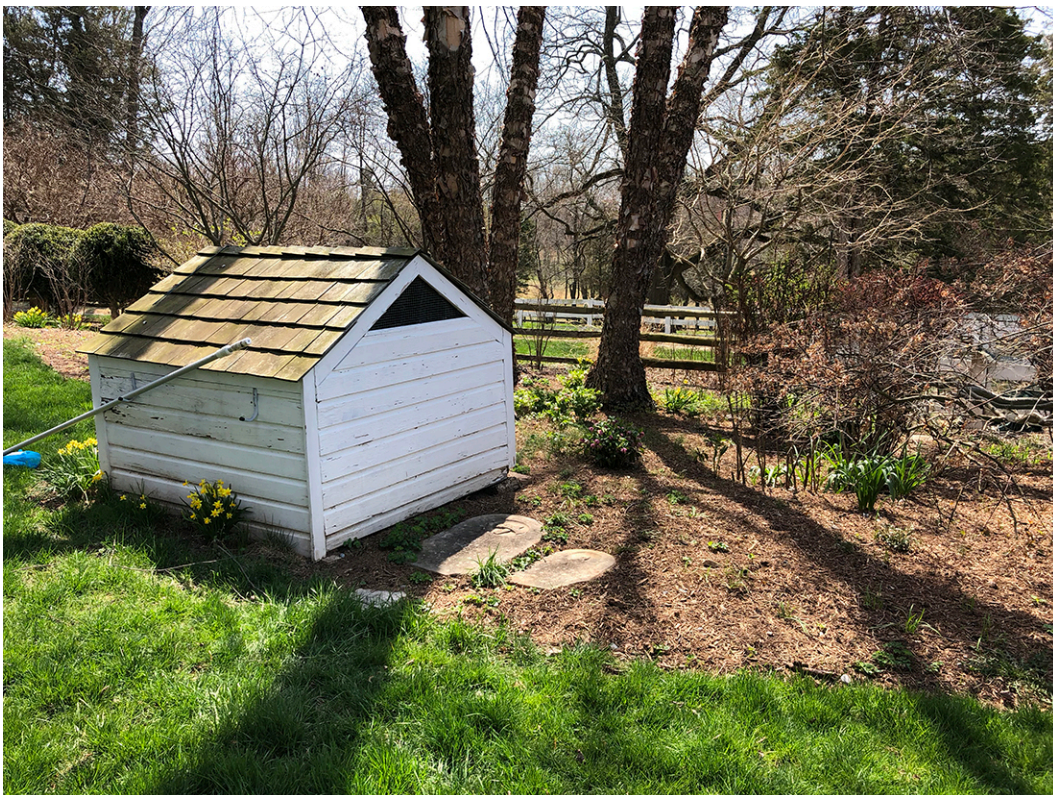
25_9. Location of relocated gravestones in a mulched area