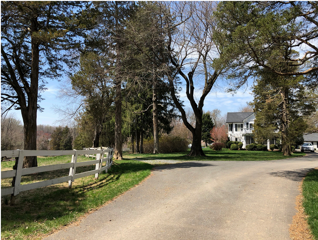
25_5. Driveway to the left leads to gravestones, facing west