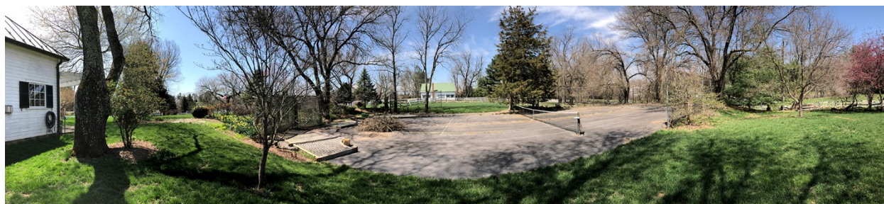
25_15. Panoramic from south to west to north