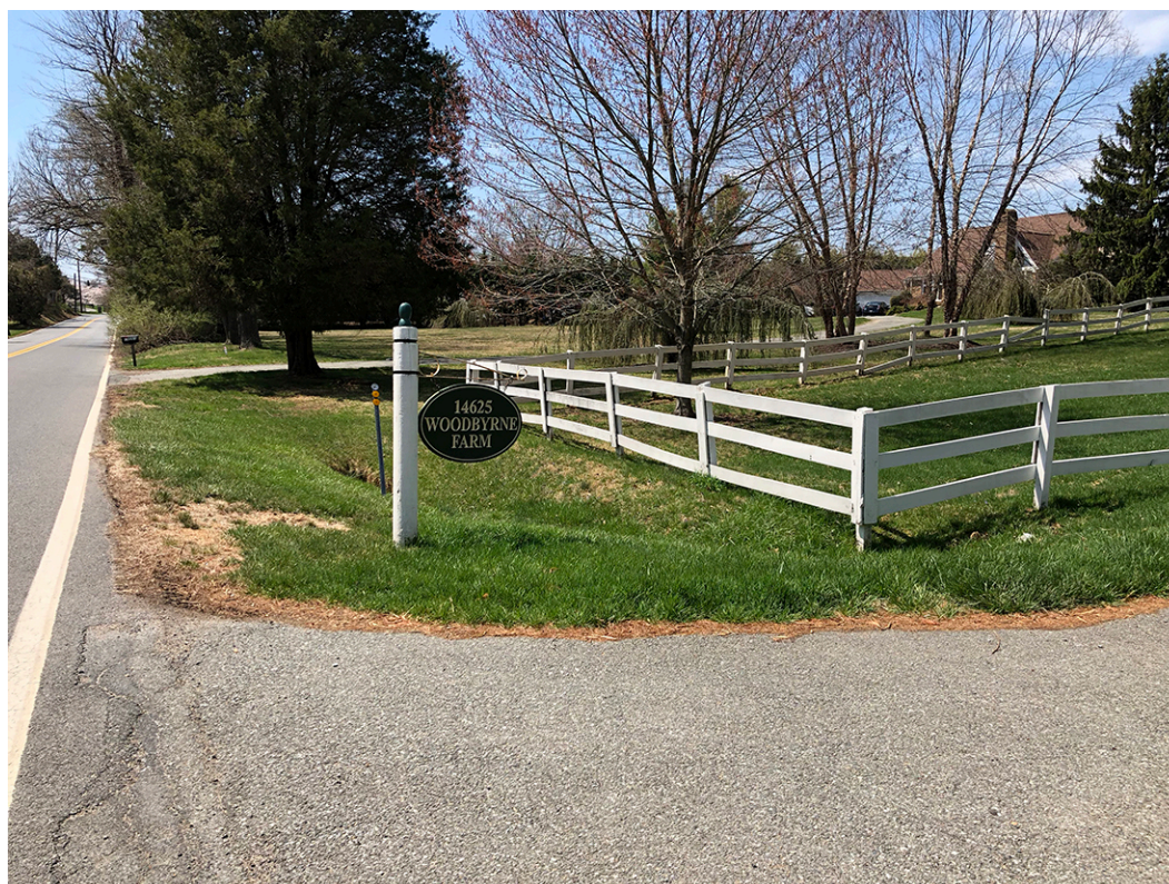
25_2. Driveway from Seneca Road, facing west