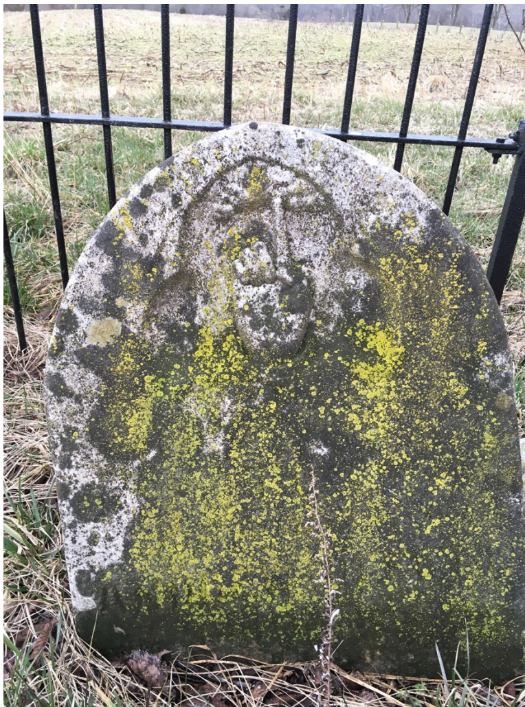
5. Detail of headstone needing cleaning