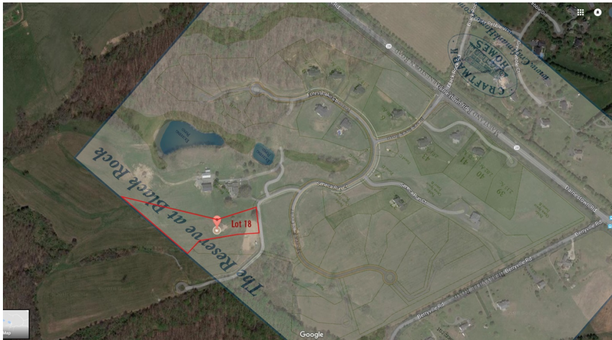
6. Development plan showing residential Lot 18 with cemetery