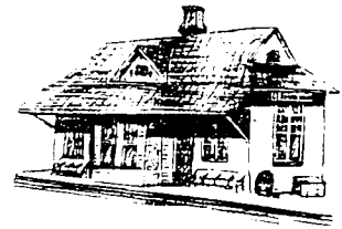
Germantown Train Station