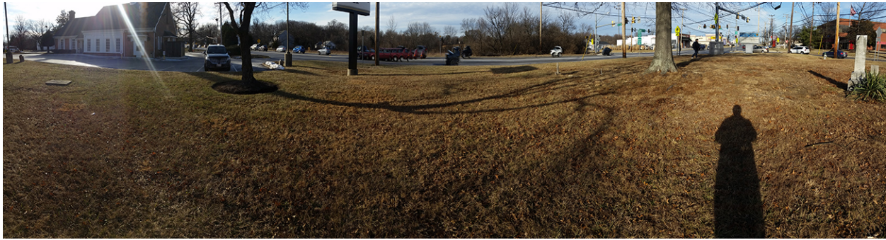
3. West-North-East panorama