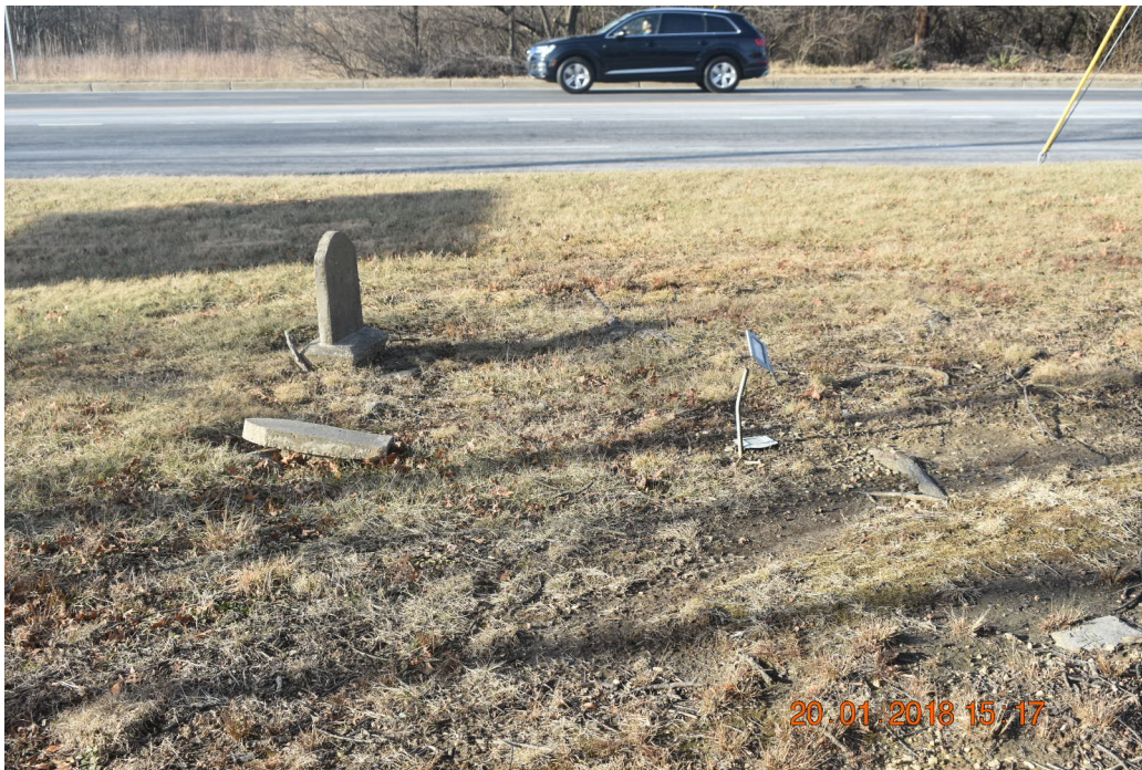
5. Photo from center of cemetery to road facing north