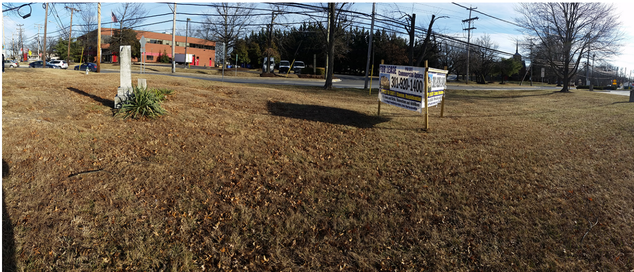
4. East-South-West panorama