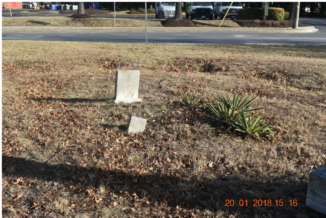
2. Toward center photo, showing depressions