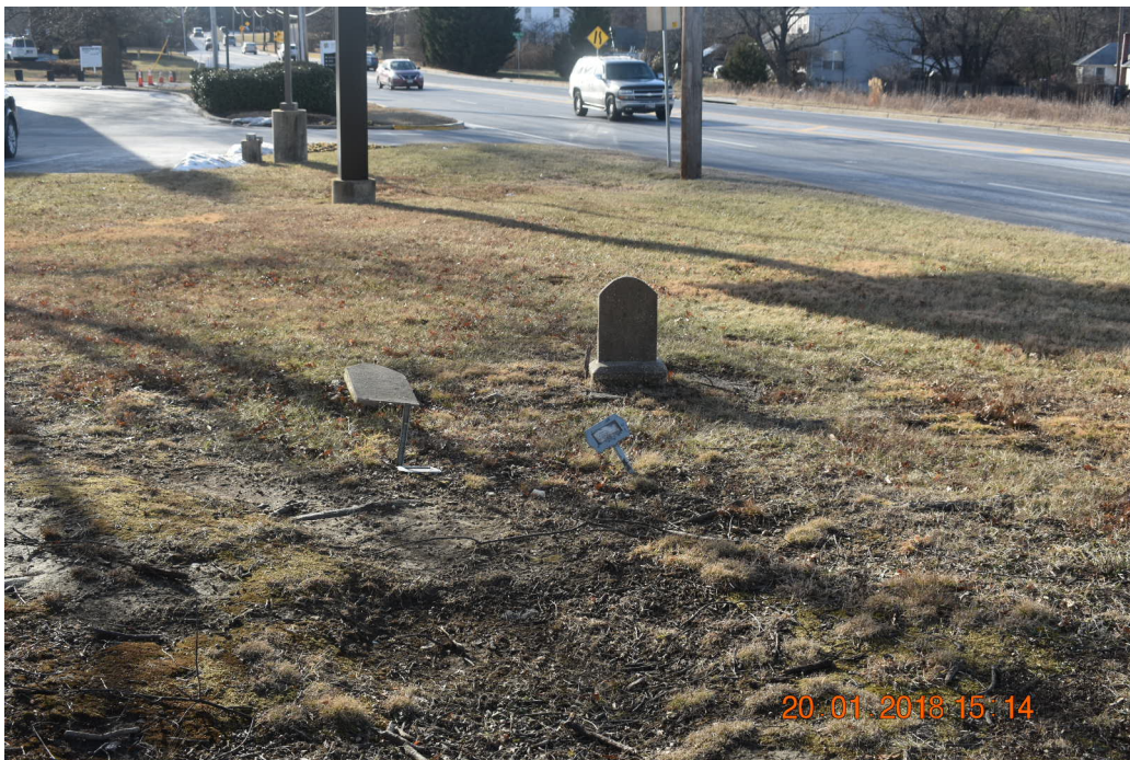
6. Photo from center facing north-west