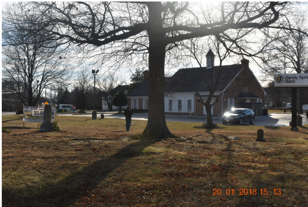
1. Roadside approach to cemetery facing west