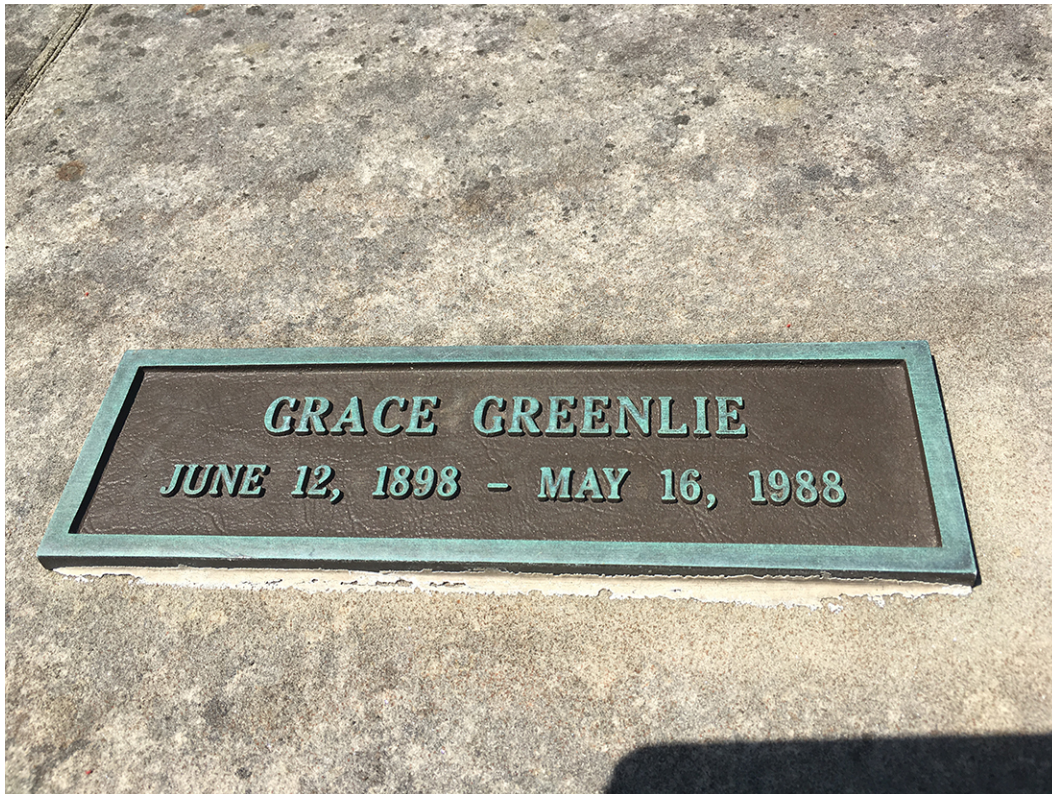
5. Example of name plaque mounted to wall cap