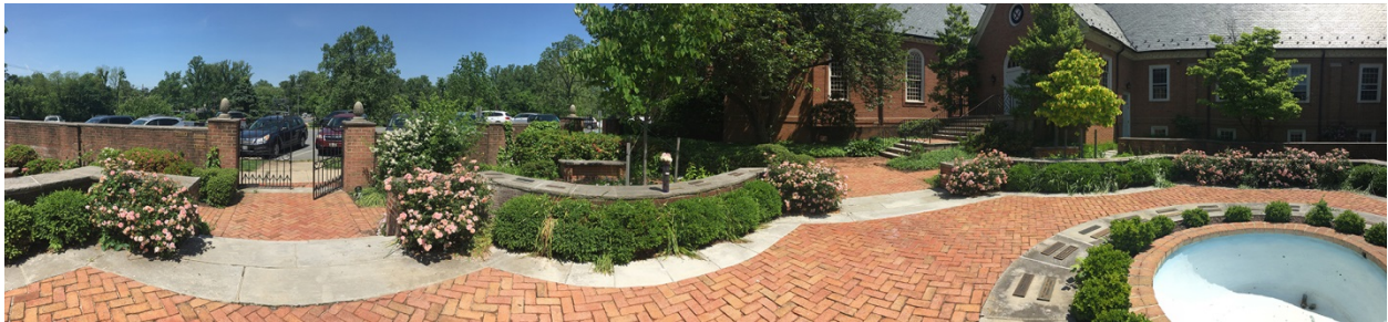
3. Panoramic from west to north to east