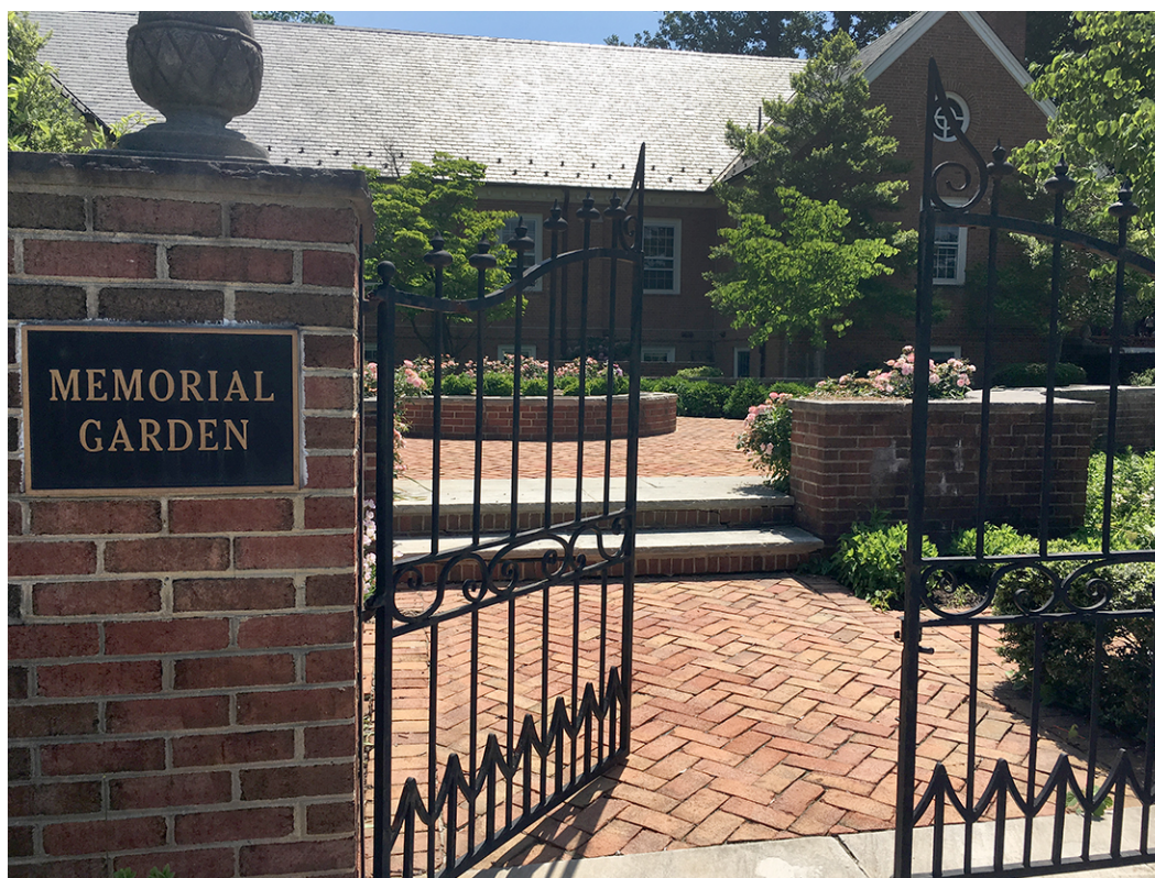
1. Entrance gate to the memorial garden, facing east