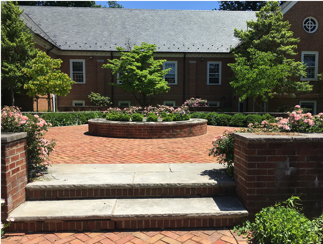
2. Memorial garden