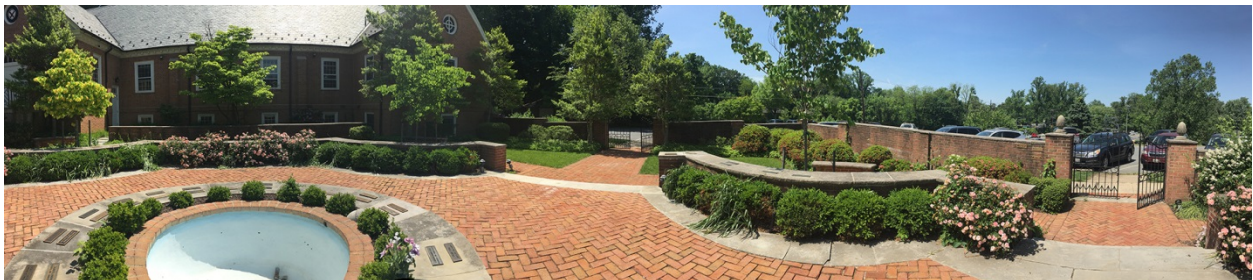
4. Panoramic from east to south to west