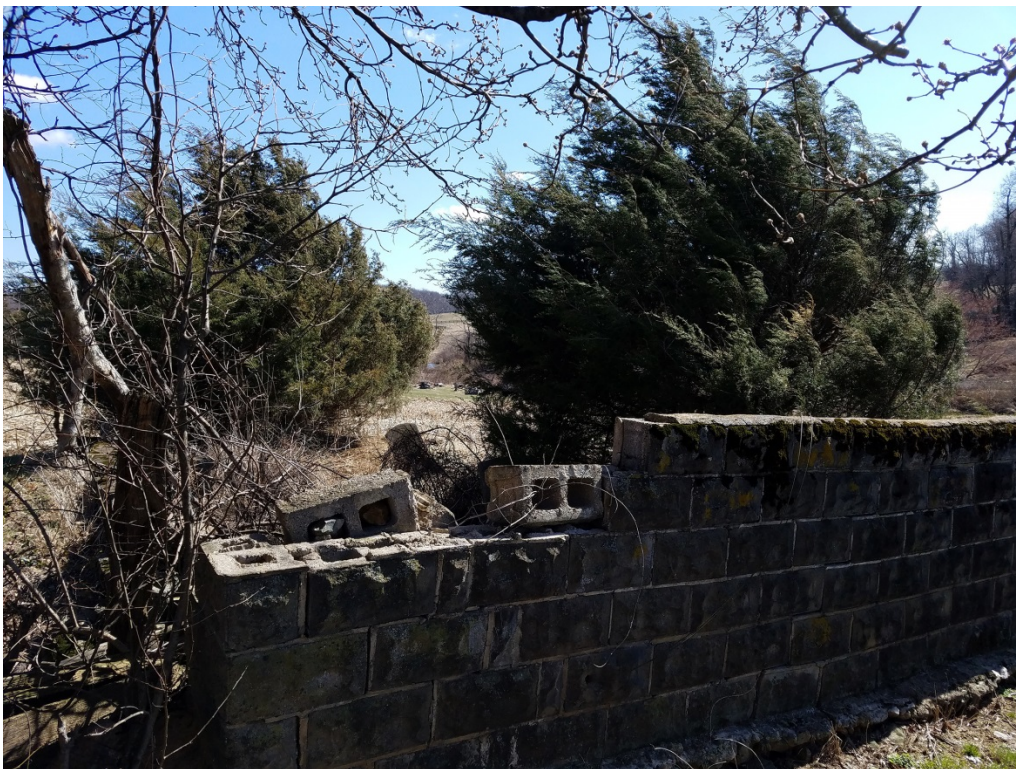
3. Detail of collapsing cinderblock wall