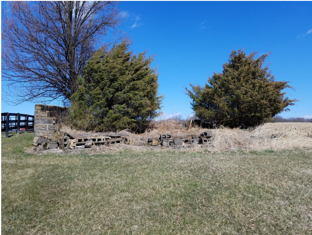
2. View toward cemetery, facing north