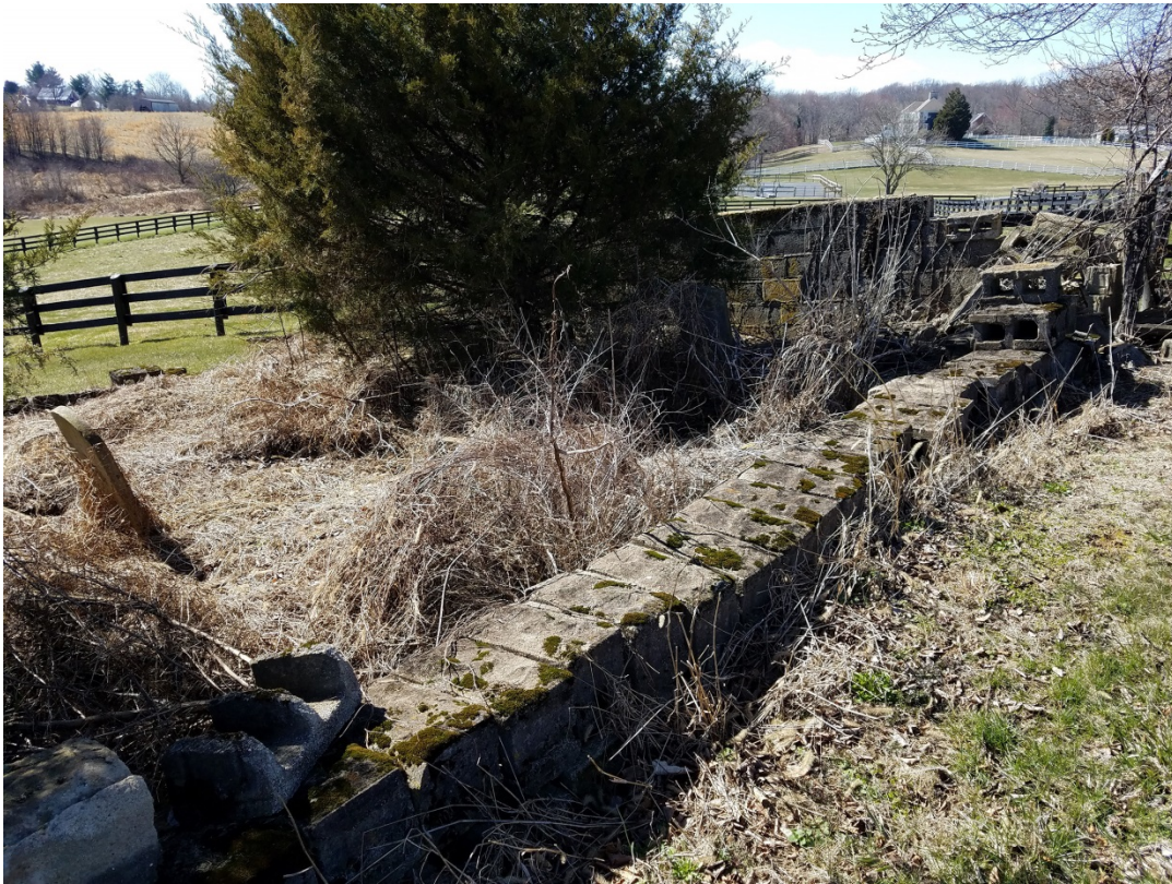
4. Cemetery perimeter wall, facing west