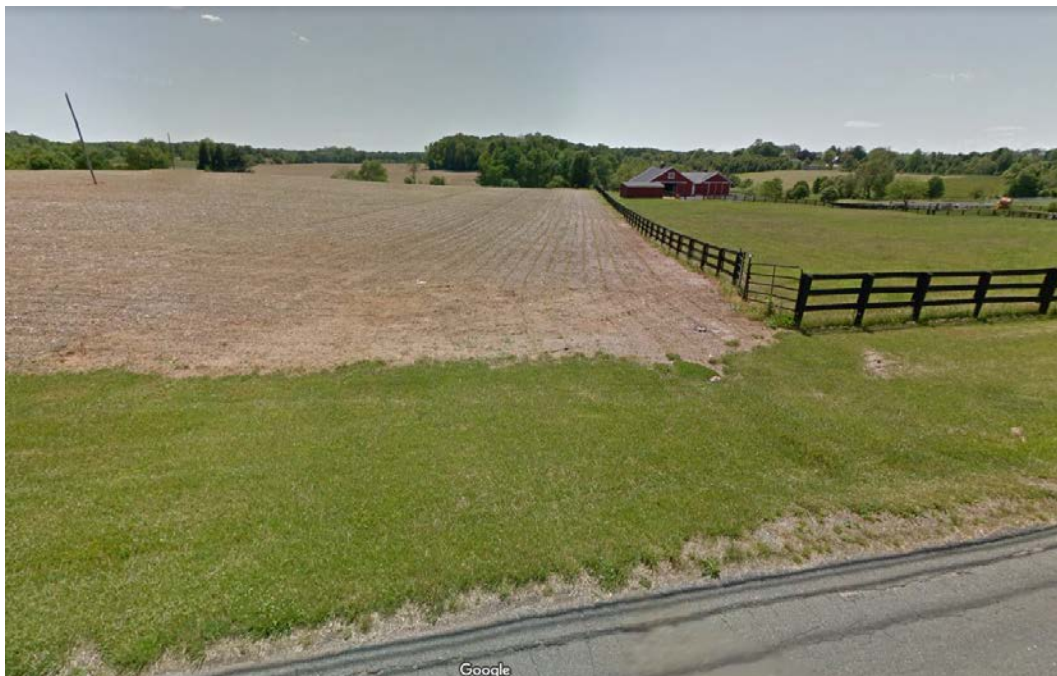
7. Access to cemetery along western property fence line