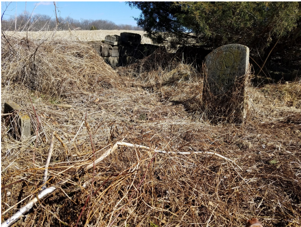
5. Interior of cemetery enclosure, facing northeast