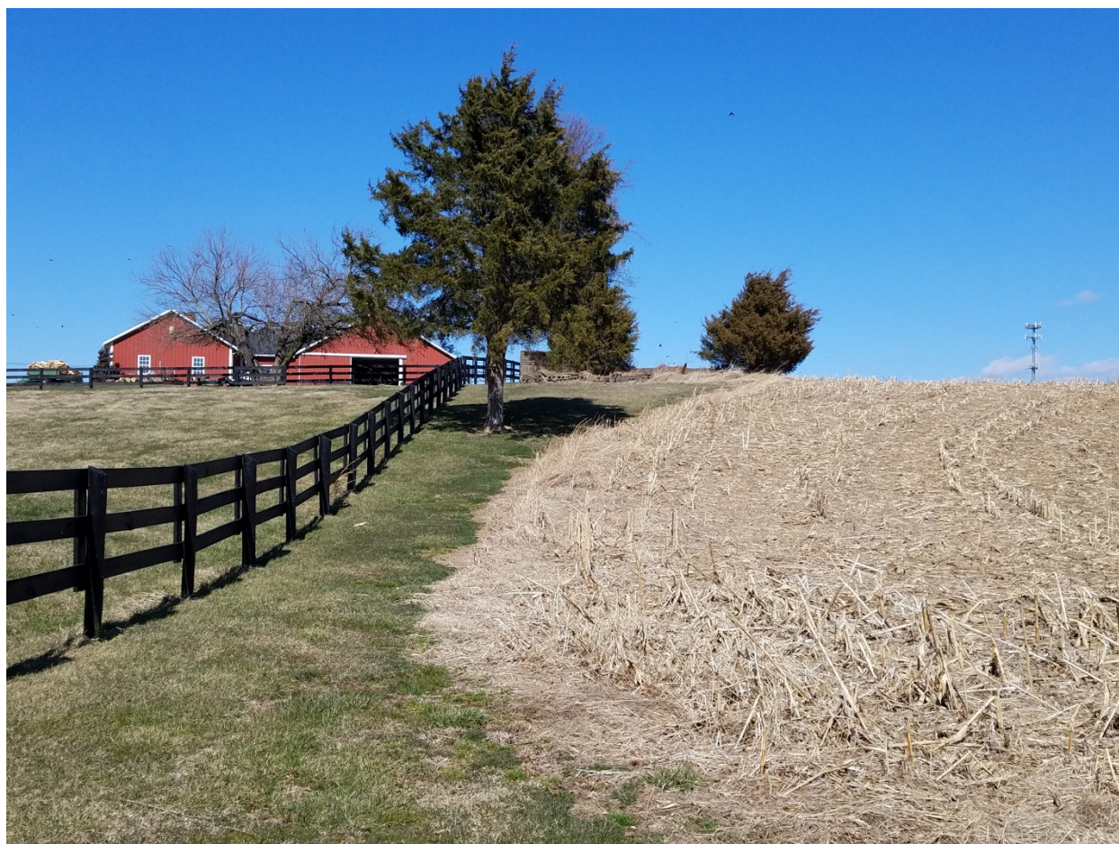
1. Access to cemetery from farm house, facing north