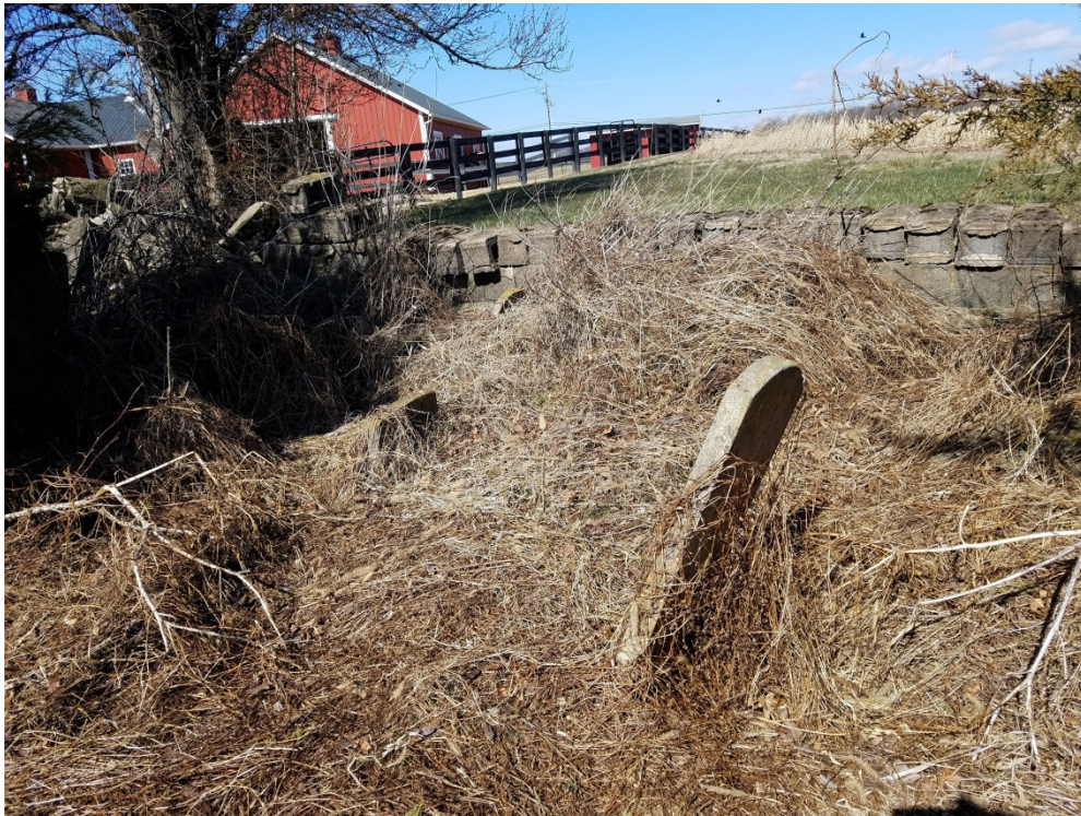
6. Interior of cemetery enclosure, facing northwest