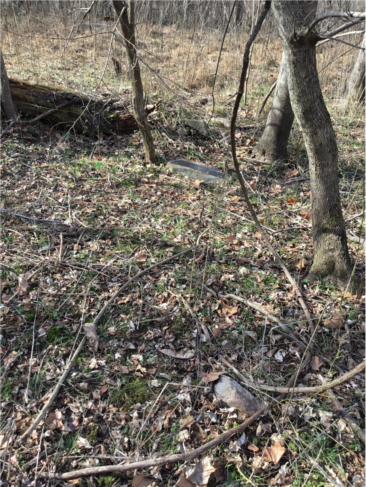
5. Burial site 1, facing west