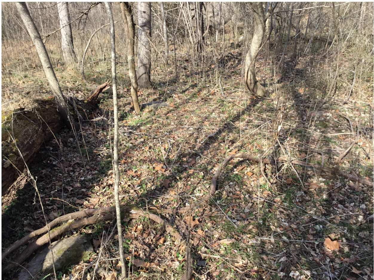
4. Burial site 1, facing north