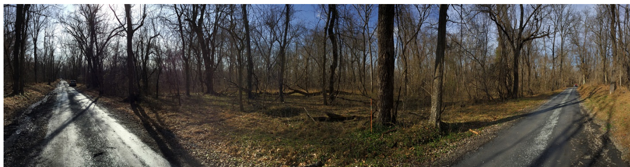
1. Panoramic at location from south to west to north