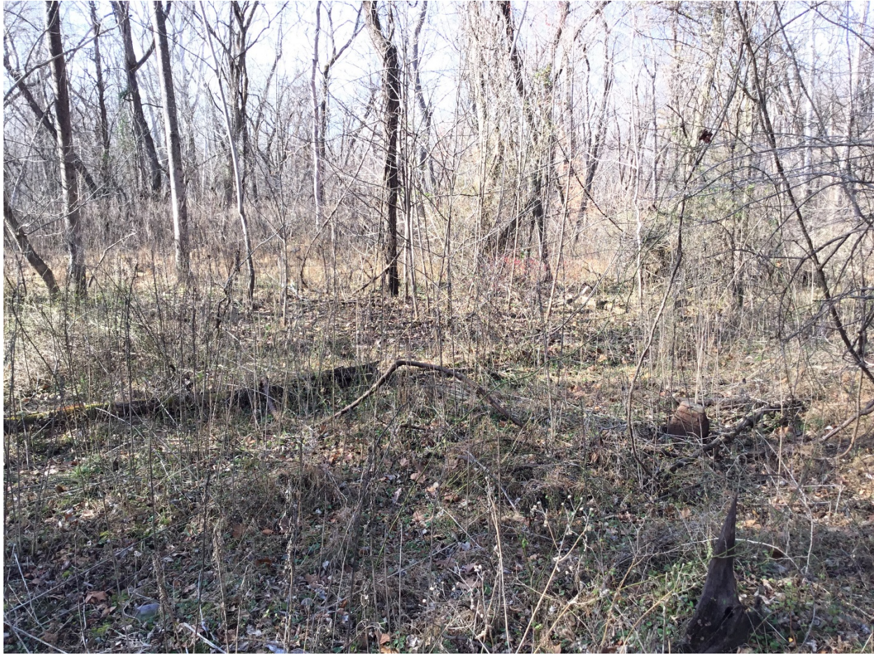
10. Burial site 2, facing west