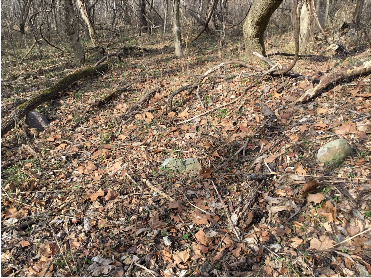
12. Burial site 3, facing west