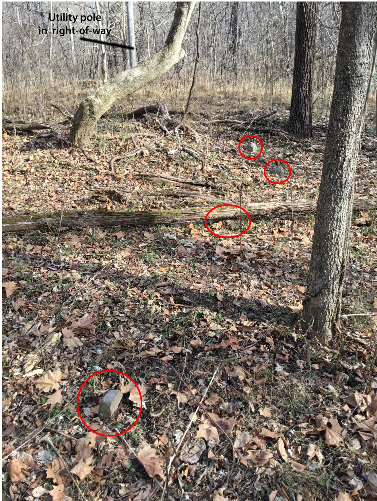
11. Burial site 3, facing east