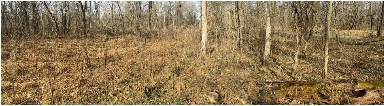
3. Panoramic at burial site from west to north to east