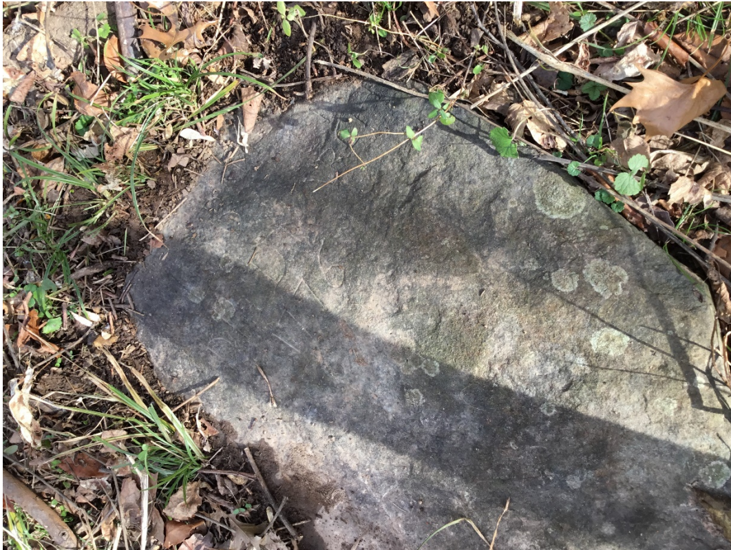
6. Burial site 1, Elizabeth (Hickman) Burns grave marker