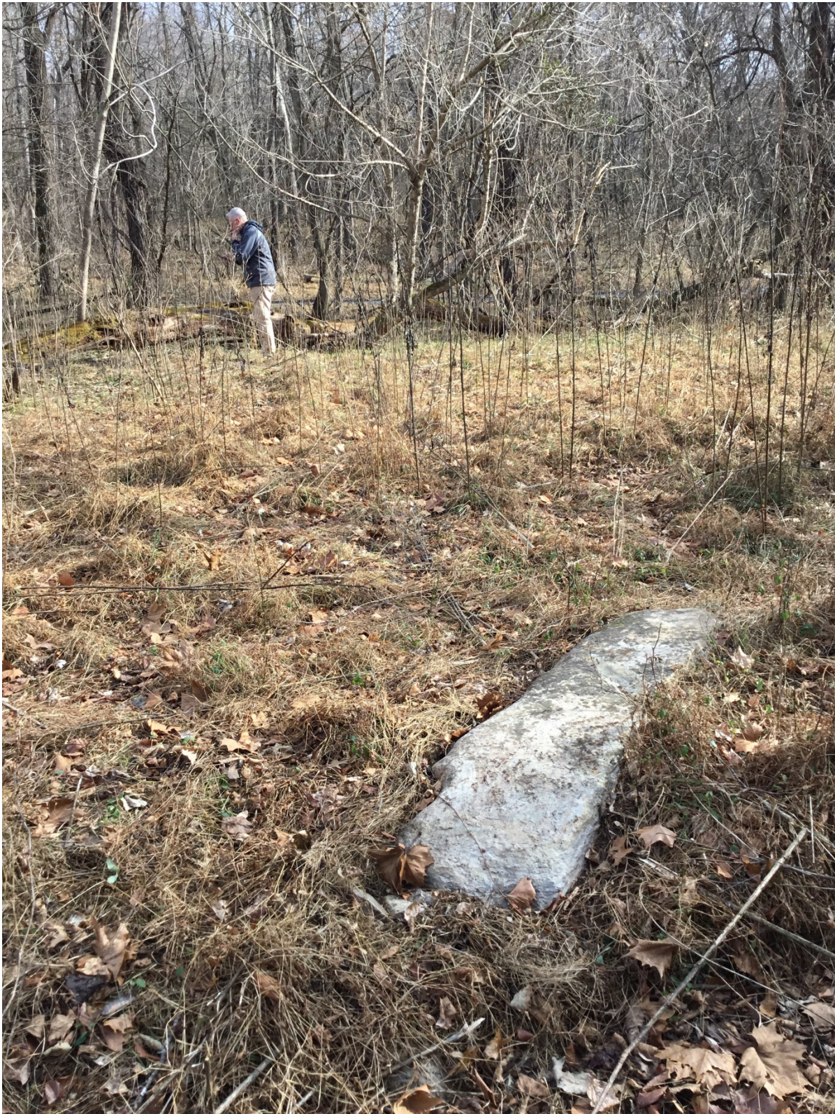
8. Long, unmarked boulder in right-of-way