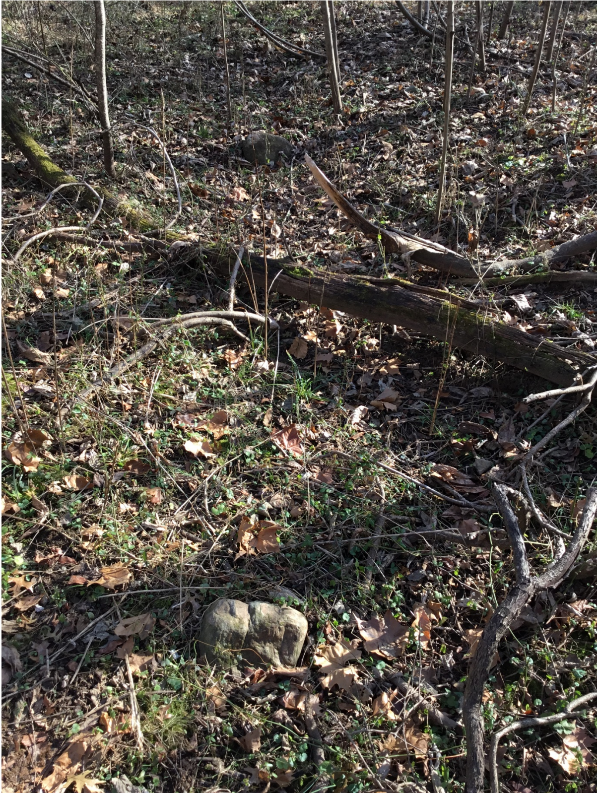
9. Burial site 2, facing south