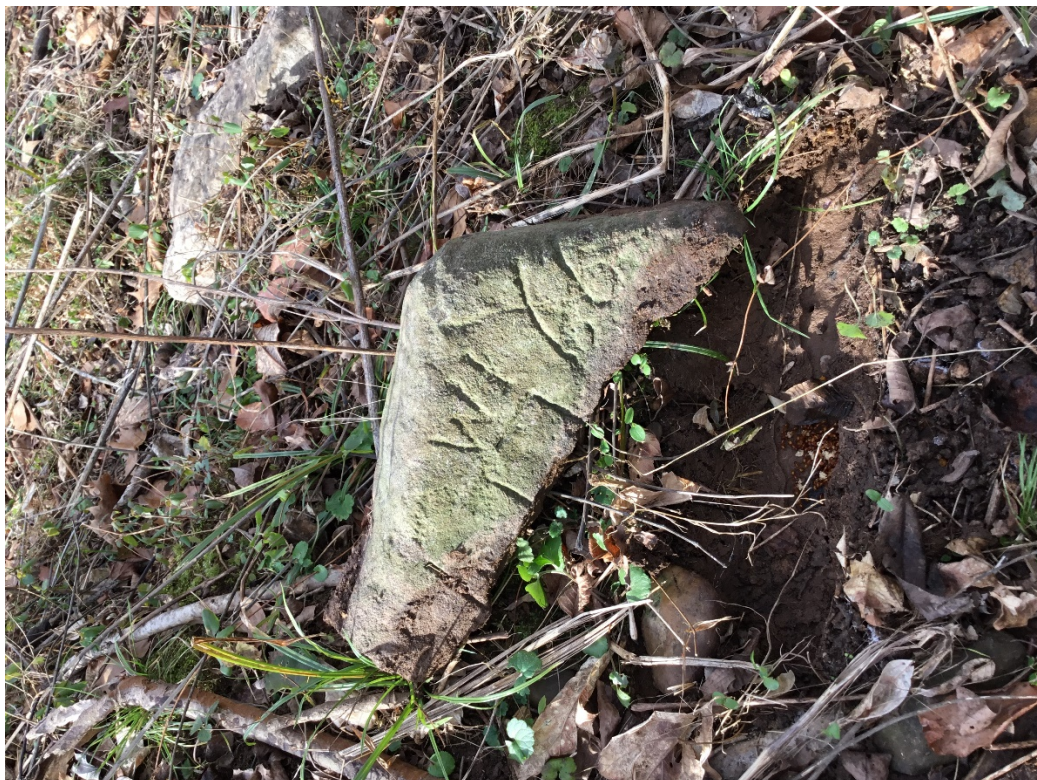
7. Burial site 1, William Hickman grave marker