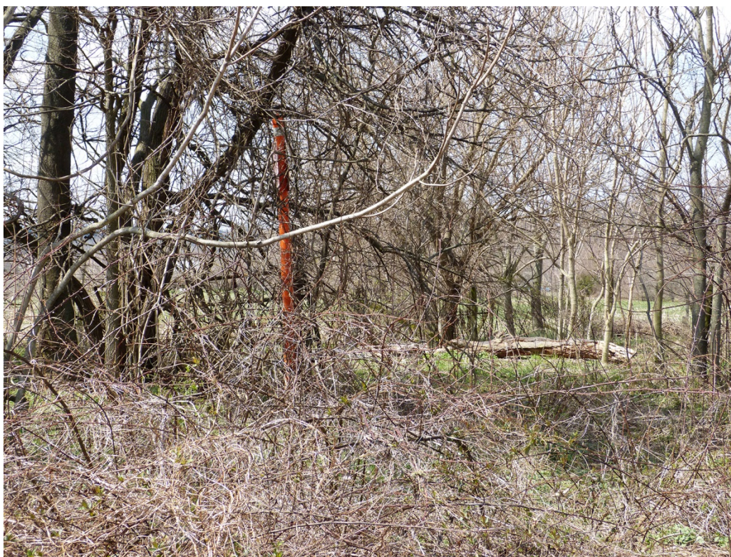
1. View from dirt road toward cemetery, facing west