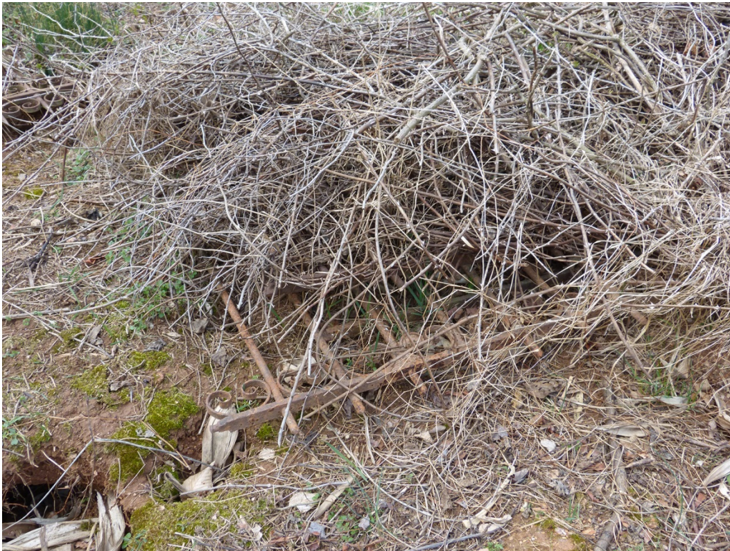
19. Wrought iron fence under brush pile