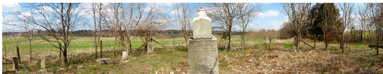
3. Panoramic from west to north to east