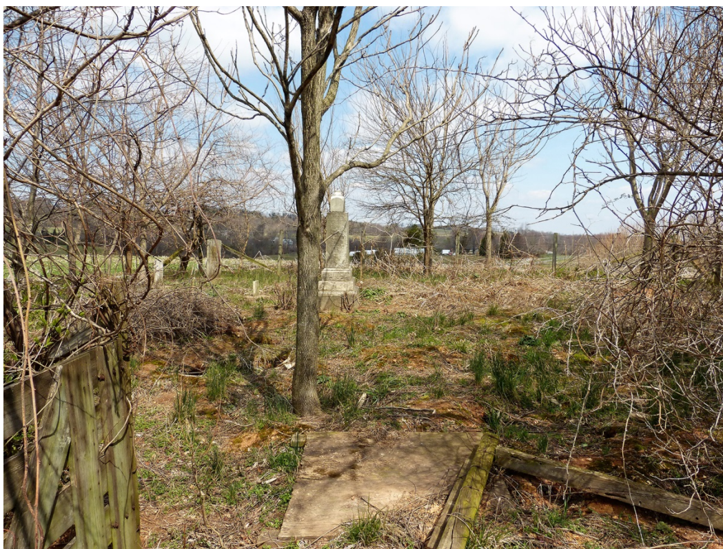
2. View toward center of cemetery, facing north