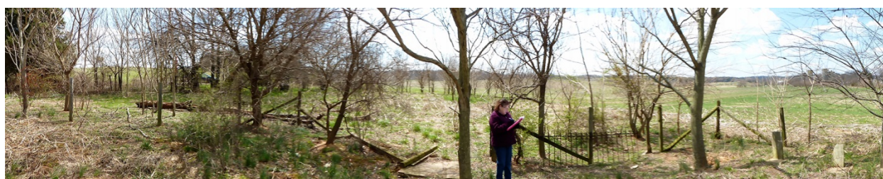
4. Panoramic from east to south to west