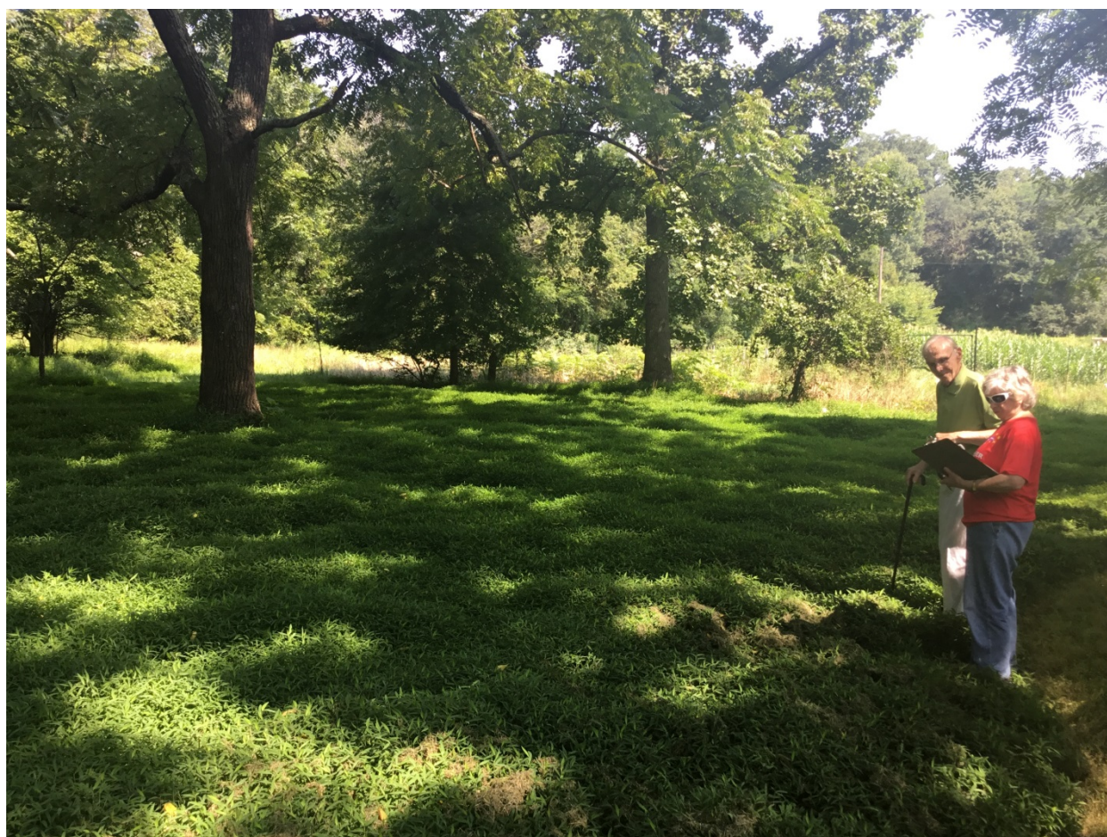
1. Pathway across to back-right corner of yard, facing northwest