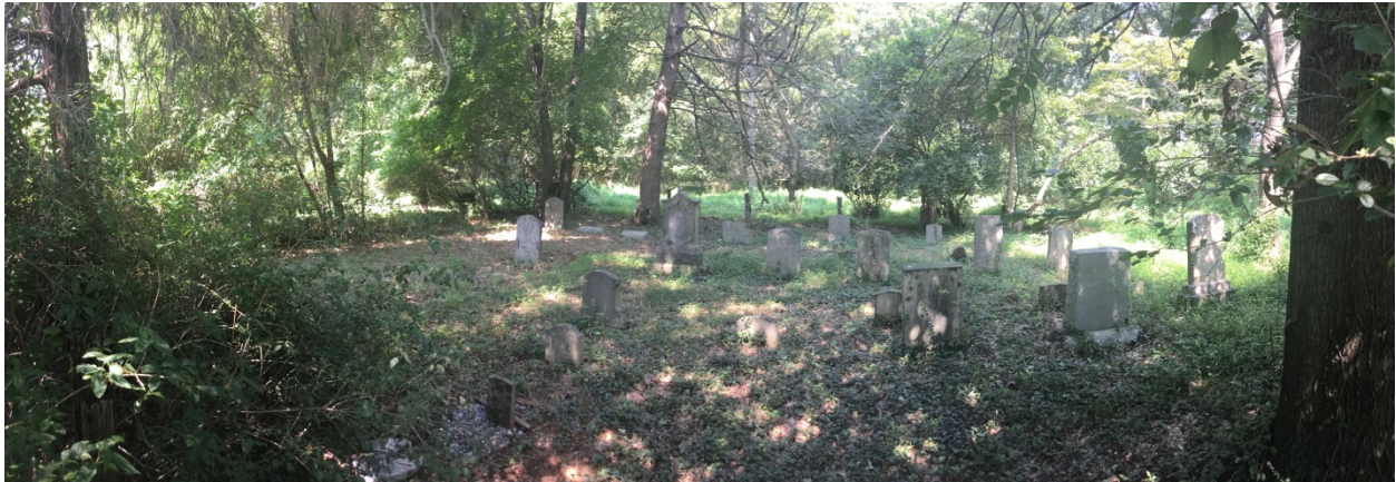
4. Panoramic from south to west to north