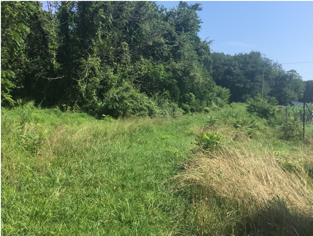
2. Grass pathway along tree line, facing north