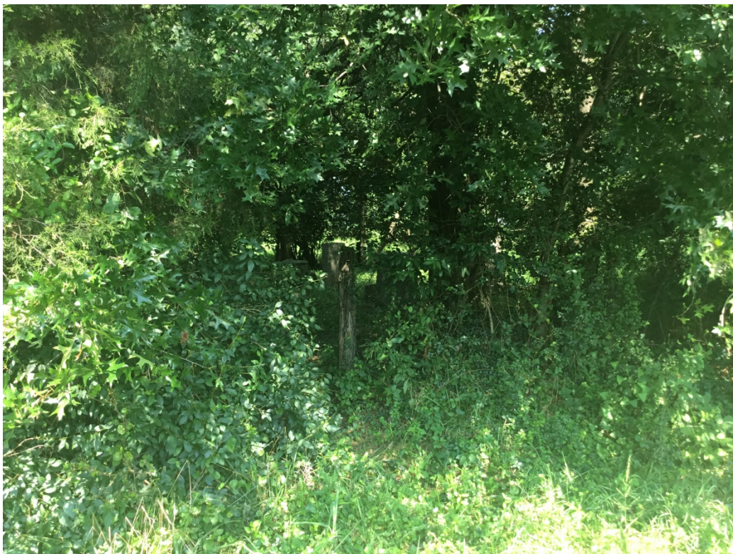
3. Entrance to cemetery, facing west