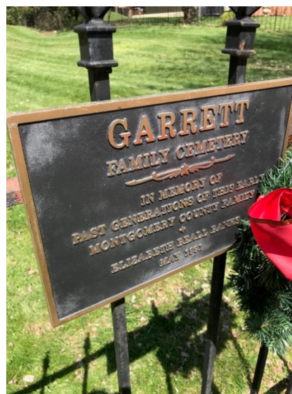
3. Gate plaque