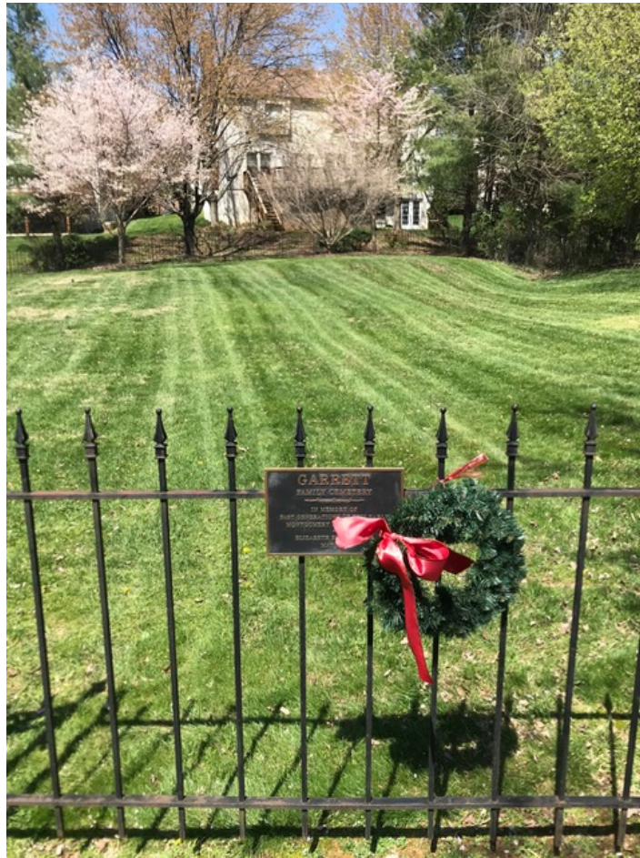
2. Center of cemetery at gate, facing north