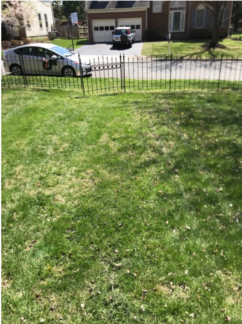
4. Center of cemetery, facing south to Englefield Drive