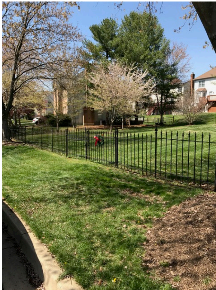
1. View from Englefield Drive, facing north

*No panoramic was taken, due to proximity of private homes on each side.