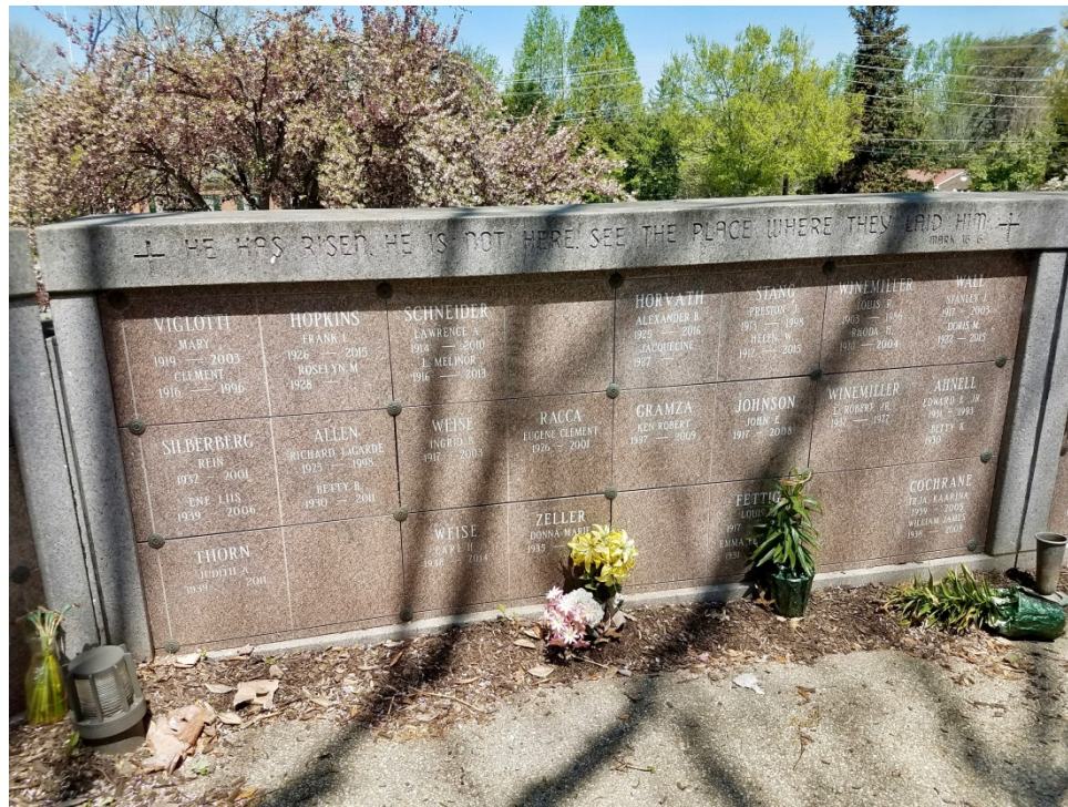
7. Columbarium, panel 2, facing north