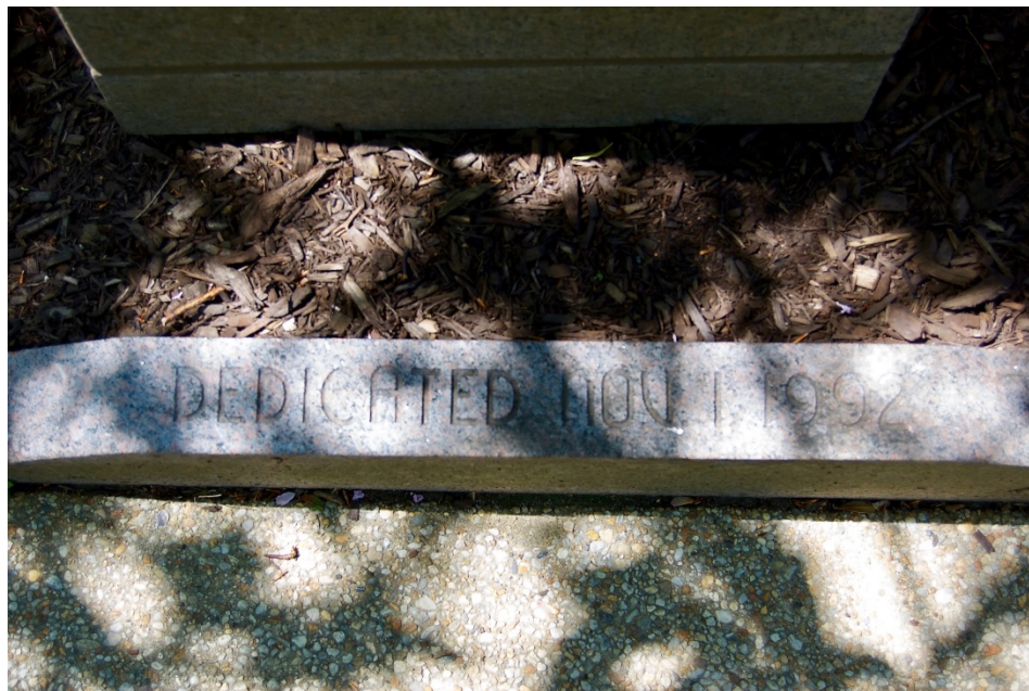
10. Dedication stone