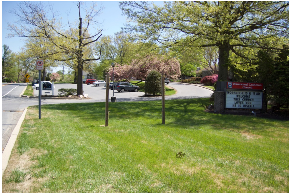
1. Entrance from Bradley Blvd., facing east