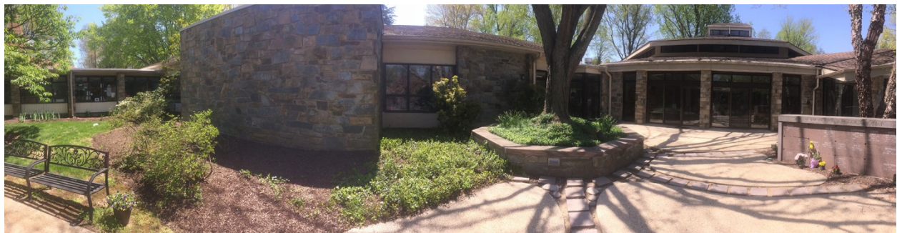
3. Panoramic from east to south to west