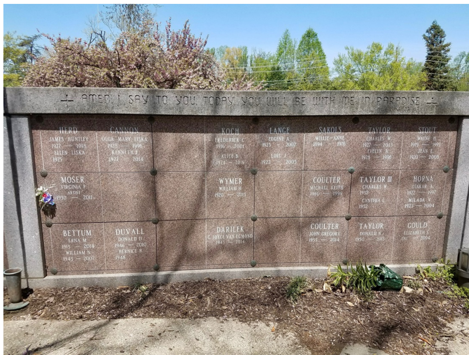
8. Columbarium, panel 3, facing north