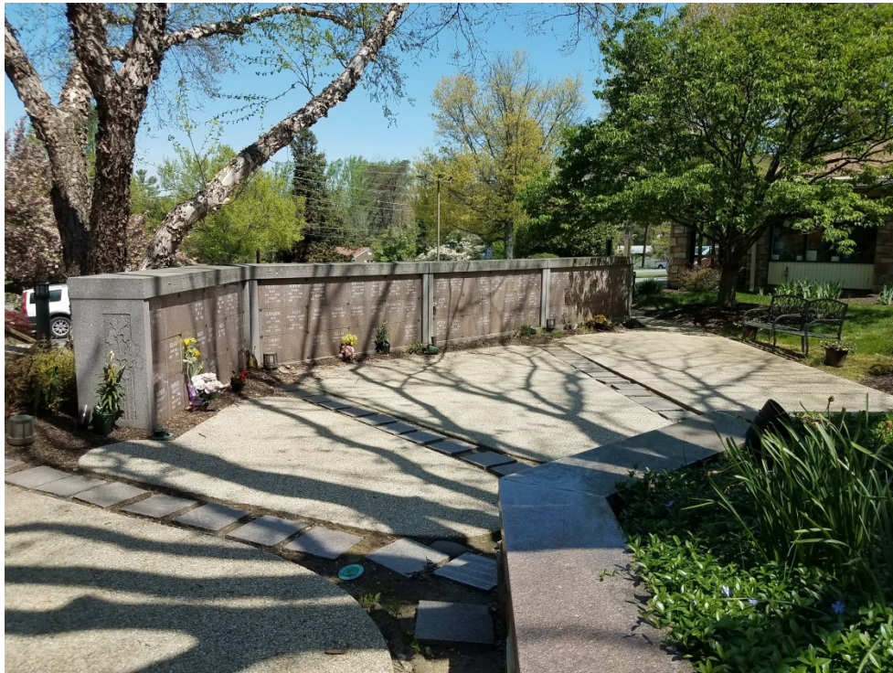
5. Columbarium, facing north