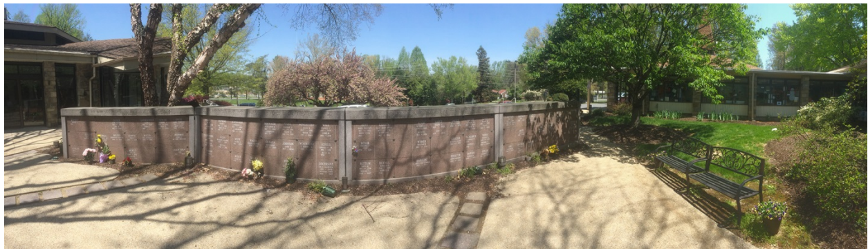
4. Panoramic from west to north to east