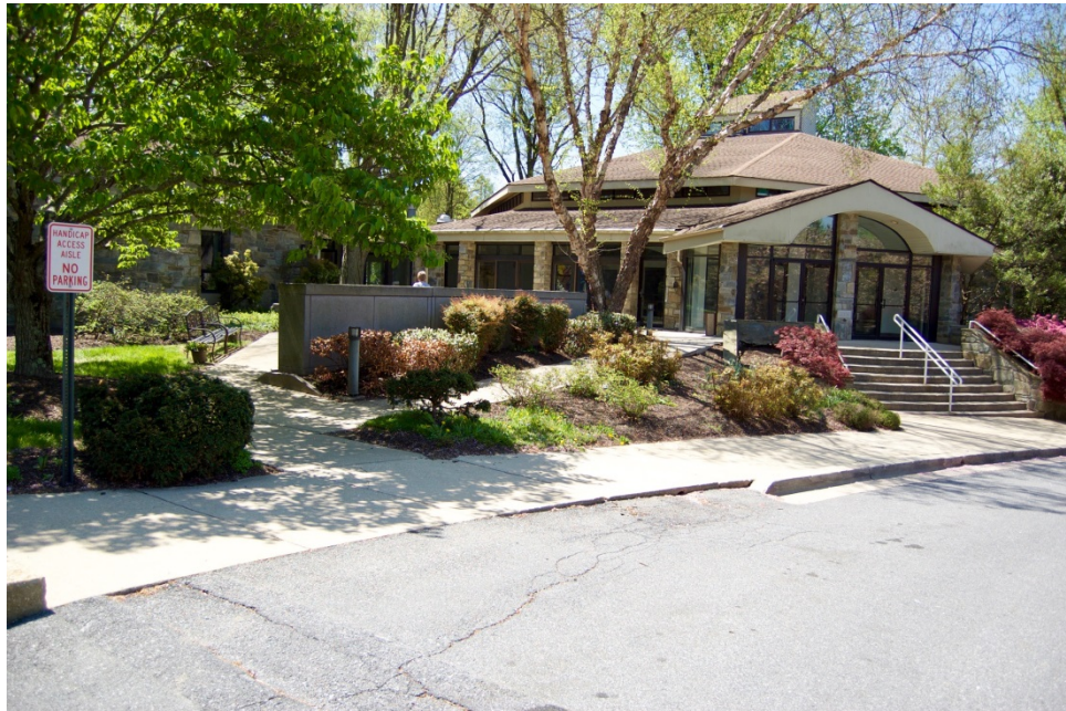
2. Church and garden entrance, facing south