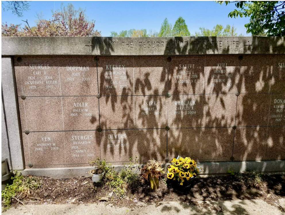
9. Columbarium, panel 4, facing north