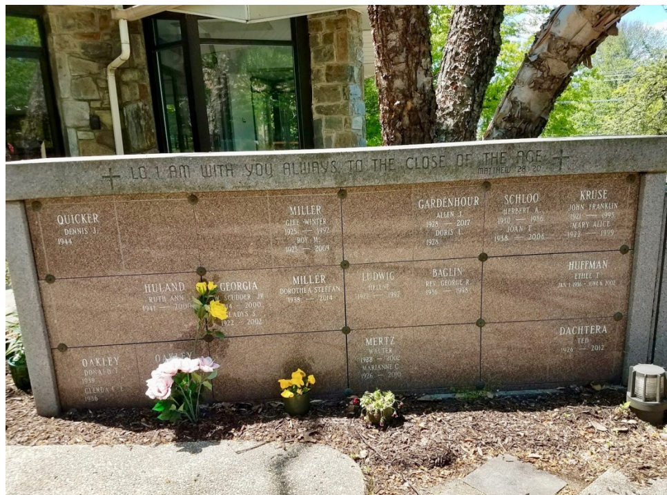
6. Columbarium, panel 1, facing north