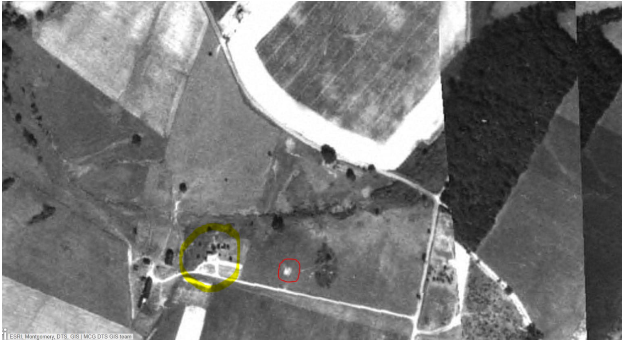
1950 aerial showing the Dorsey house and a square patch to its east. The location matches the distances mapped by the Kettler Brothers before they demolished the house in 1972 and relocated the graves to Forest Oak Cemetery in Gaithersburg.