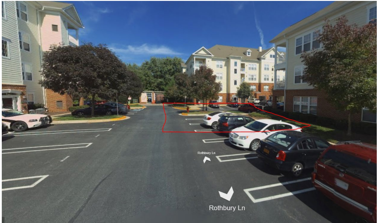
Location of cemetery under parking lot next to 20121 Rothbury Lane.