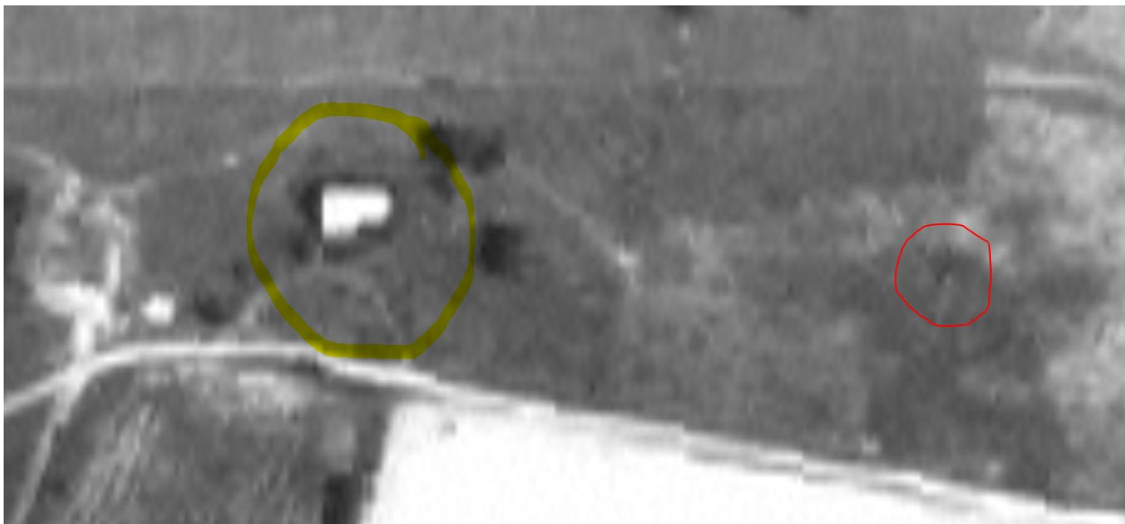
1970 aerial identifying the extension to the east side of house and a monument surrounded by a square fence to its east.