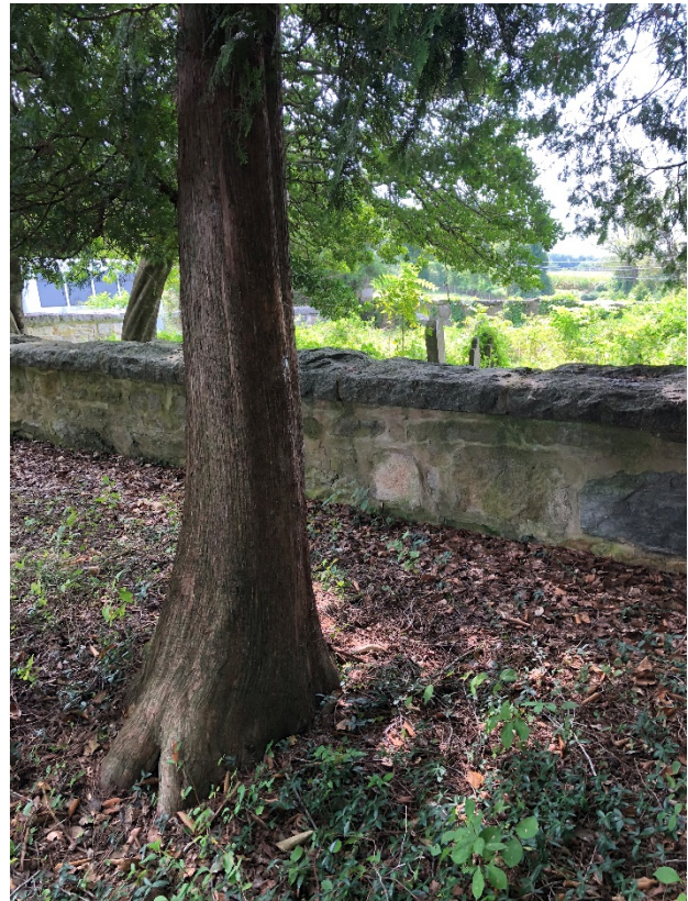
4. Cemetery wall, facing southeast