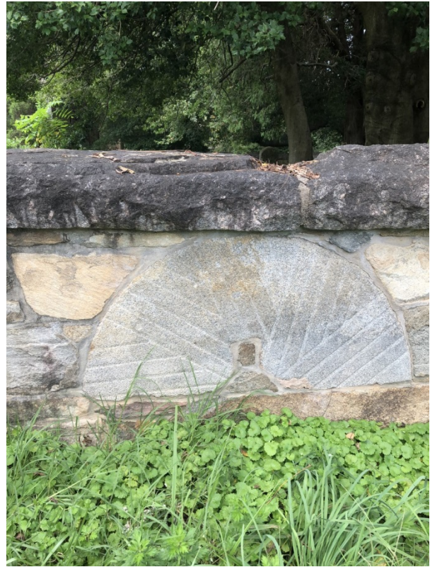
7. Millstone incorporated in cemetery wall