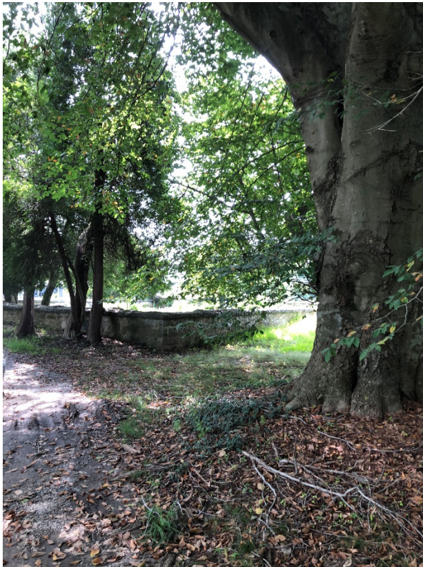
3. Approach to cemetery, facing southeast