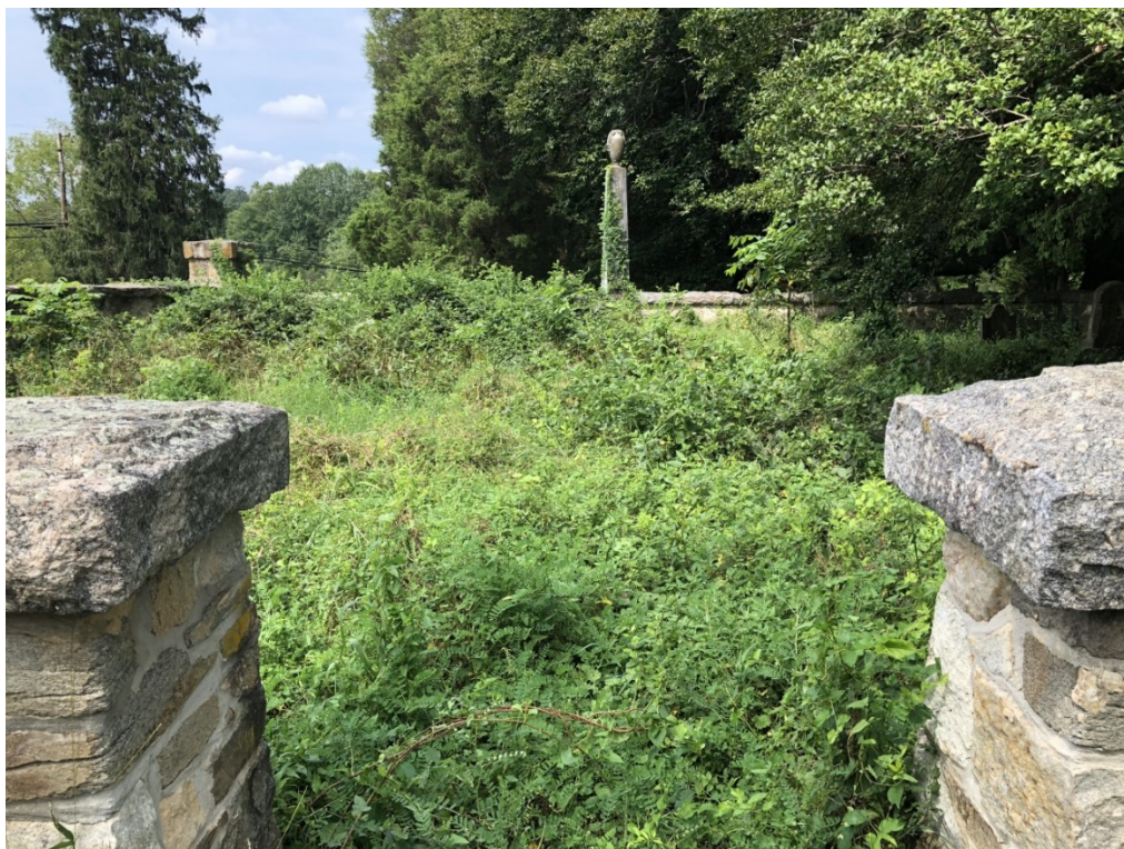
5. Cemetery entrance, facing southwest (toward Georgia Ave.)