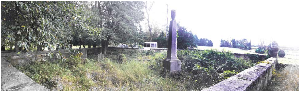
8. Panoramic from north to east to south