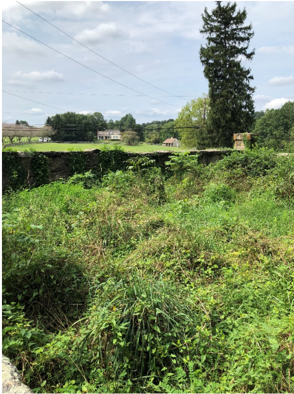
6. Center of cemetery, facing northwest