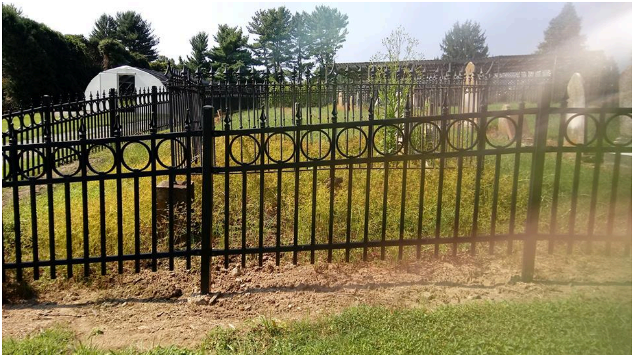
6. Ground erosion on the east side of cemetery, facing west