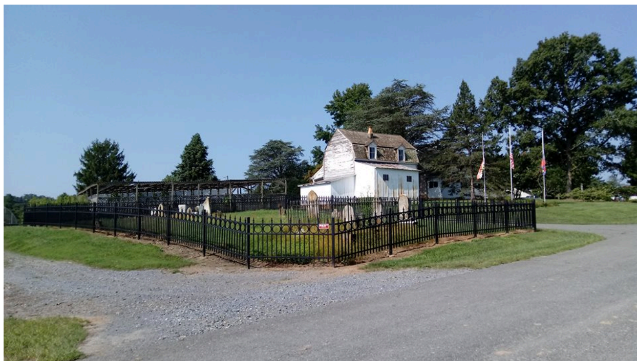
1. Approach to cemetery from main driveway, facing west