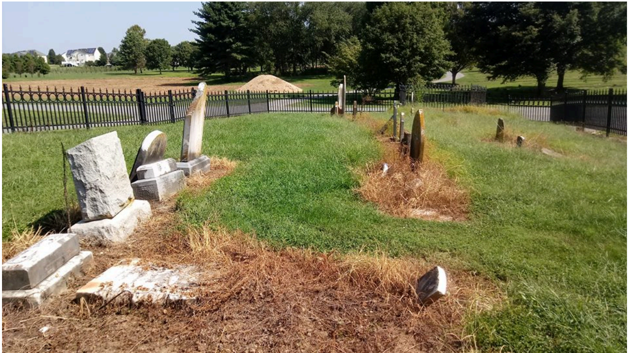
2. Center of cemetery, facing east