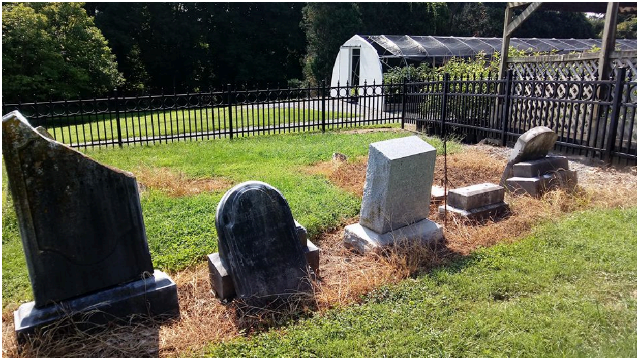
5. Displaced grave markers on the west side of cemetery, facing south