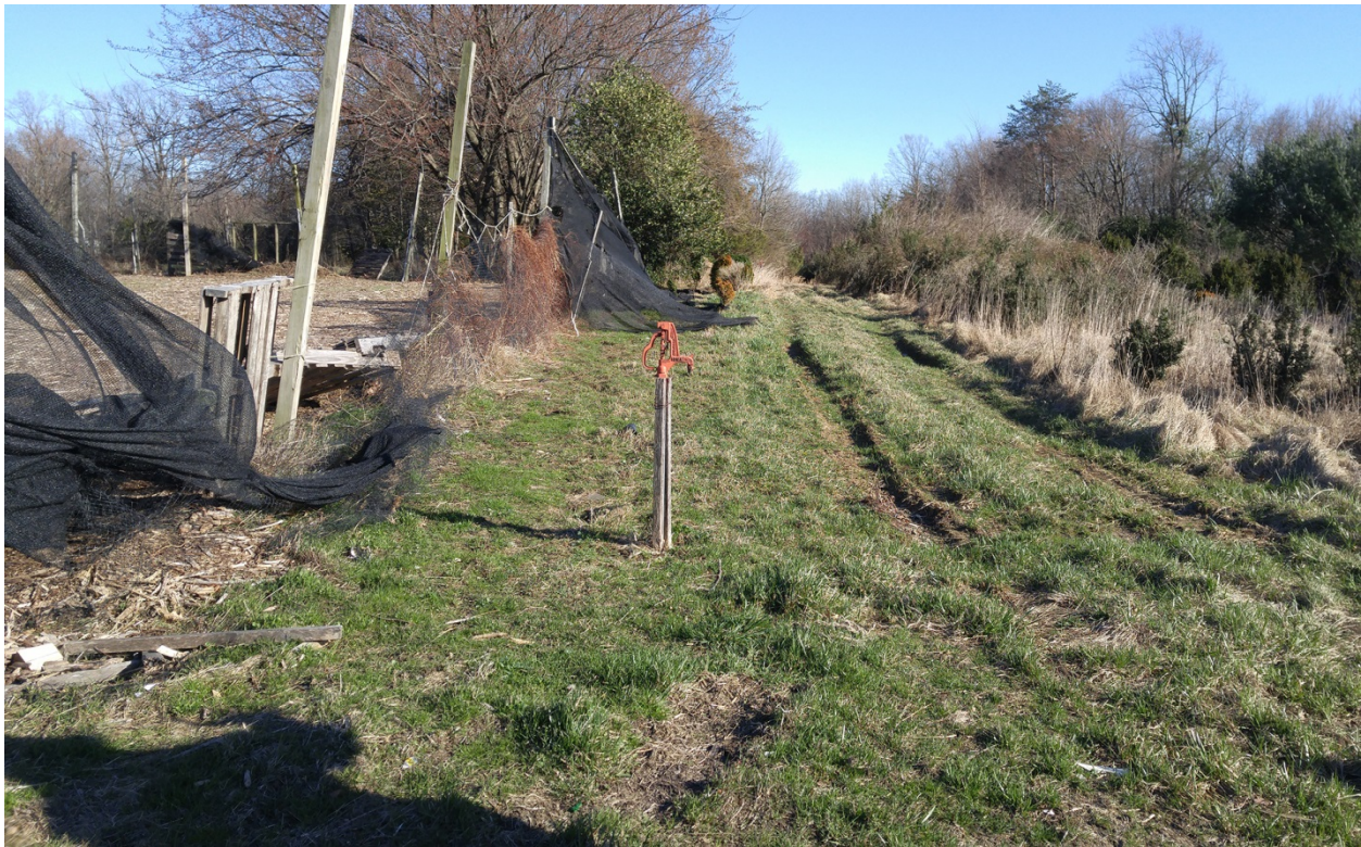
2. Gravel drive where right turn to go to cemetery