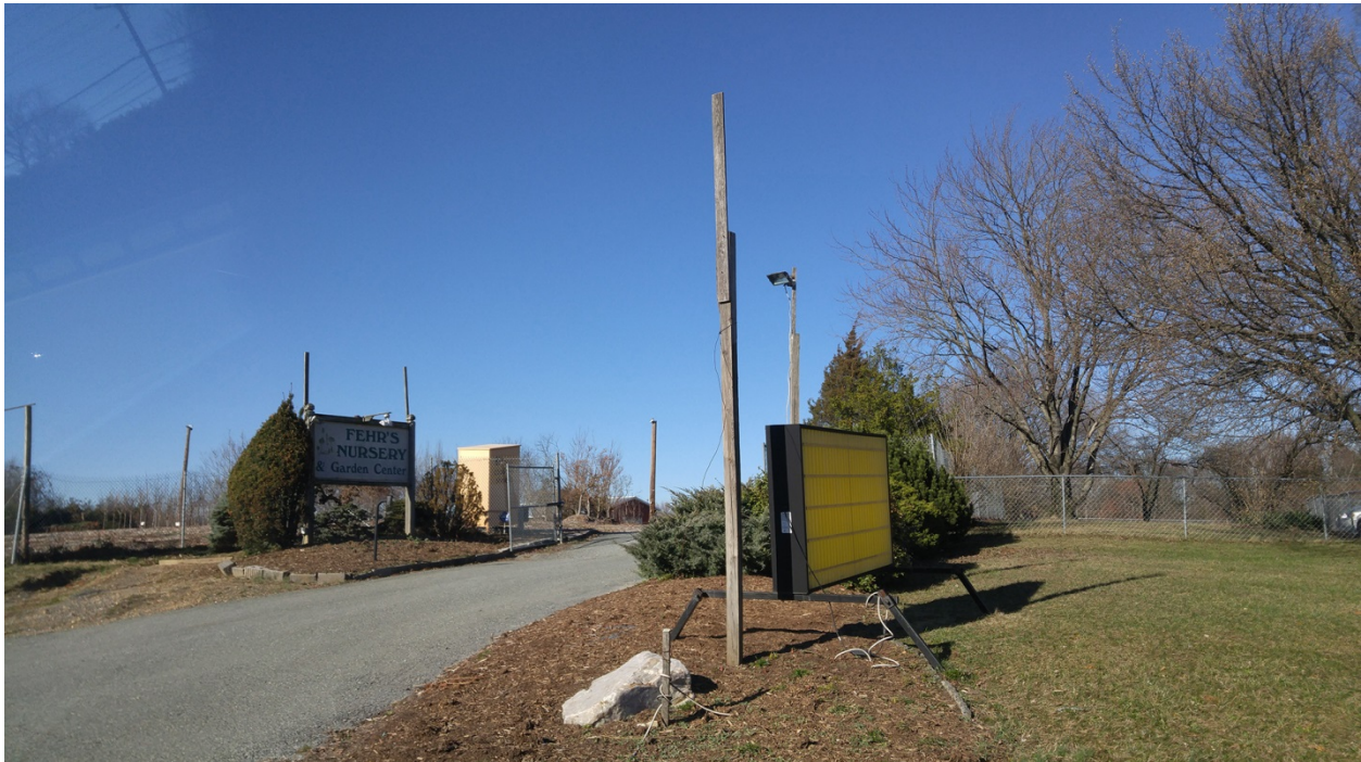
1. Fehr's Nursery & Garden Center entrance