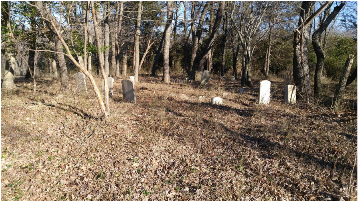
4. View to center of cemetery