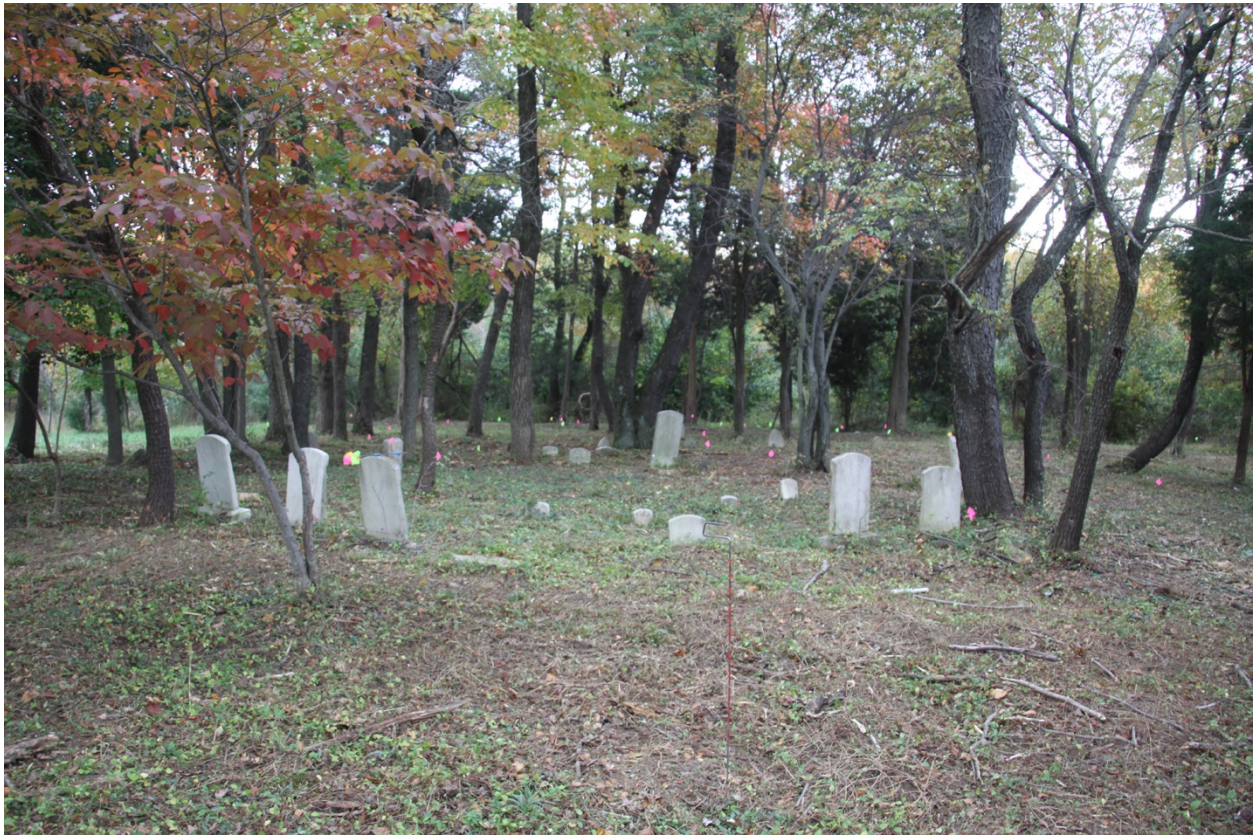
6. Taken after cemetery cleanup on 10/26/2011