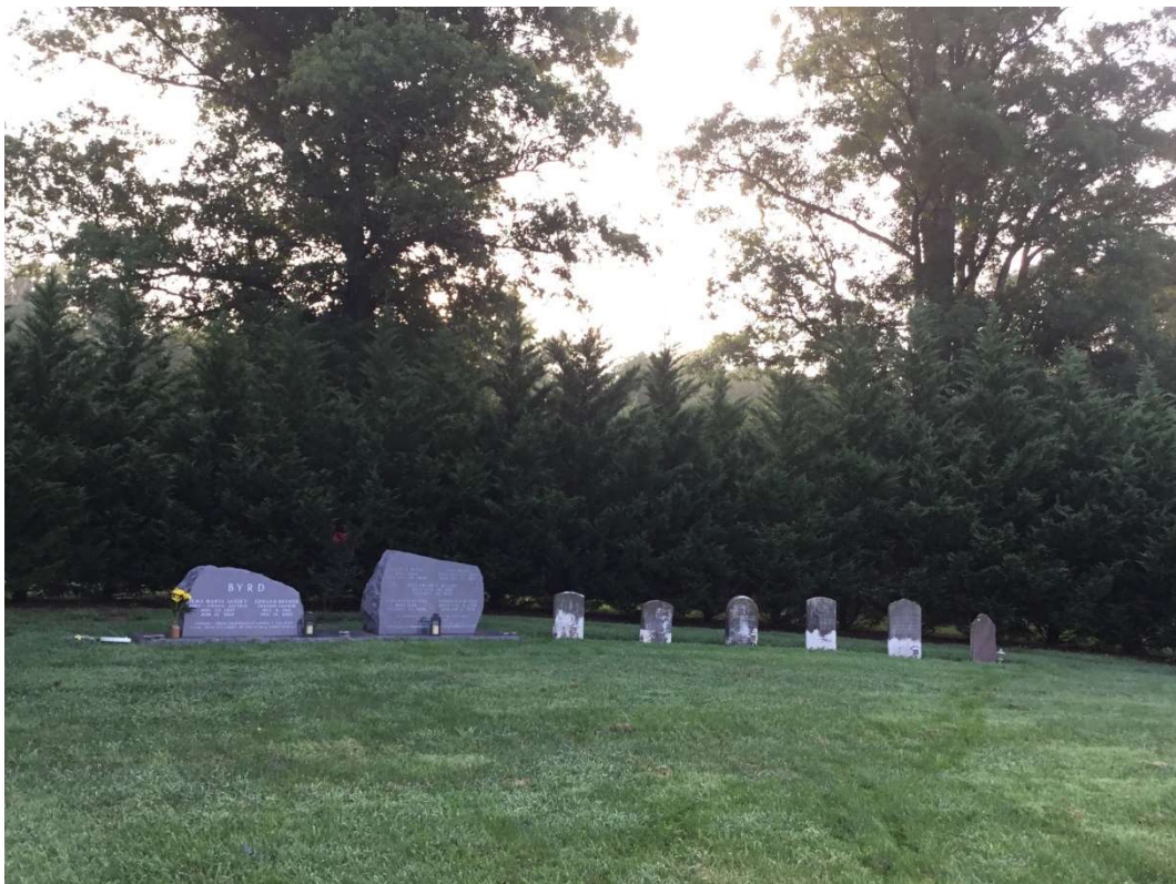
3. Cemetery at top of hill, facing east