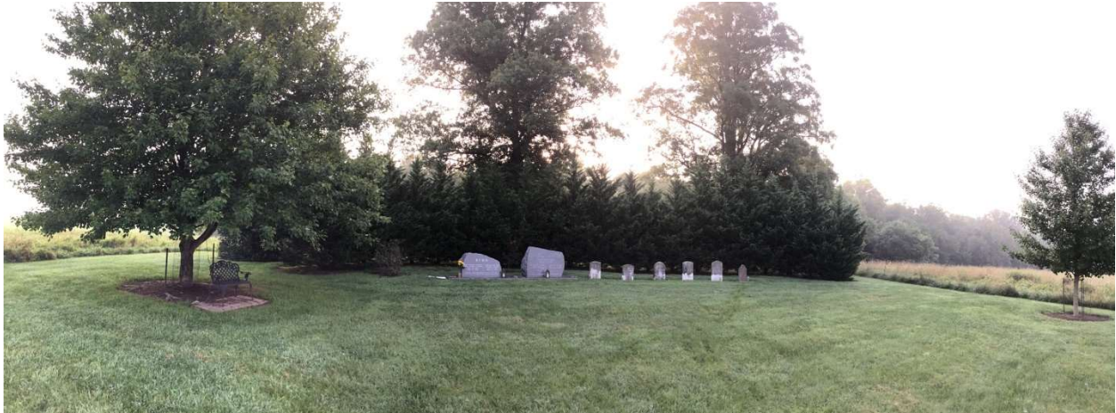
4. Panoramic from north to east to south