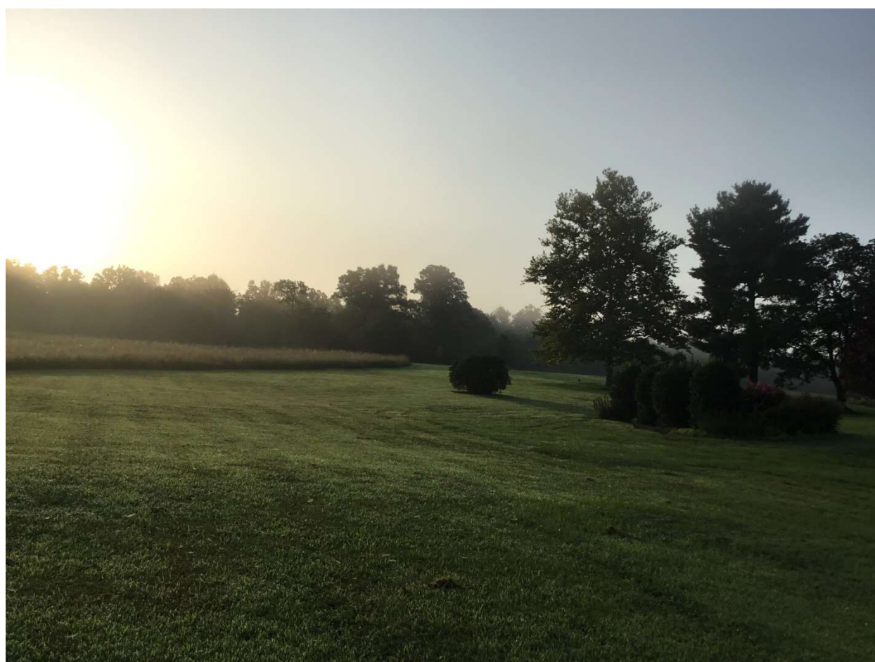
1. View toward cemetery at top of hill, facing east