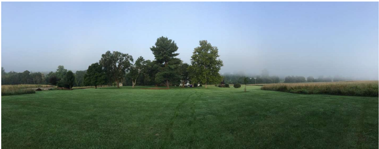
5. Panoramic from south to west to north