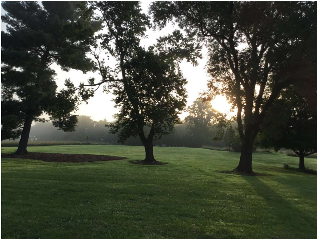
2. Approach to cemetery from the residence, facing east