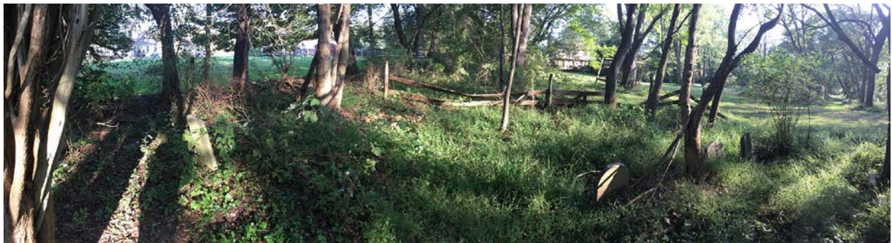
6. Panoramic from east to south to west