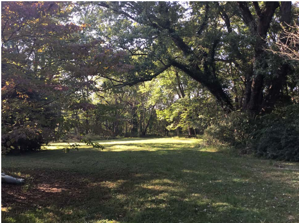
1. Approach to cemetery down right side of residence, facing northwest