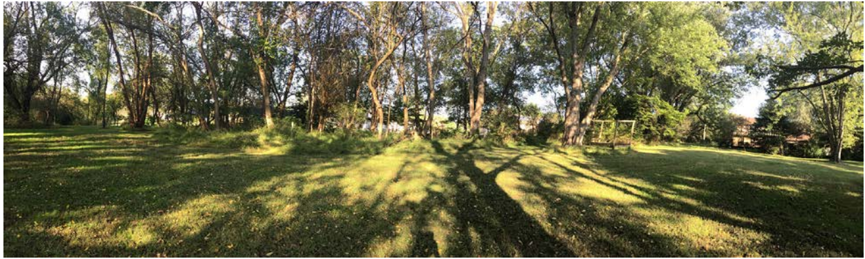
7. Panoramic of cemetery from yard, facing north