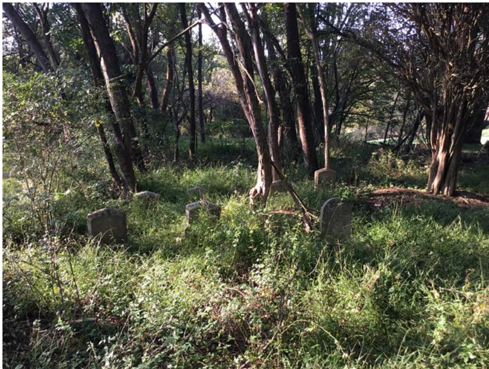
3. Center of cemetery, facing west