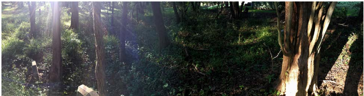
5. Panoramic from west to north to east