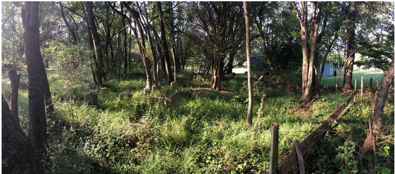
4. Fence line, facing north