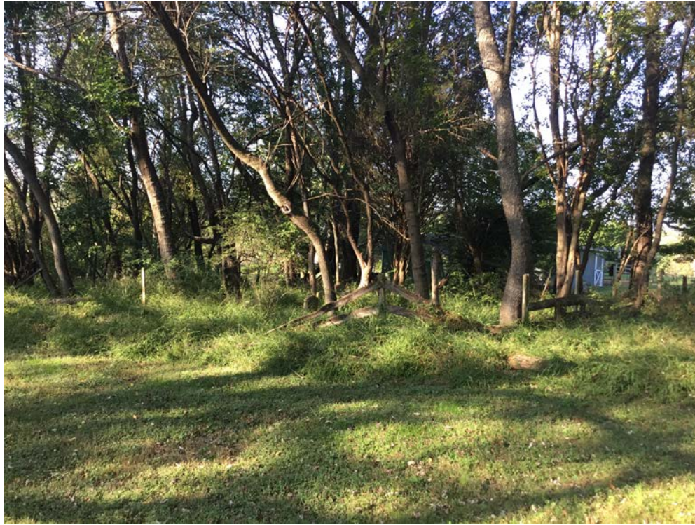
2. Initial view of cemetery, facing north