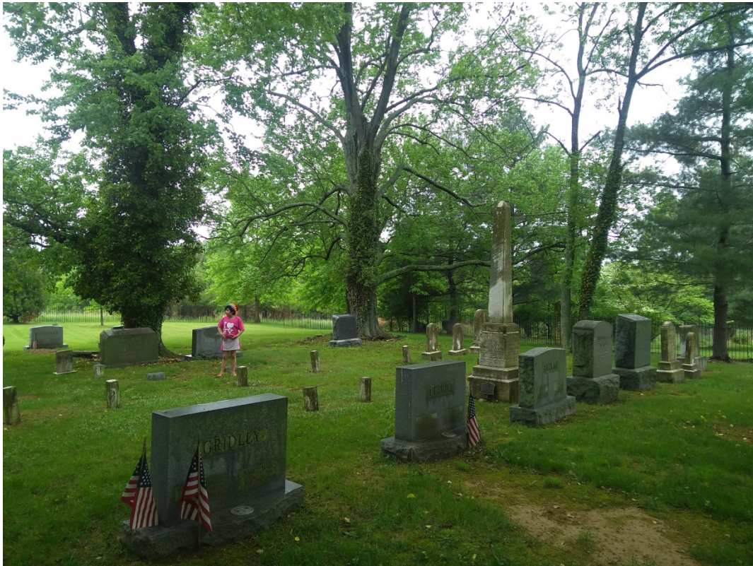
5. Center of cemetery, facing north