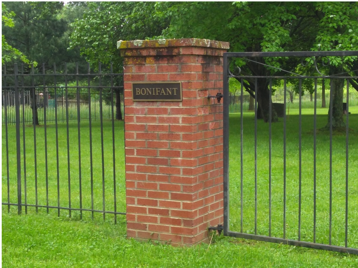
2. Cemetery sign at entrance gate, facing west