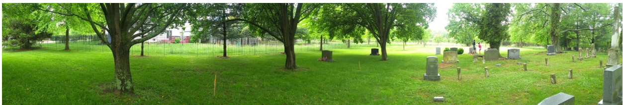
4. Panoramic from east to south to west