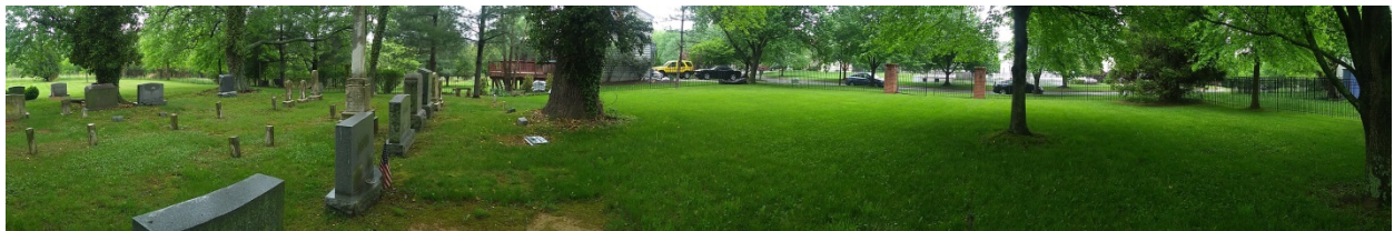
3. Panoramic from west to north to east