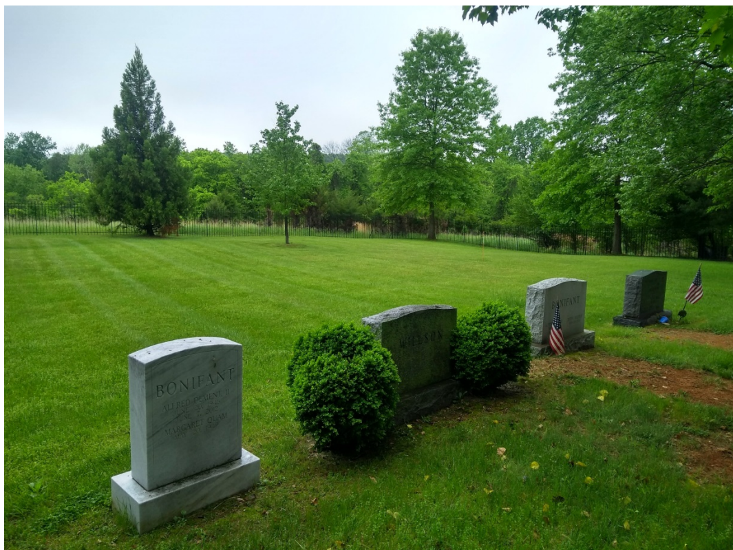
6. Center of cemetery, facing west