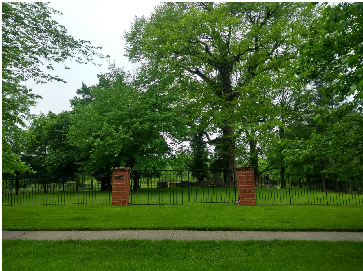
1. Approach to cemetery from Pebblestone Drive, facing west