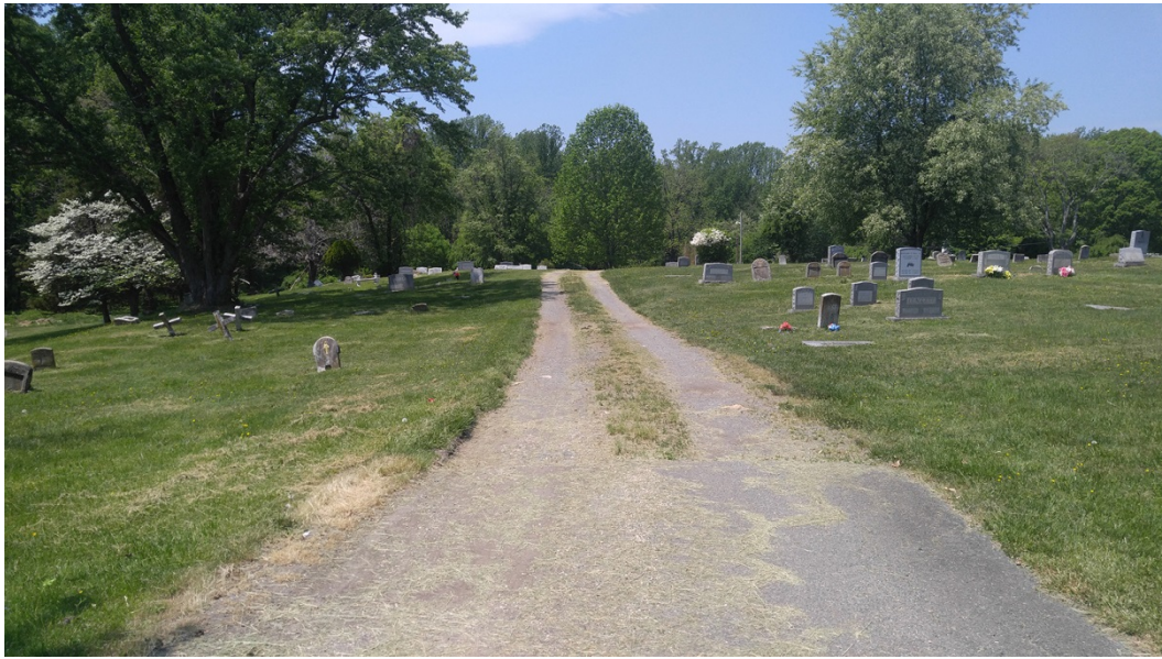
2. View into cemetery from entrance