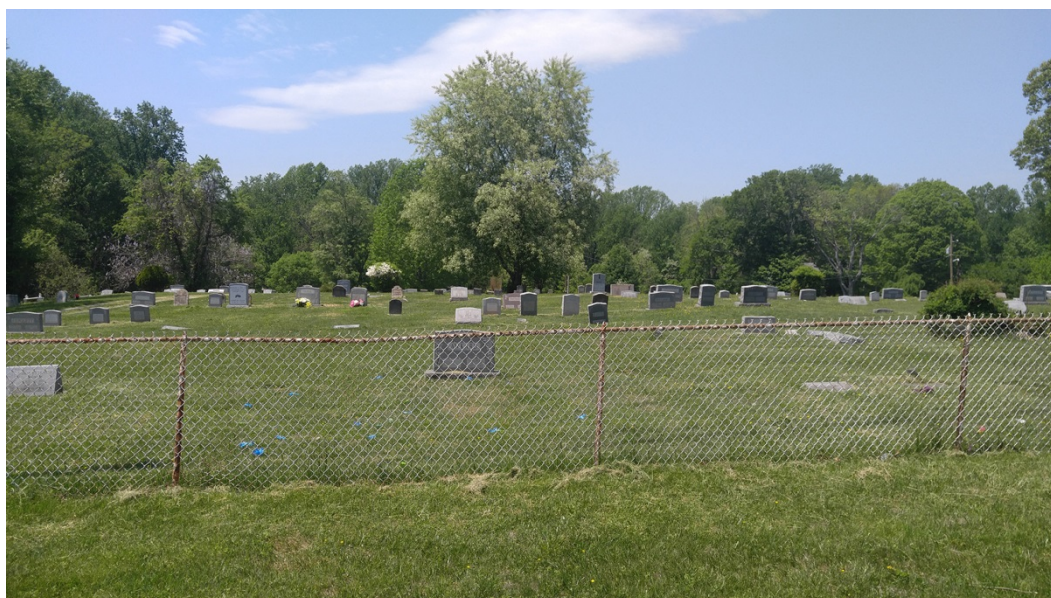
1. Approach to cemetery from Chandlee Mill Road, facing west