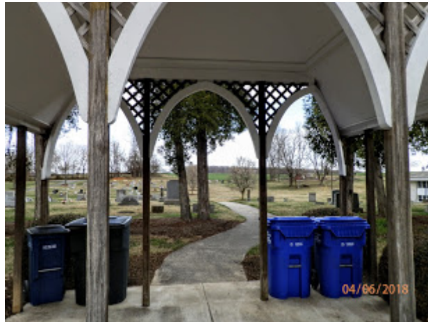
2. Entrance breezeway to cemetery, facing east