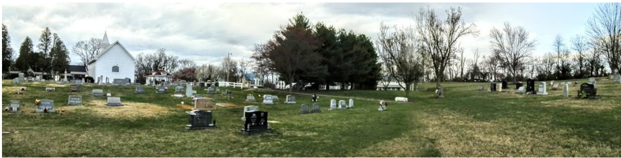
3. Panoramic from west to north to east