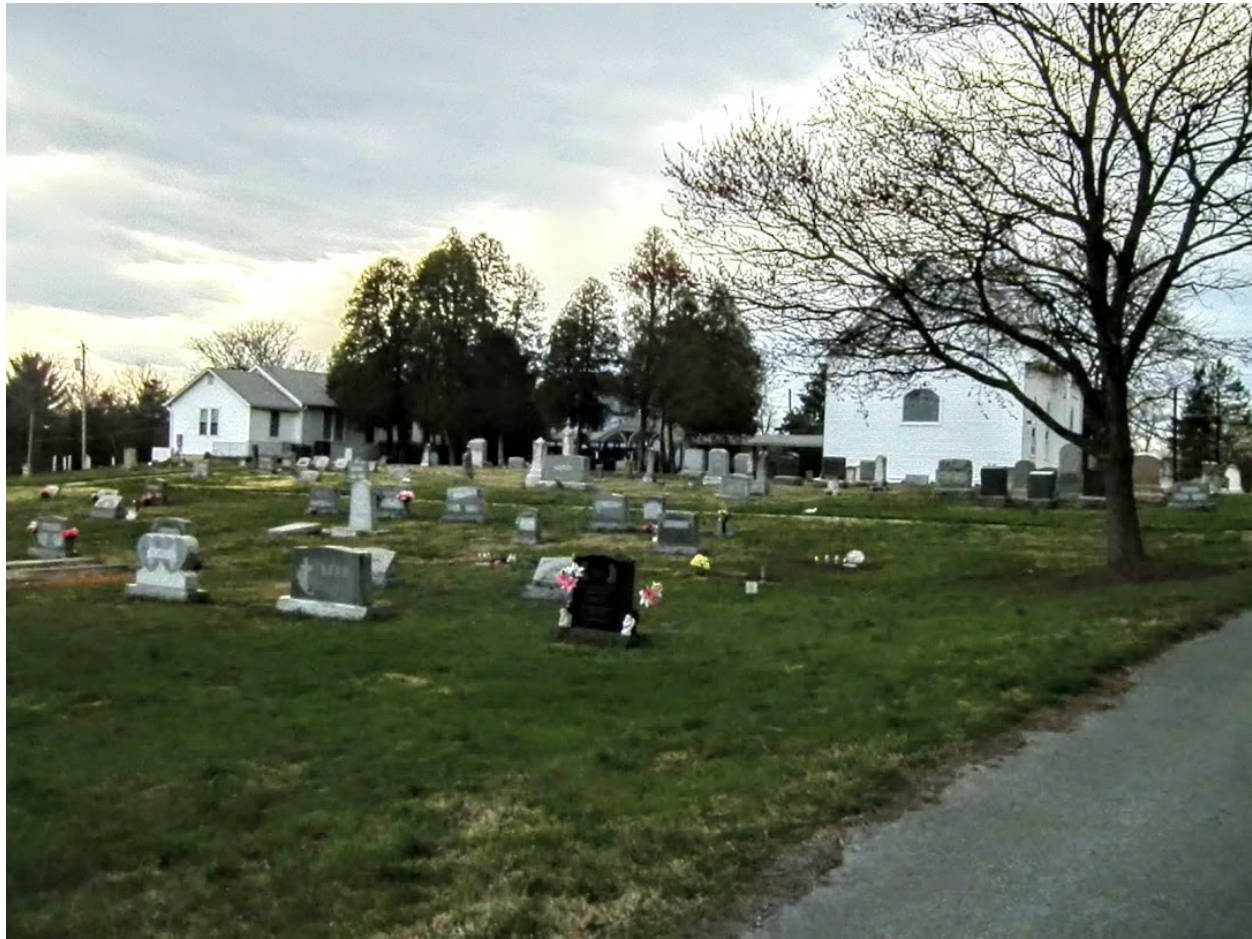
5. View from the north-side access lane, facing west