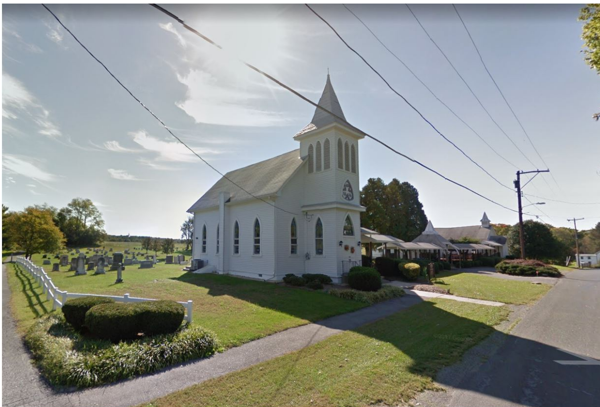
1. Approach to the church on White Ground Road, facing south