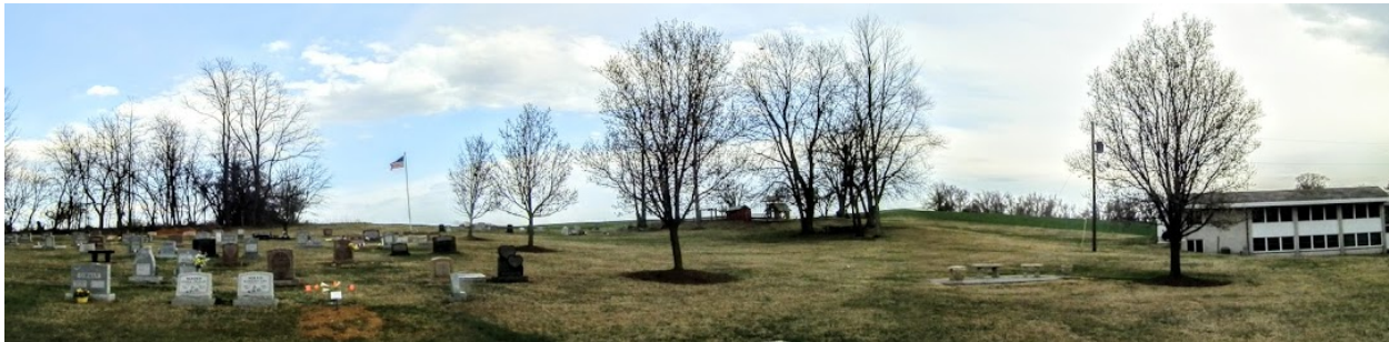
4. Panoramic from east to south to west