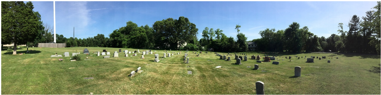
5. Panoramic from east to south to west