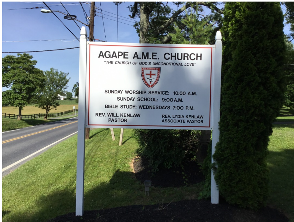
2. Church sign from Brink Road, facing east