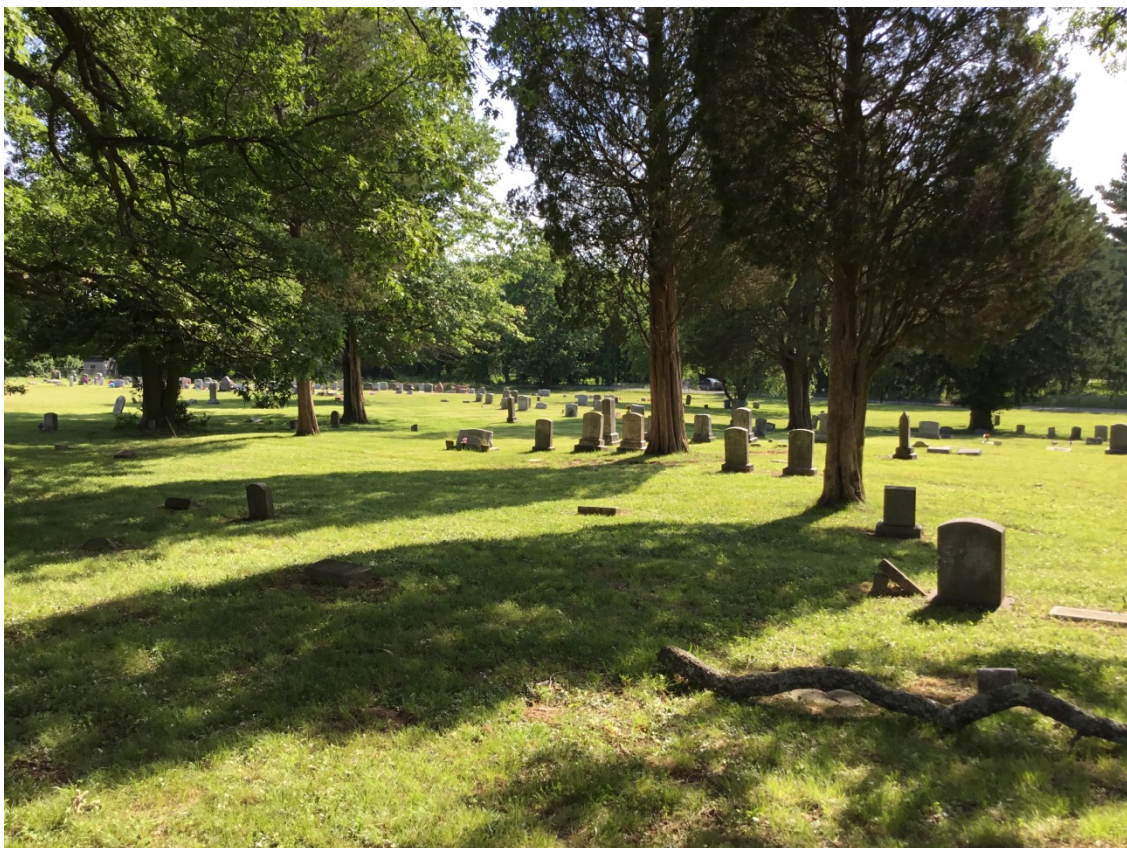
3. View toward cemetery, facing south-west