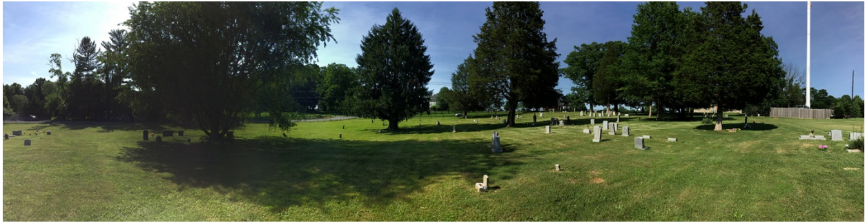
4. Panoramic from west to north to east