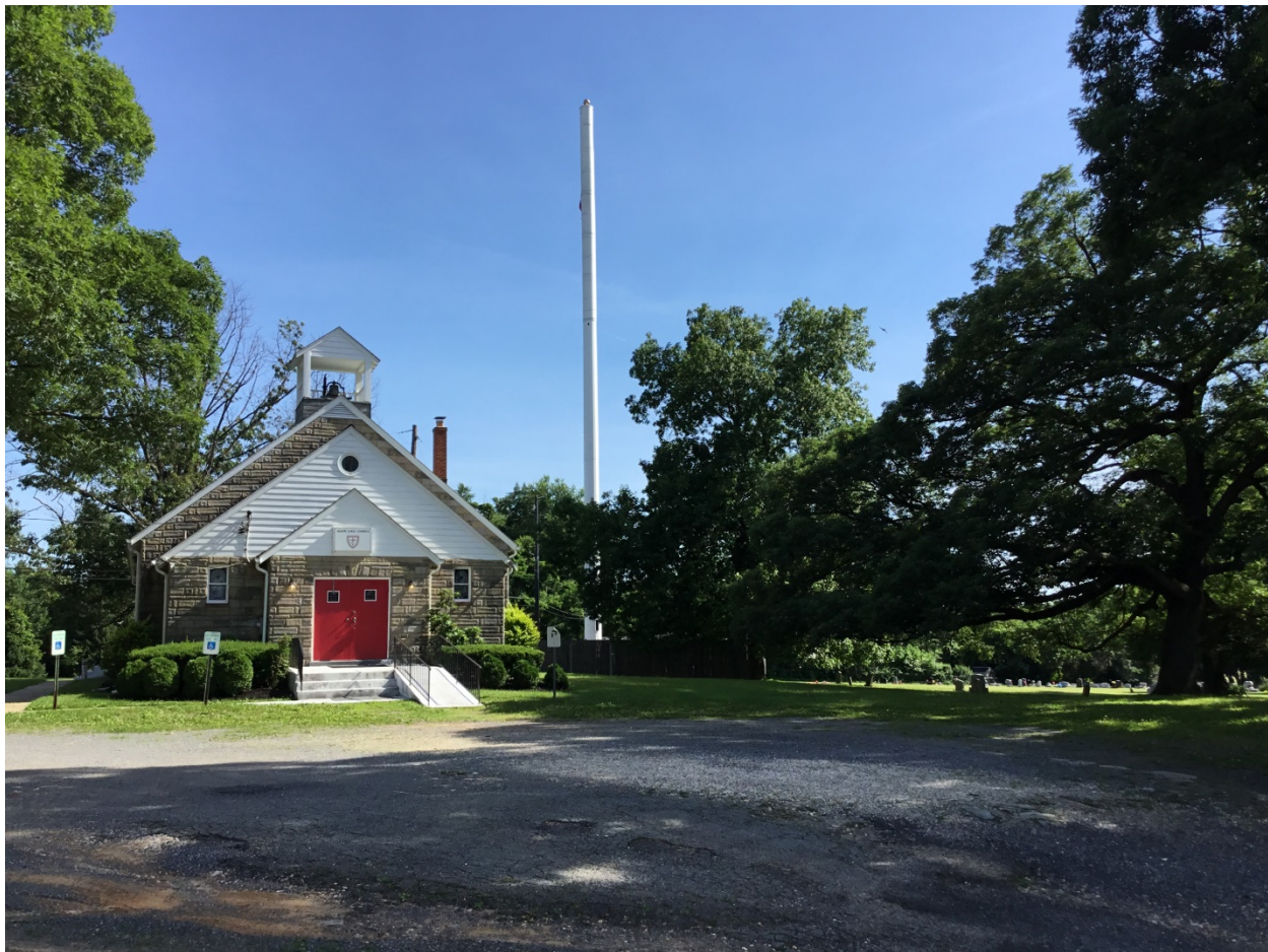
1. Approach to cemetery at church driveway, facing south-west