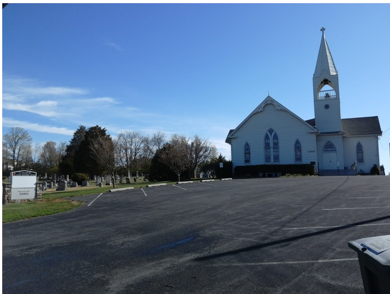
1. Approach to church and cemetery from Spire Street, facing east