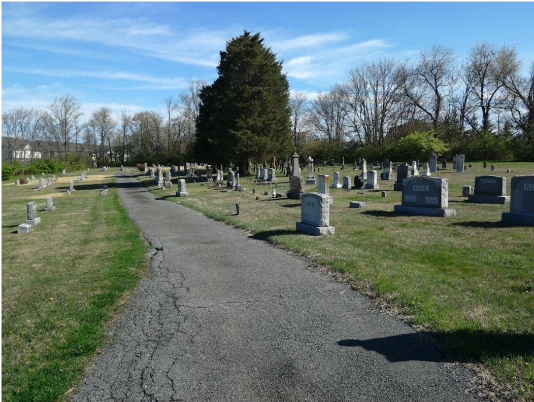
2. Driveway through cemetery, facing north