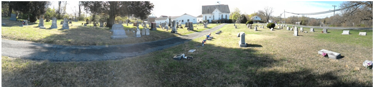
5. Panoramic from east to south to west