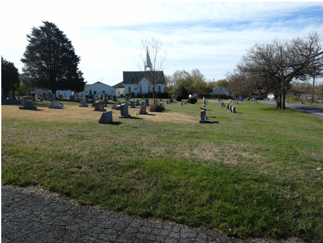
3. Center of cemetery on driveway, facing south