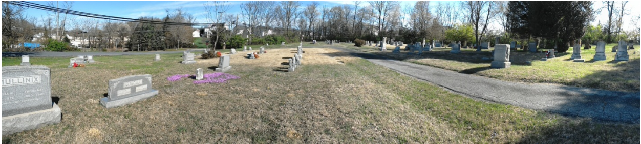
4. Panoramic from west to north to east