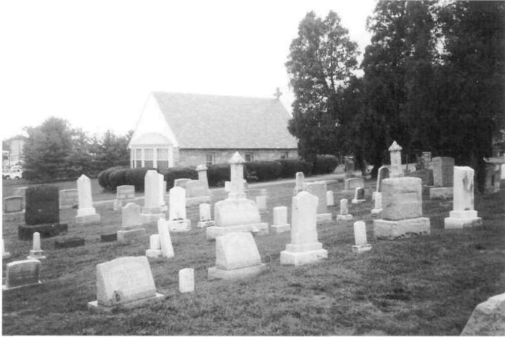
Damascus Methodist Cemetery Woodfield Road