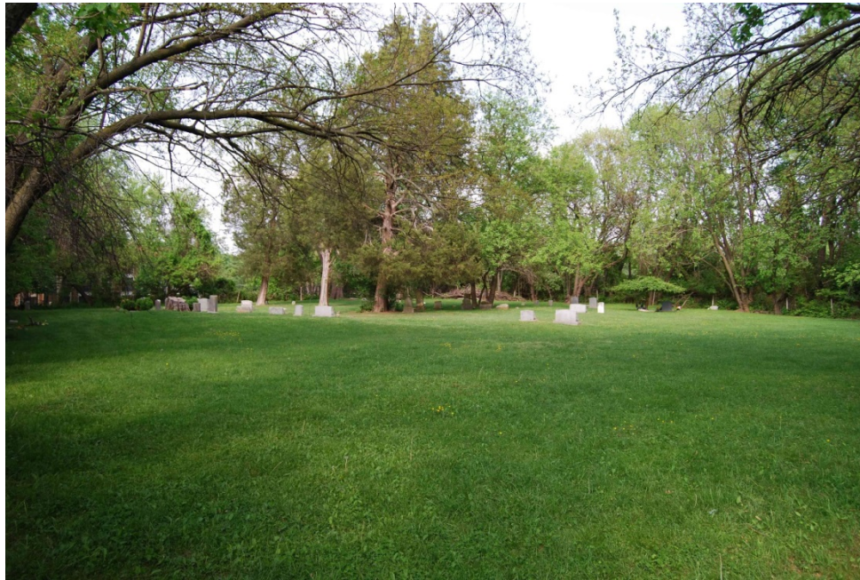
2. From gate towards center of cemetery.