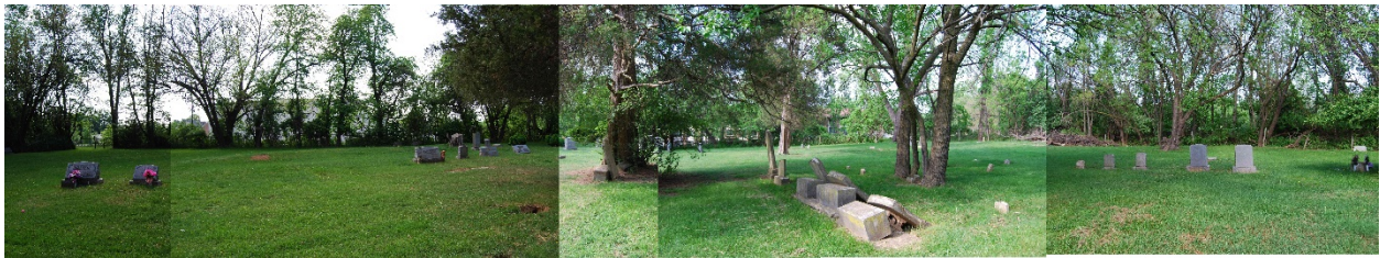
3. Panoramic west to north to east.