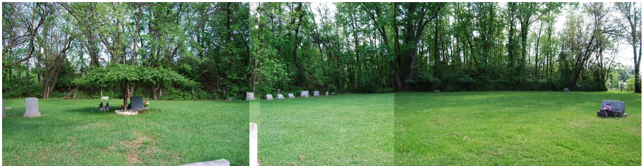
4. Panoramic east to south to west.