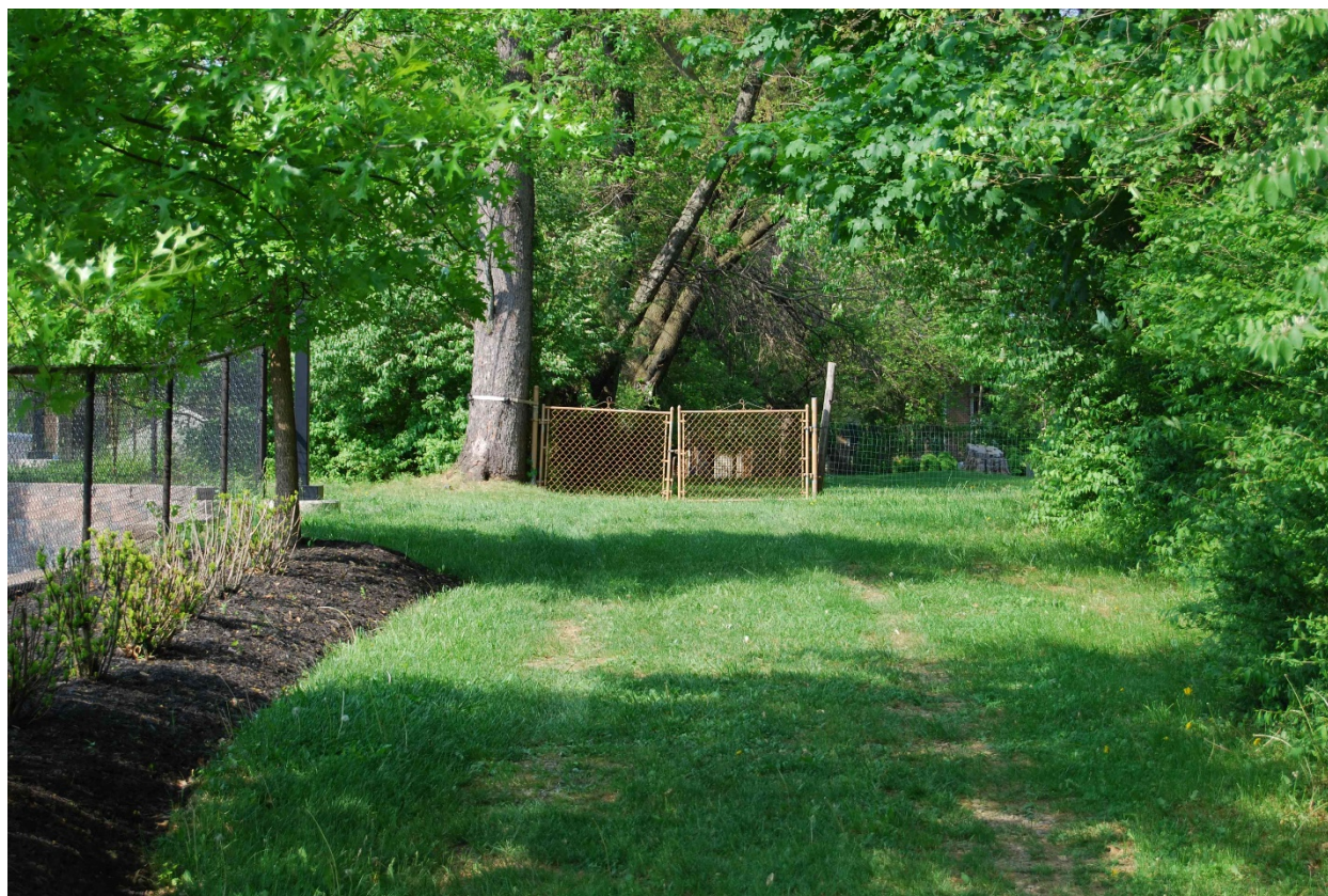
1. Along grass road, towards gate, facing east.