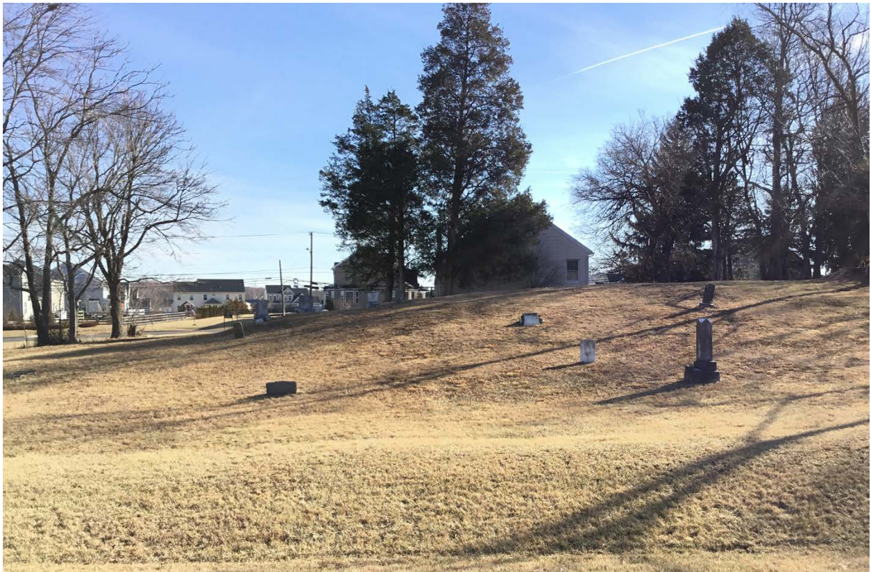
5. From center of cemetery, facing east, to old section