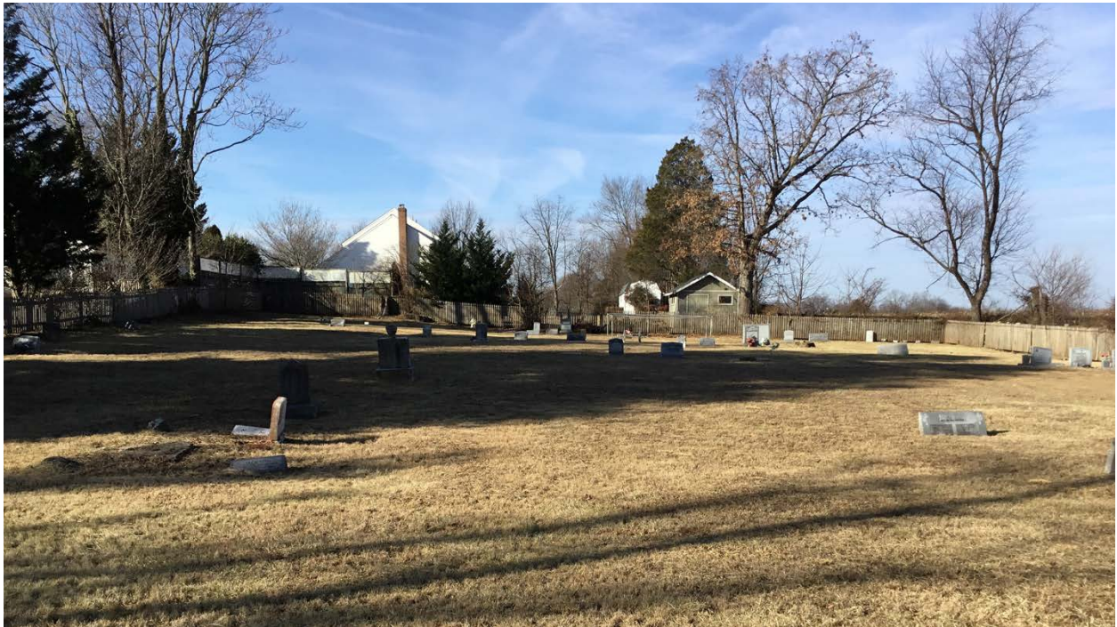
4. From center of cemetery, facing west, to new section