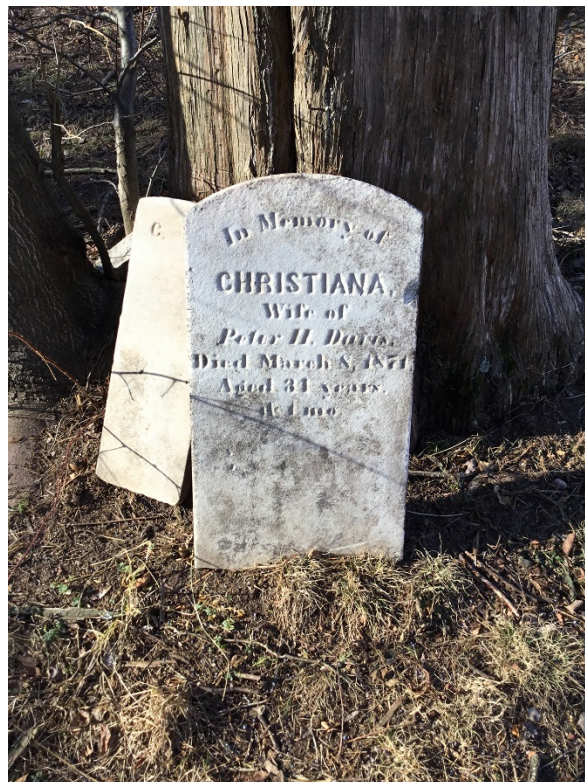
7. Oldest stone found from 1871