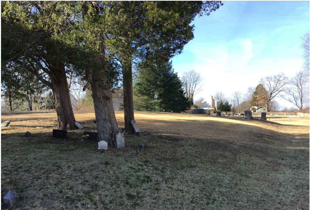
6. From old section, facing west, to new section