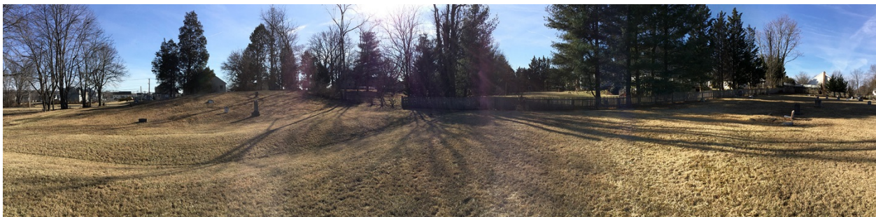
3. Panoramic from east to south to west