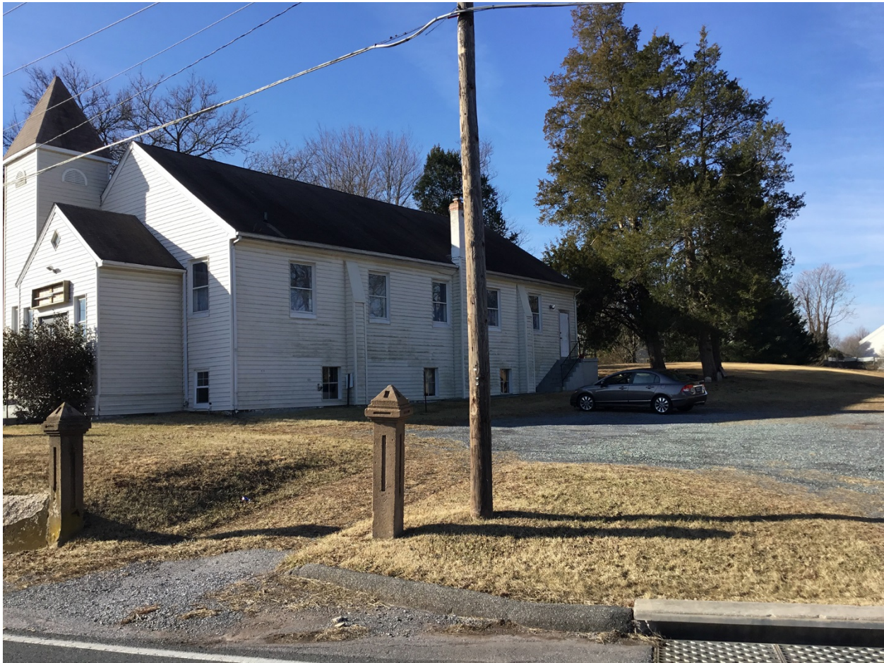
1. Entrance to cemetery from Elgin Road, facing west