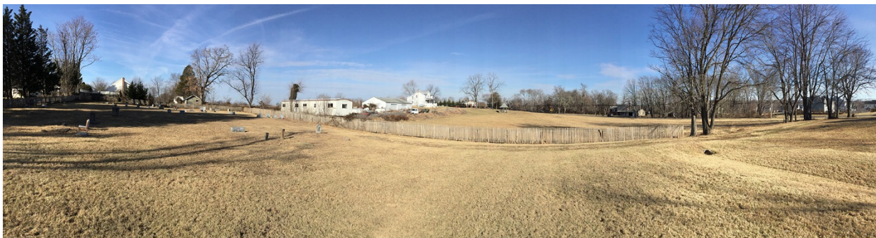
2. Panoramic from west to north to east