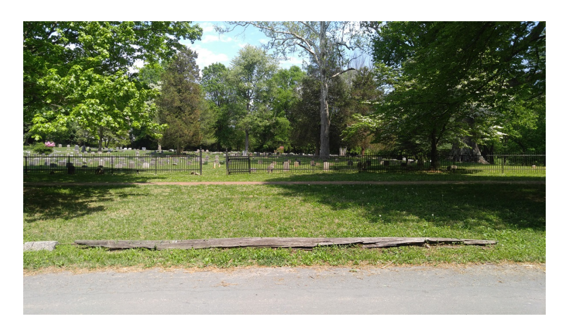
1. Cemetery from Meeting House Road, facing east