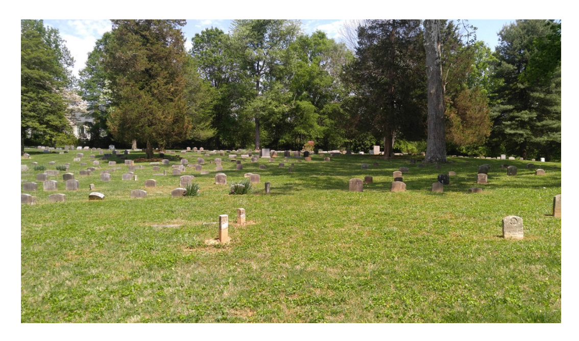
2. Approach to cemetery from entrance gate, facing east