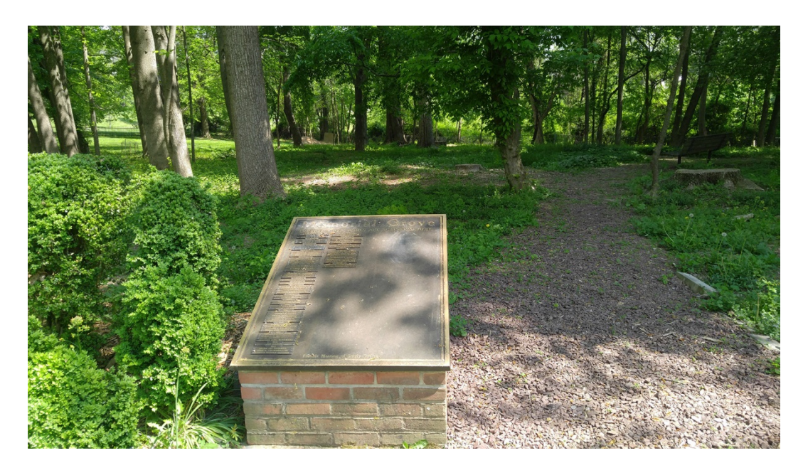
5. Memorial Grove for scattering ashes, facing southeast