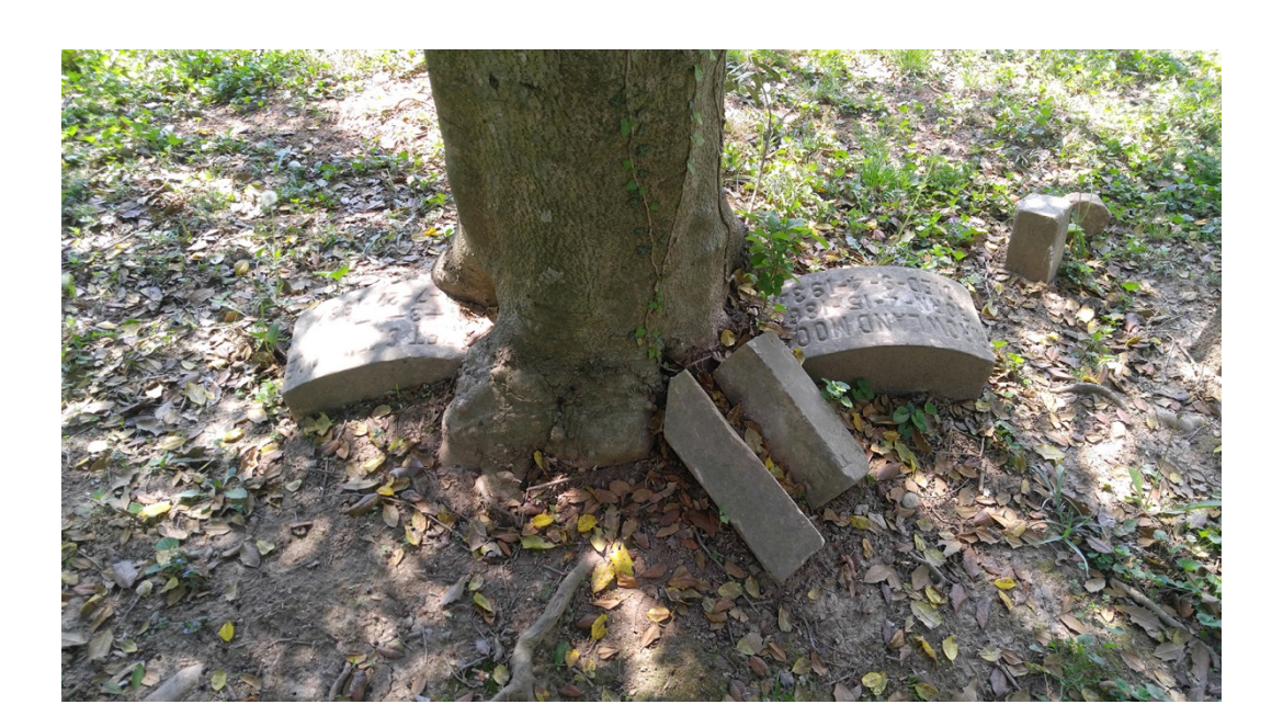
6. Tree roots encompassing grave markers