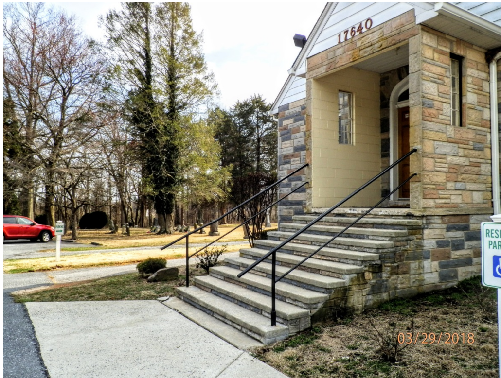
2. View to cemetery from church entrance, facing south