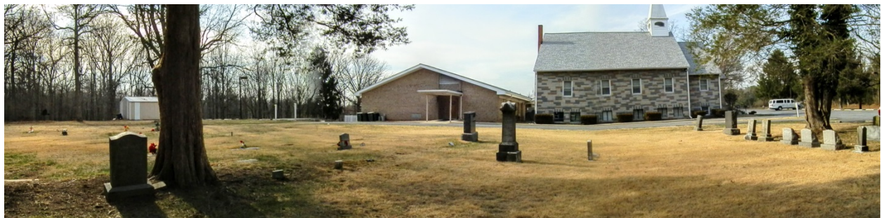
3. Panoramic from west to north to east