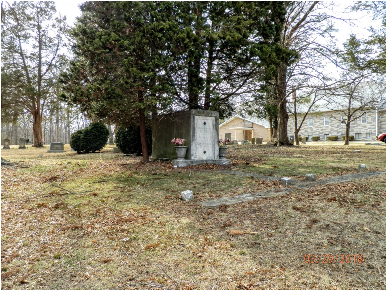
5. Mausoleum, facing north