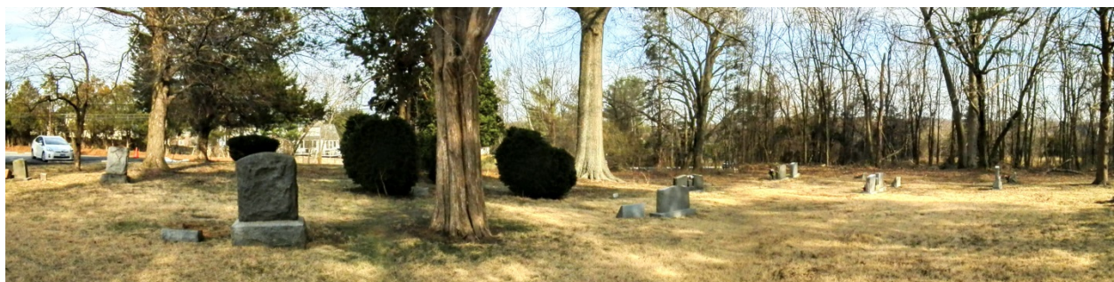
4. Panoramic from east to south to west