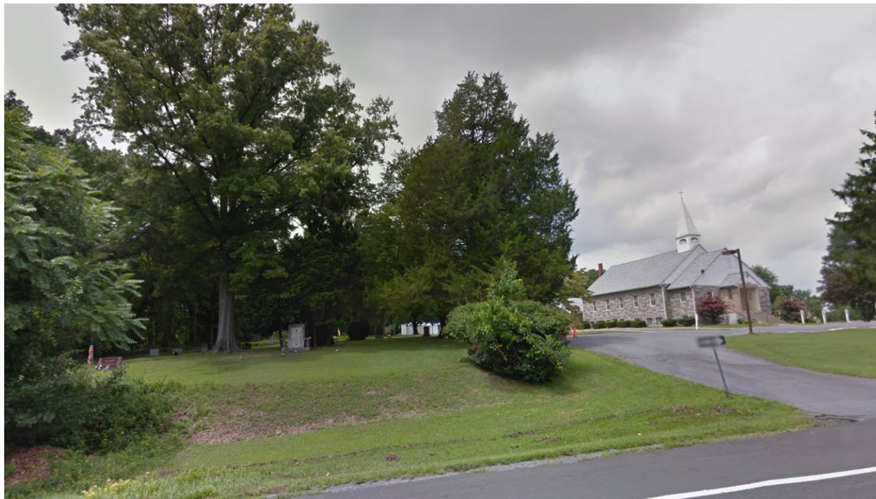
1. Approach to church from Riffle Ford Road, facing west (GoogleMap)