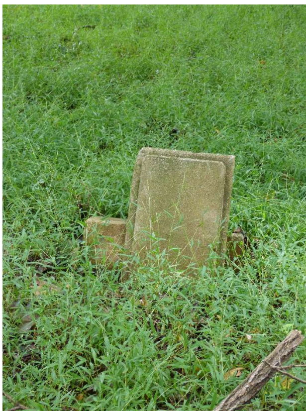
9. Unidentified cement marker