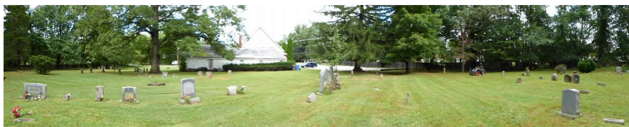
3. Panoramic from west to north to east