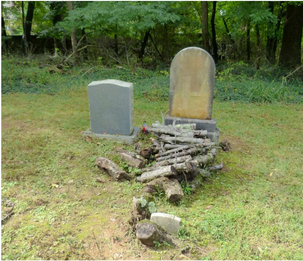
5. Wood pile stacked on grave, facing southwest