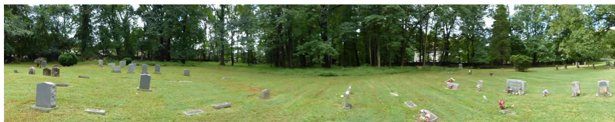
4. Panoramic from east to south to west