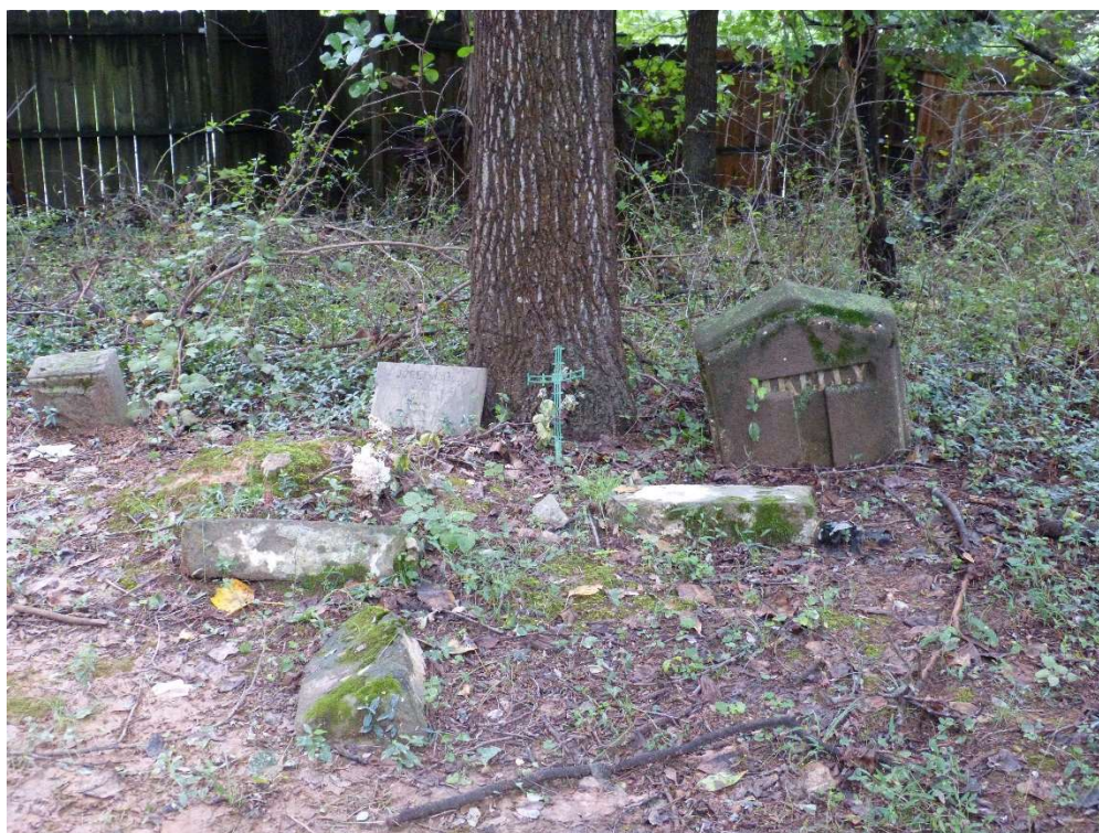
7. Southeast area along fence, facing south