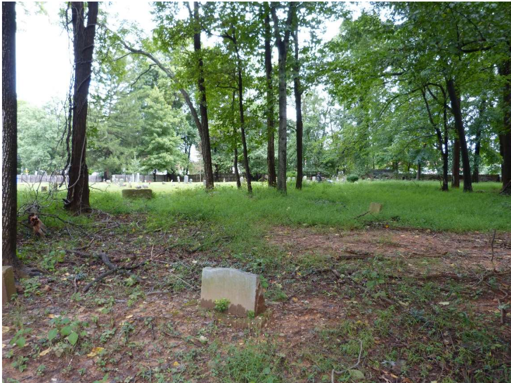
6. Grave markers in overgrown area, facing southwest