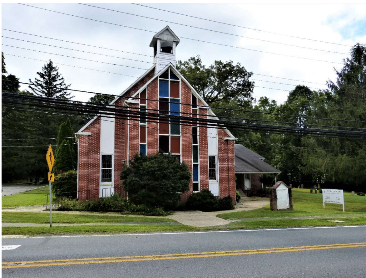
1. Front of church along Good Hope Road, facing east