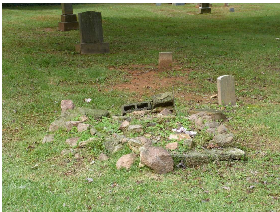
10. Collapsed box tomb, facing west