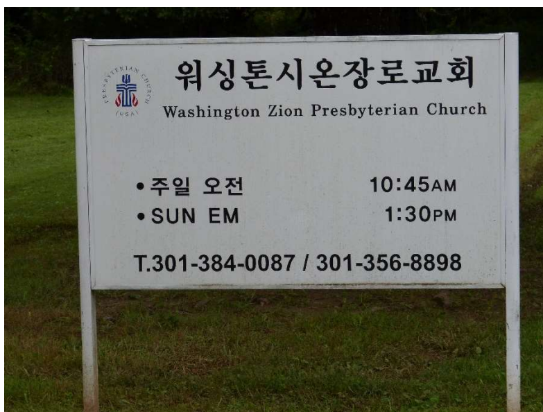
2. Church sign of new tenant, facing south