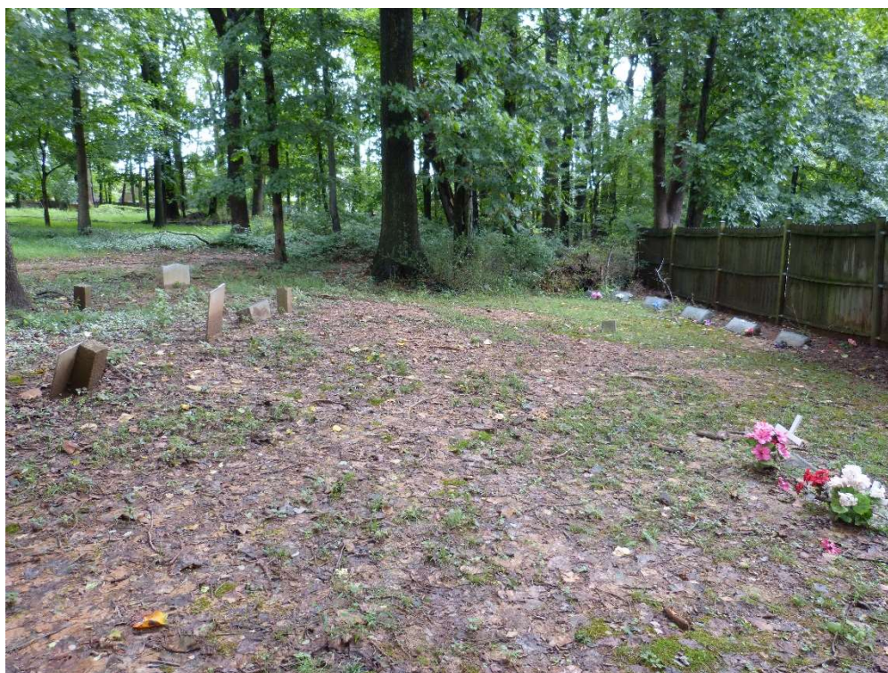
8. Unmaintained area, facing northeast