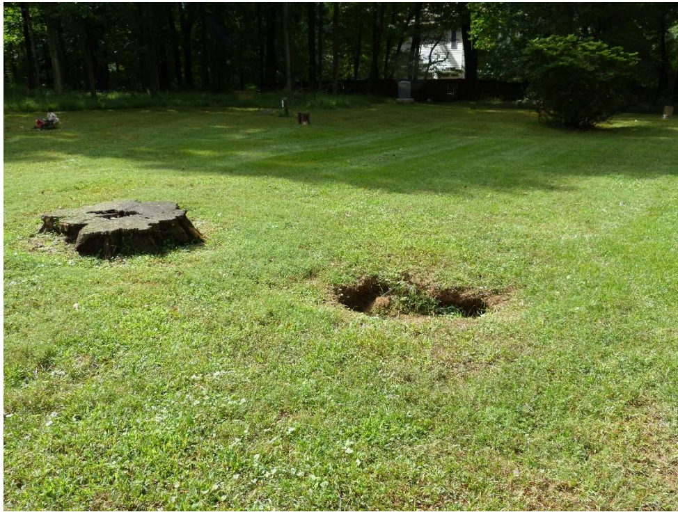
11. Collapsed sinkhole near tree stump