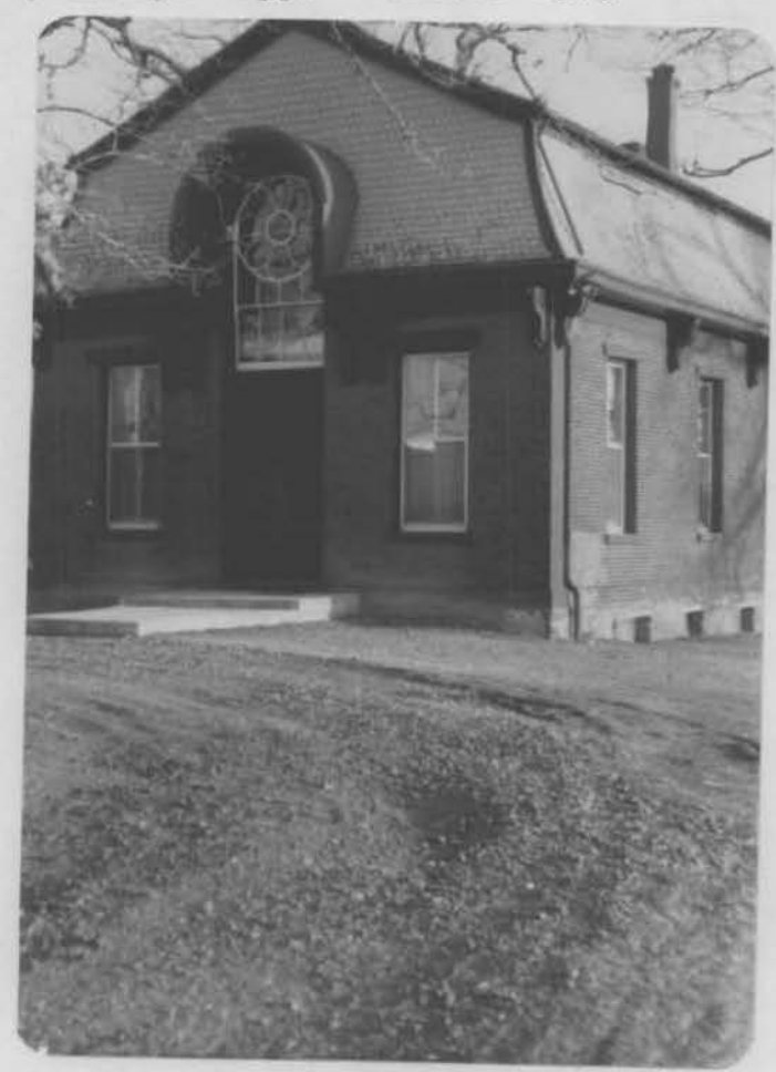
Photographs by Evelyn Ripps - Winter 1979